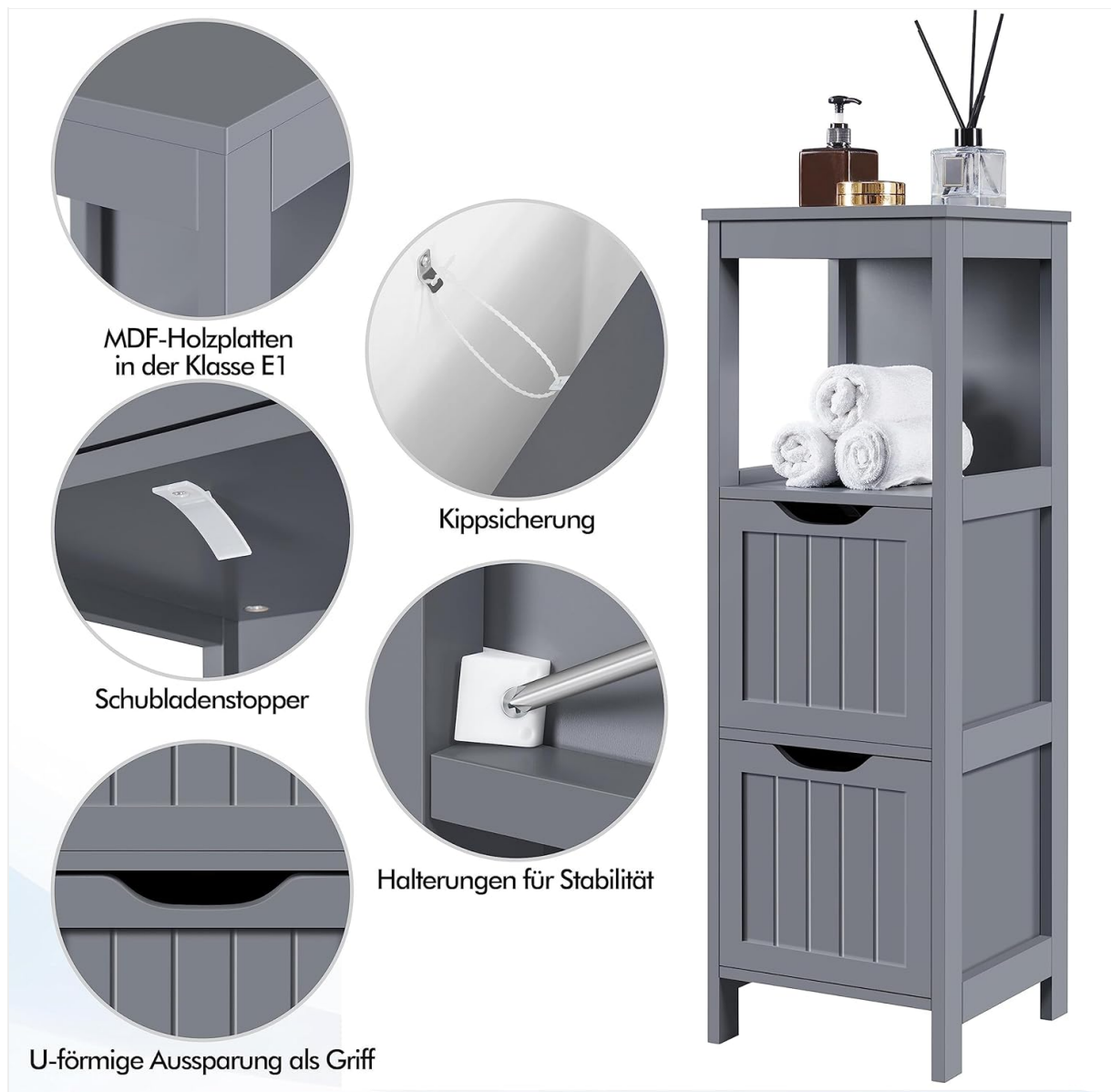
Image 4.1: This composite image provides close-up views of key features: the durable MDF wood panels, the anti-tip safety mechanism, the drawer stopper for smooth operation, and the ergonomic U-shaped cut-out serving as a handle for the drawers.