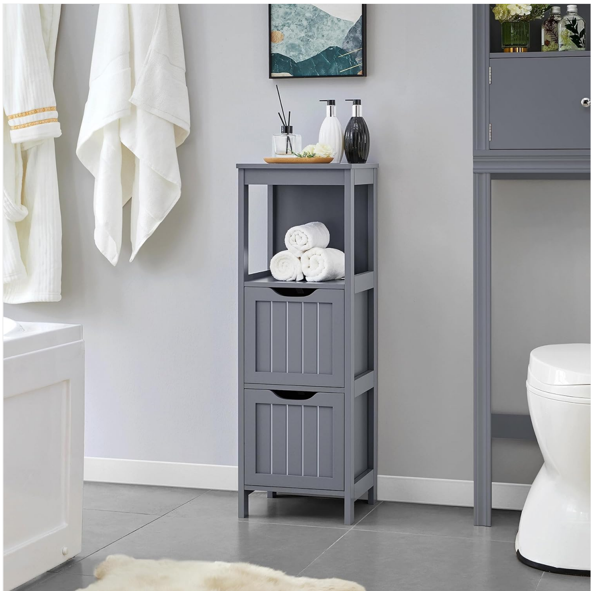
Image 1.1: The Yaheetech Bathroom Cabinet in a dark grey finish, positioned in a contemporary bathroom. It features an open shelf at the top, an open middle section with rolled towels, and two lower drawers, demonstrating its storage capabilities.