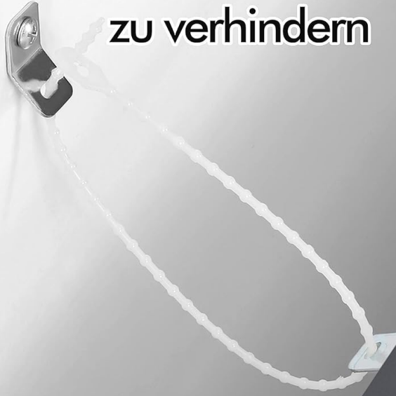
Image 2.1: This image demonstrates the proper installation of the anti-tip device. It shows the strap connecting the top rear of the cabinet to a wall anchor, emphasizing the importance of securing the cabinet for stability and safety.

An der Wand befestigen, um das Umkippen und Wackeln zu verhindern