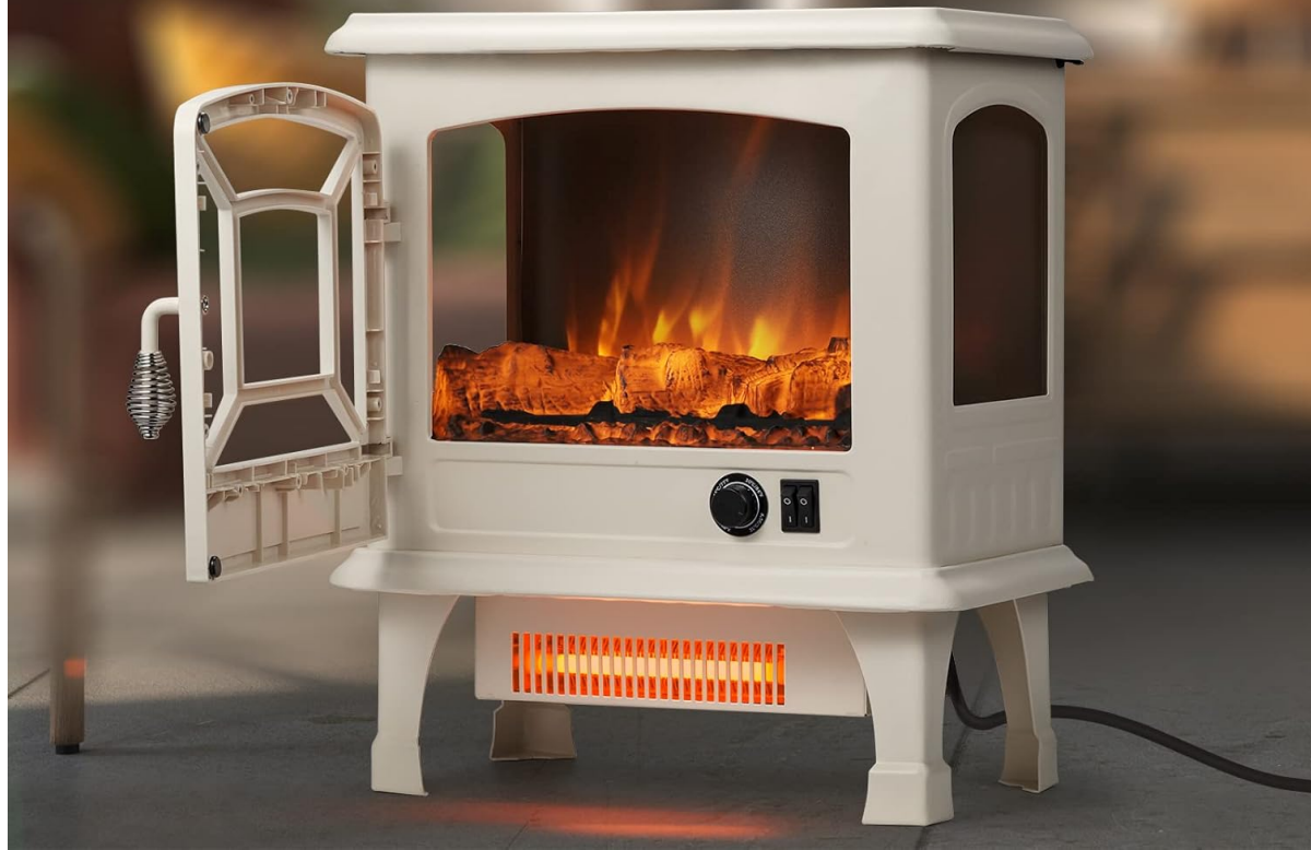
Figure 2: Simple Control Panel for easy operation.