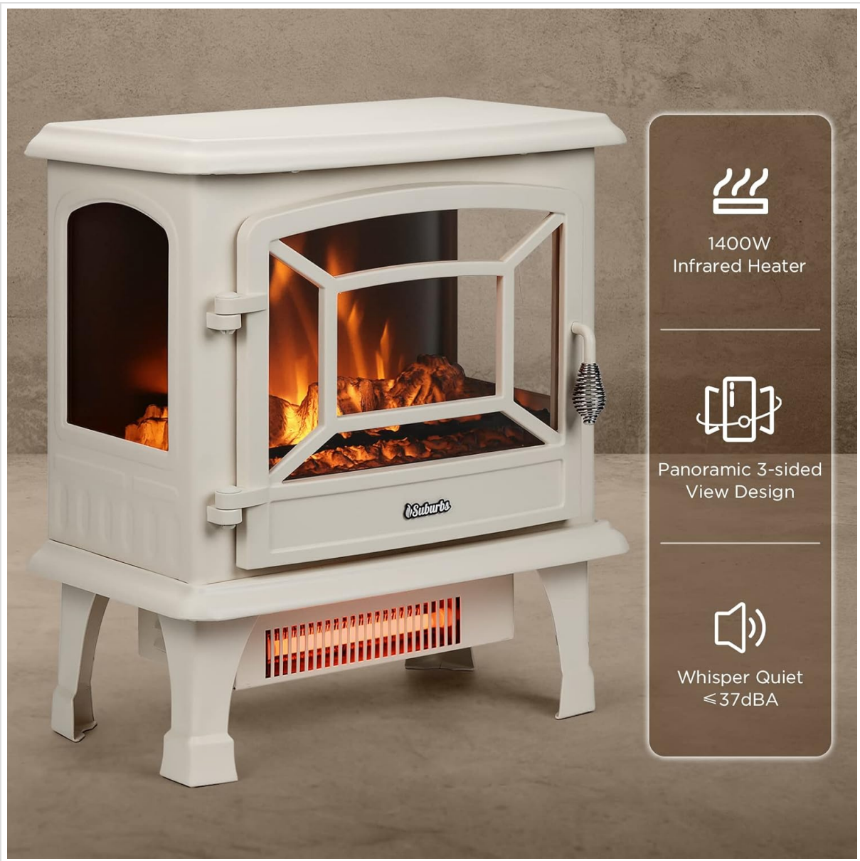
Figure 4: Key features including 1400W infrared heating and panoramic view.