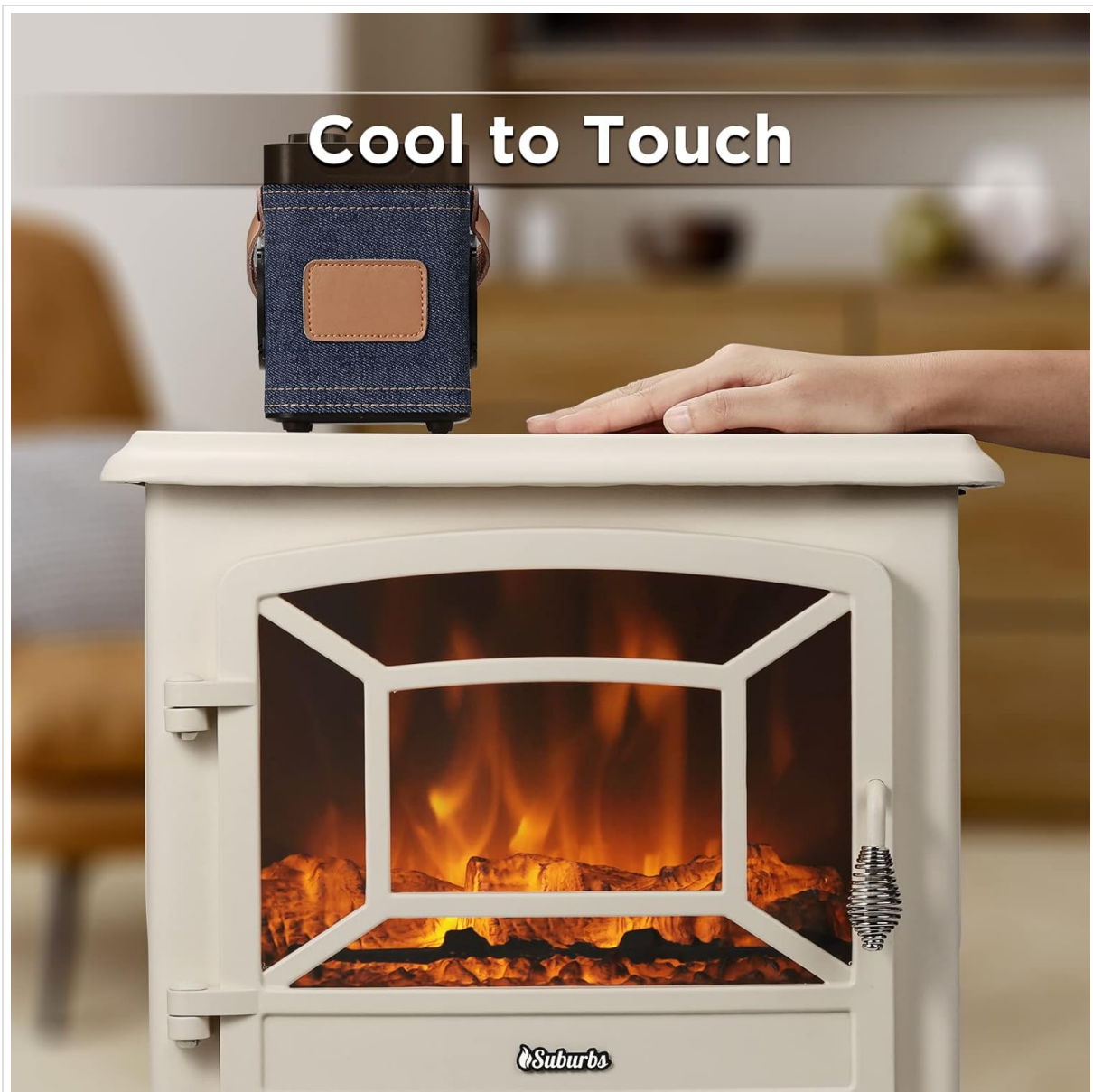
Figure 5: The exterior of the fireplace remains cool to the touch.

Video 1: Demonstration of the TURBRO Suburbs 20-inch Infrared Heater with Crackling Sound, showcasing its features and operation.