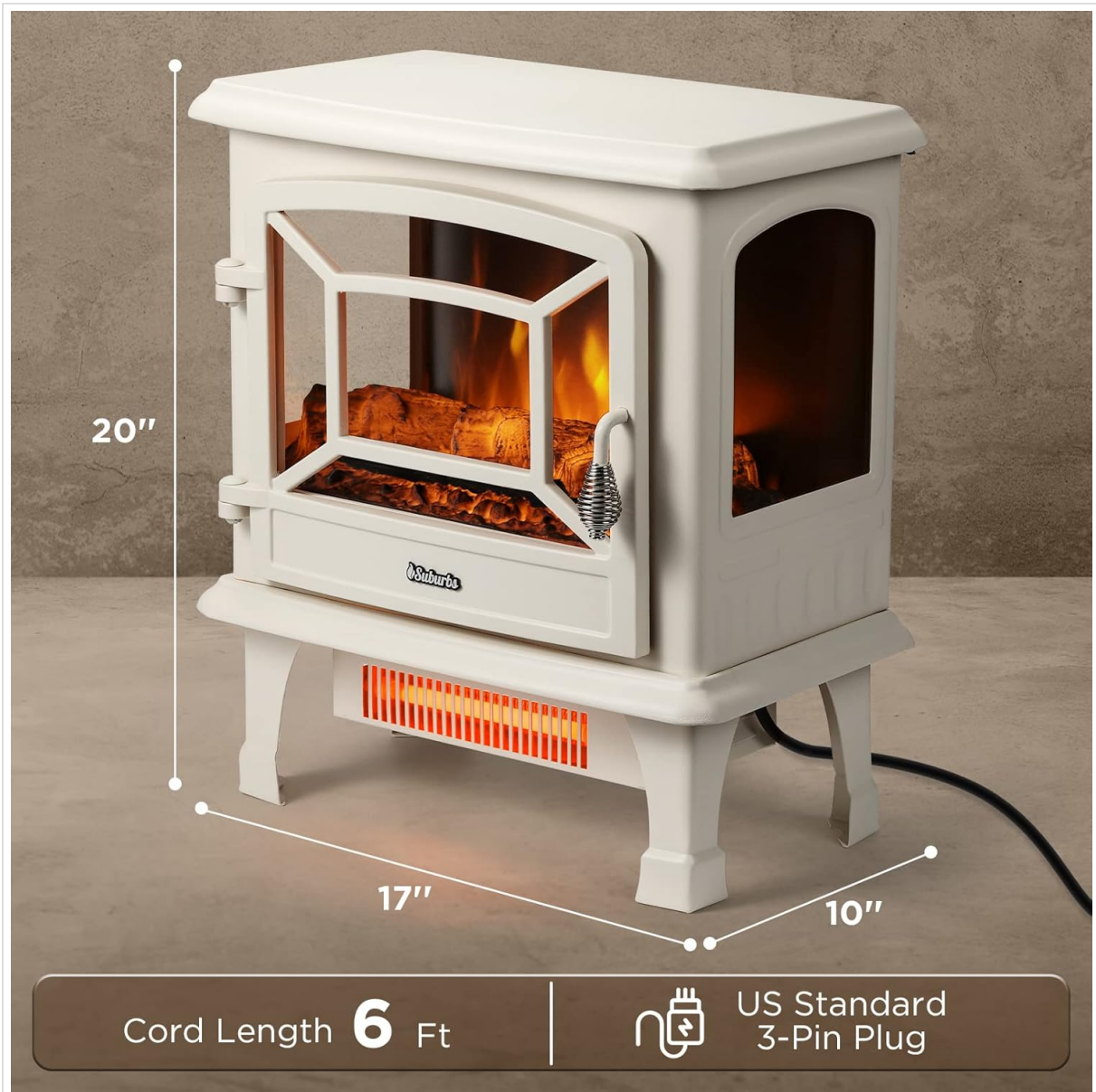
Figure 1: Product dimensions (10"D x 17"W x 20"H) and standard 3-pin plug.