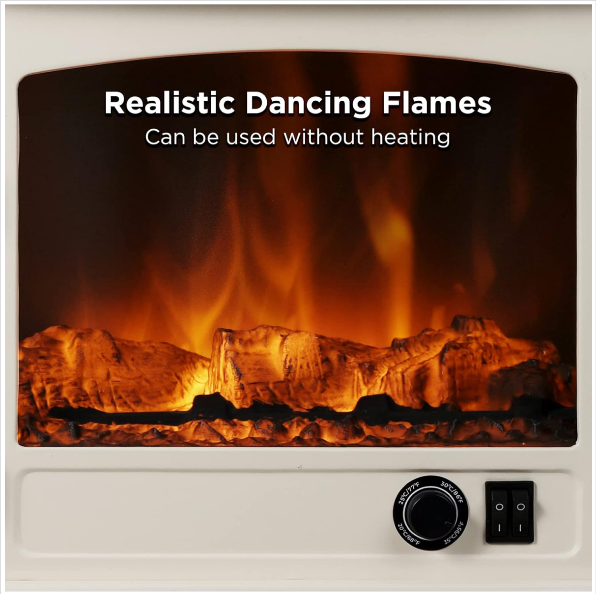
Figure 3: Realistic dancing flames can be used independently of the heating function.