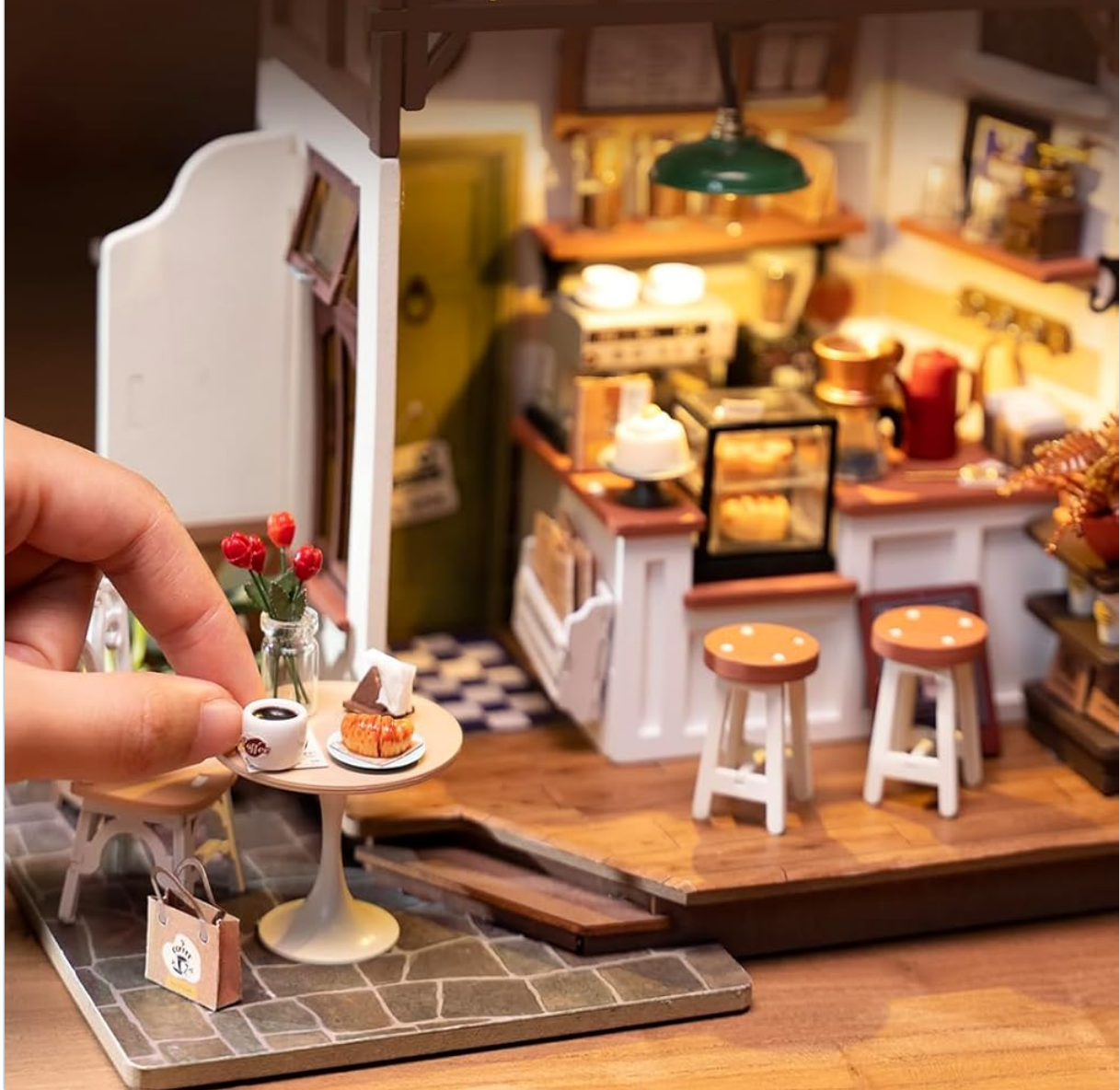
Image: Detailed interior of the miniature coffee shop, showcasing the coffee machine, display case, and seating.

Assemble the coffee machine, display case, and other counter elements as per the instructions. Ensure all small accessories like cups, plates, and food items are securely placed.