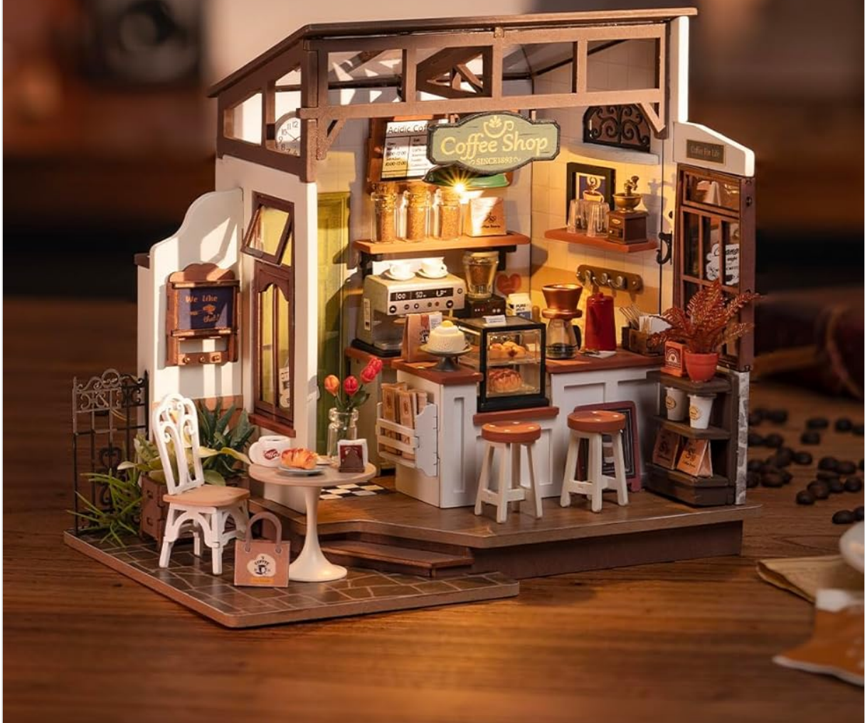
Image: The fully assembled miniature coffee shop, including the exterior patio and interior details.

Classic café | Upgraded insertion | LED ambient scene design light