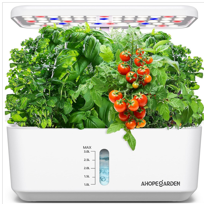
Image: The Ahopegarden Hydroponics System with various herbs and small tomatoes growing, showcasing its compact design and integrated LED light.

Your browser does not support the video tag.