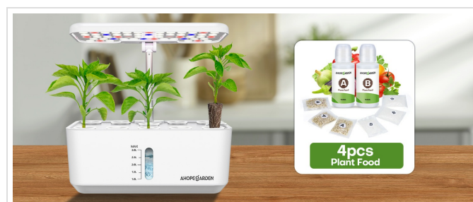
Image: The Ahopegarden Hydroponics System demonstrating the adjustable height feature of the LED grow light, accommodating plants at various growth stages.

As your plants grow, adjust the height of the LED grow light post to maintain an optimal distance from the plant canopy. The lamp arm can be adjusted up to 14.5 inches, allowing plants to grow up to 15.3 inches tall.