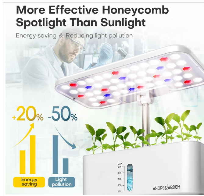
Image: The Ahopegarden Hydroponics System showing the 10 grow pods with clear covers and the water level indicator on the side.