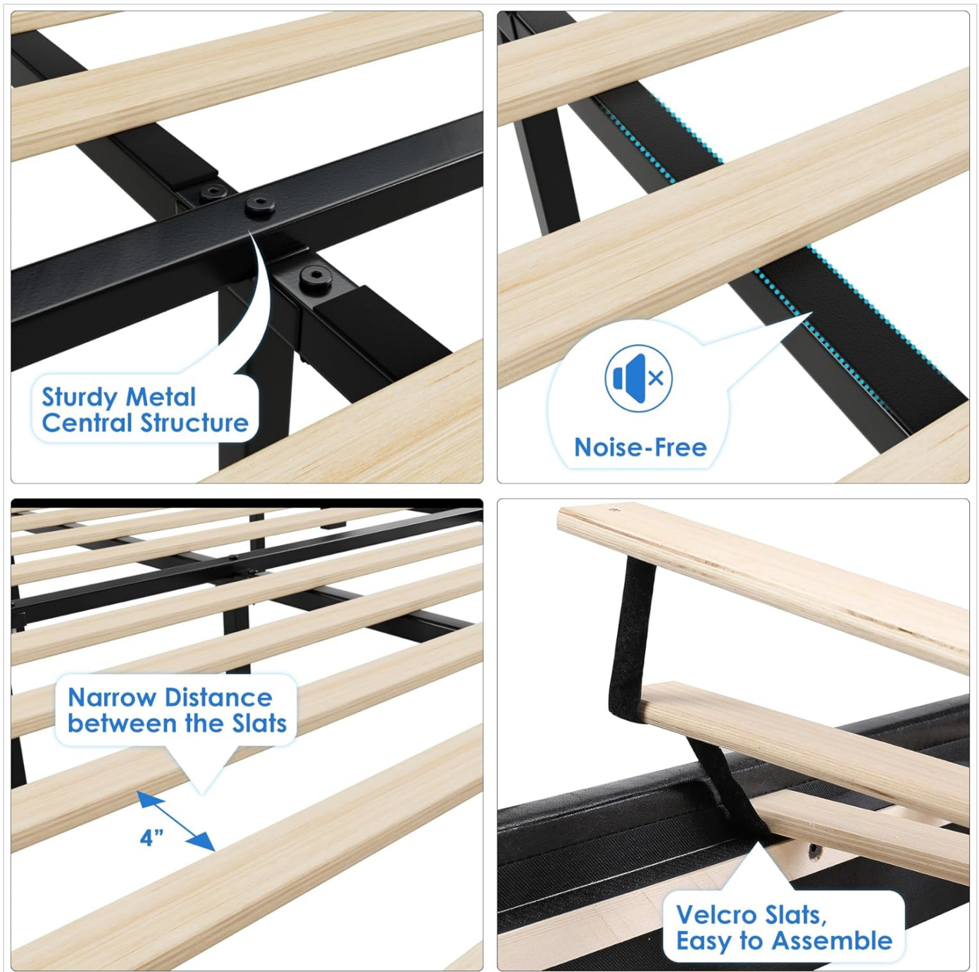
Figure 2: Detailed views of the bed frame's construction, highlighting the sturdy metal central structure, noise-free design, narrow 4-inch distance between slats, and easy-to-assemble Velcro slats.

For a visual guide on the assembly process and key features, please refer to the official product video below: