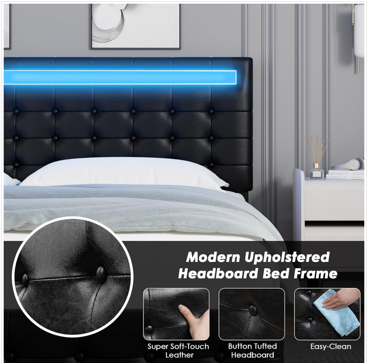
Figure 6: Detail of the upholstered headboard, illustrating its super soft-touch leather, button-tufted design, and easy-clean surface.