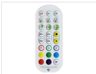
Figure 3: The 2.4G music controller remote for the LED lights, showing various color, mode, speed, and timer buttons.

1. Remote Control: Use the included 2.4G music controller to adjust colors, modes, brightness, and set timers. Ensure the remote has working batteries.