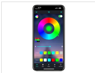
Figure 4: Screenshot of the smartphone application interface for controlling the LED lights, featuring a color wheel and various preset options.

2. Smartphone Application (Bluetooth APP Control): Download the dedicated app to control the lights from your smartphone. This offers more precise color selection and advanced features like music mode and detailed timer settings.