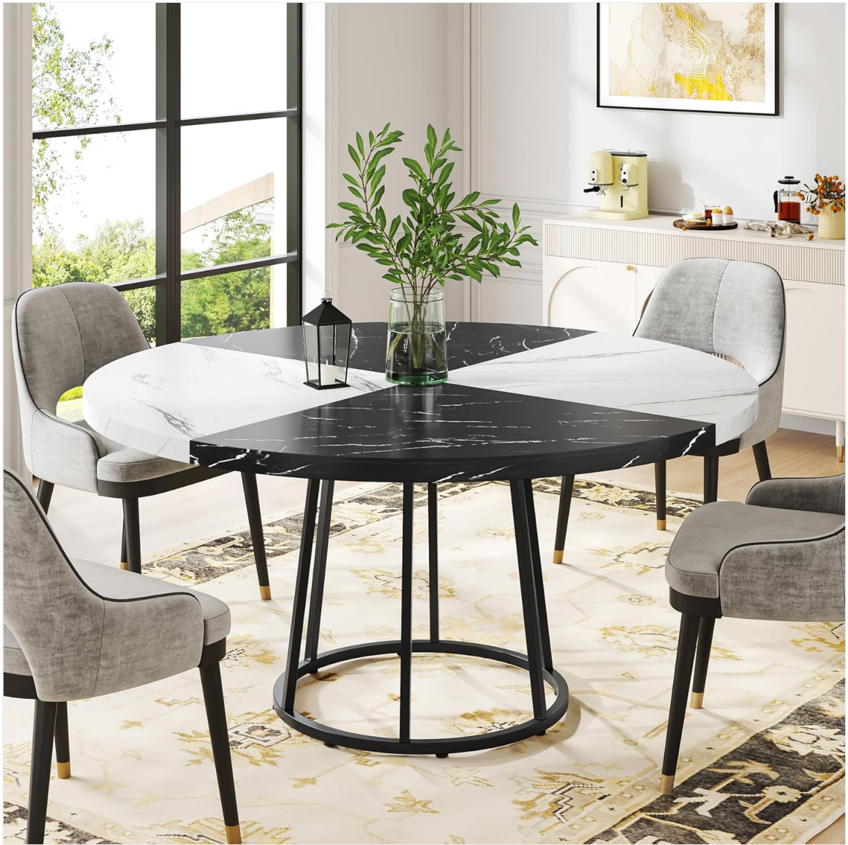
Image: Tribesigns 47-inch Round Dining Table in a dining room setting with chairs. This shows the table in a typical use environment.