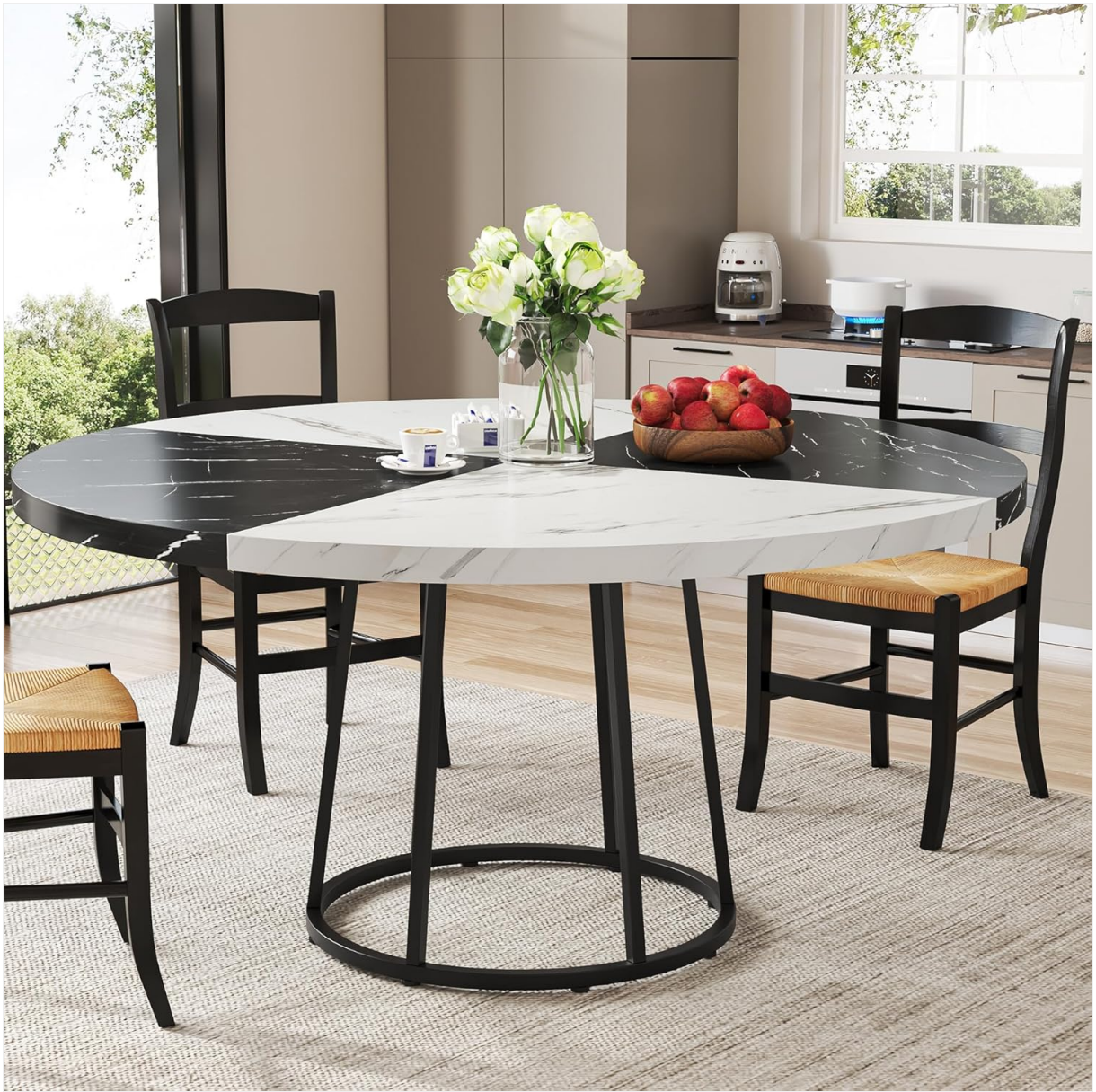
Image: Tribesigns 47-inch Round Dining Table in a kitchen setting. This demonstrates the table's versatility in different home areas.