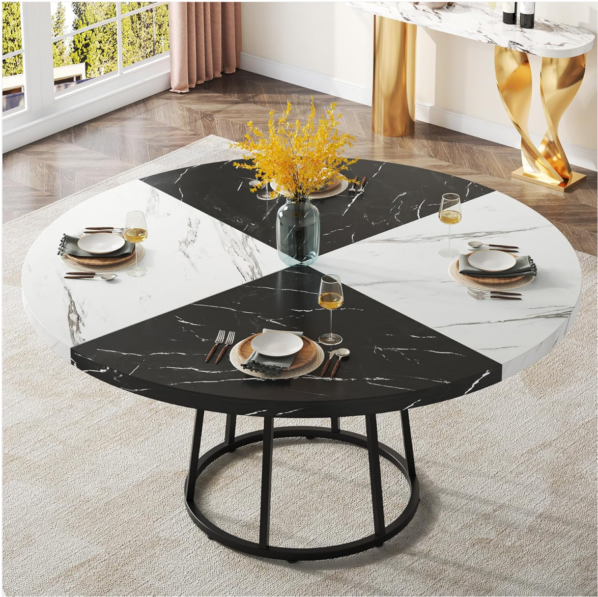
Image: Top-down view of the Tribesigns 47-inch Round Dining Table with place settings. This perspective highlights the tabletop design and seating capacity.