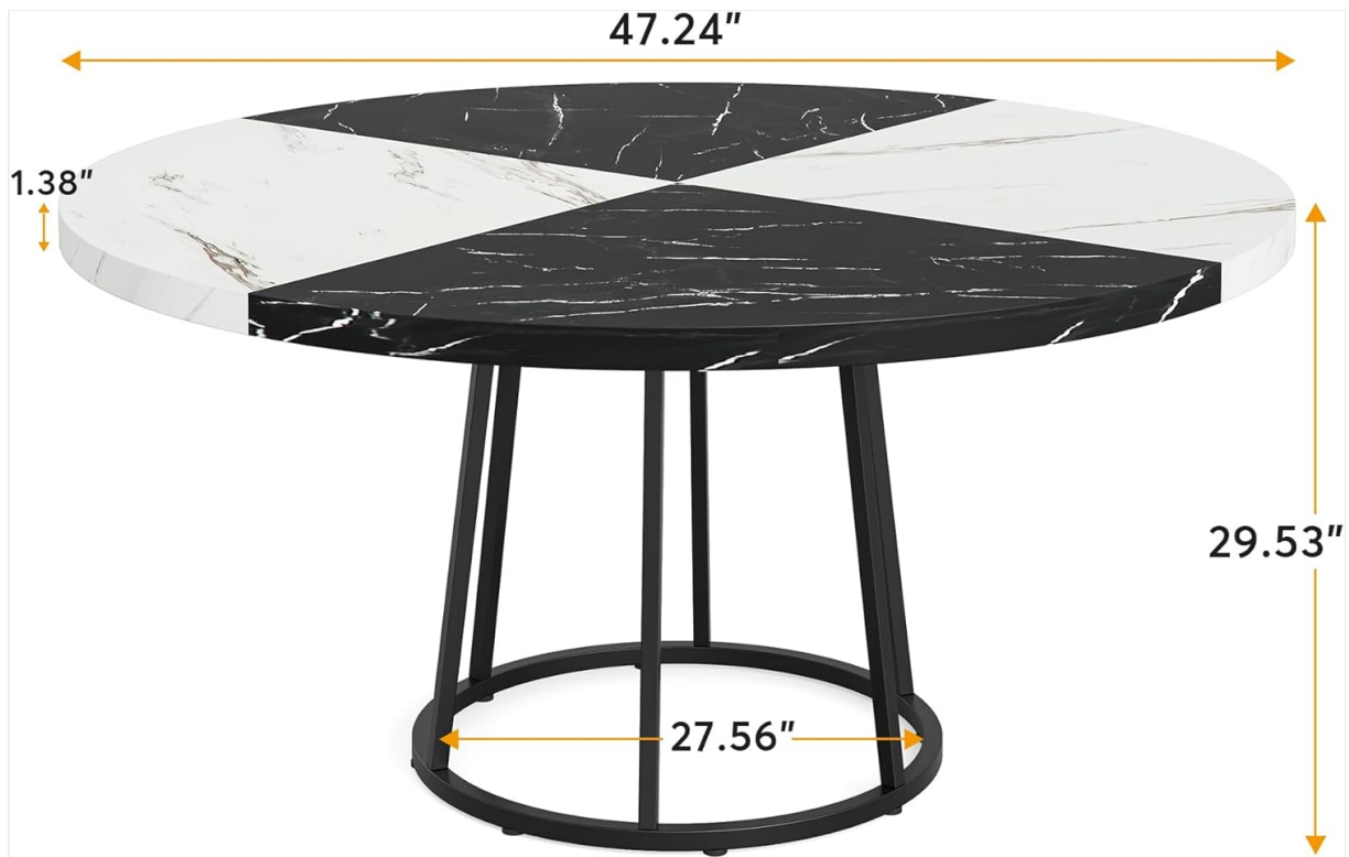
Image: Tribesigns 47-inch Round Dining Table with dimensions. This image provides a clear visual of the table's overall size and proportions.