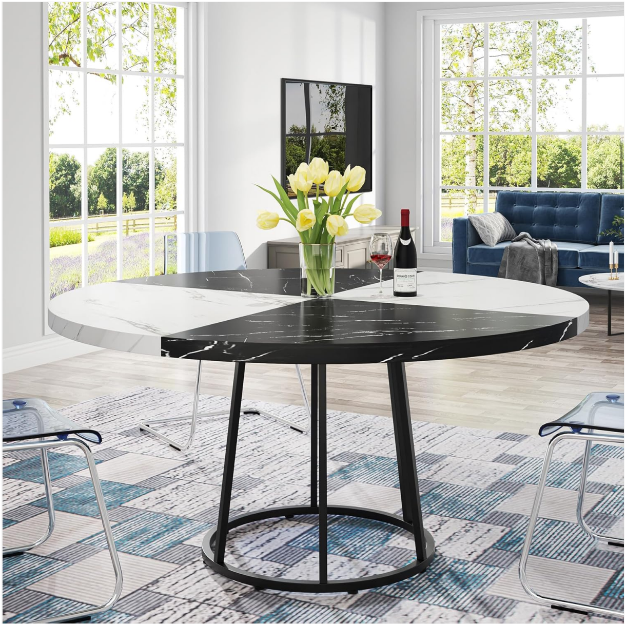
Image: Tribesigns 47-inch Round Dining Table in a living room setting. This illustrates how the table can integrate into various interior designs.