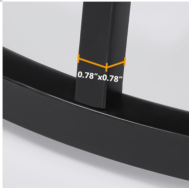
Image: Close-up of the faux marble tabletop and metal frame details. This shows the thickness of the tabletop and the connection points for the metal frame.