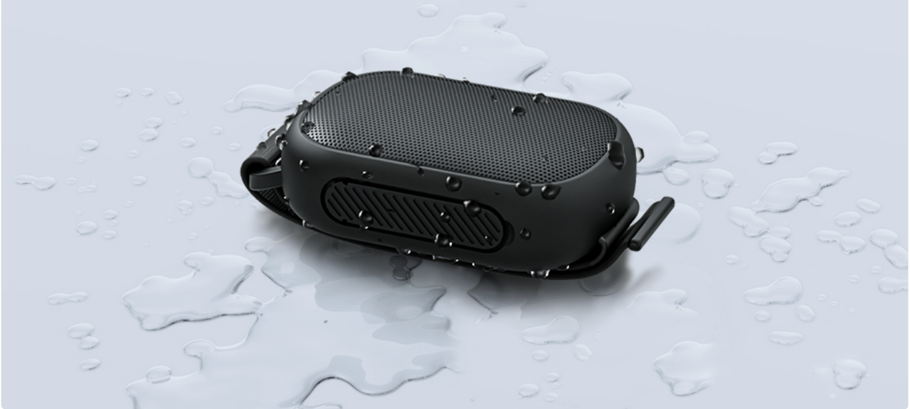
Image: Overview of the TONEMAC TM-B2 speaker highlighting its key features like Bluetooth 5.3, IP67 rating, lightweight design, and dynamic driver.

Allowing you to bring your speaker anywhere, you can enjoy music in the beach, bathroom, and other places.