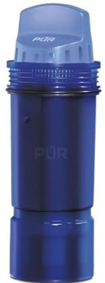
Image: The PUR Genuine Filter seal, indicating authenticity and proper filtration.

Be cautious of look-alikes. Our trademarked seal is only visible on a certified Genuine PUR product.