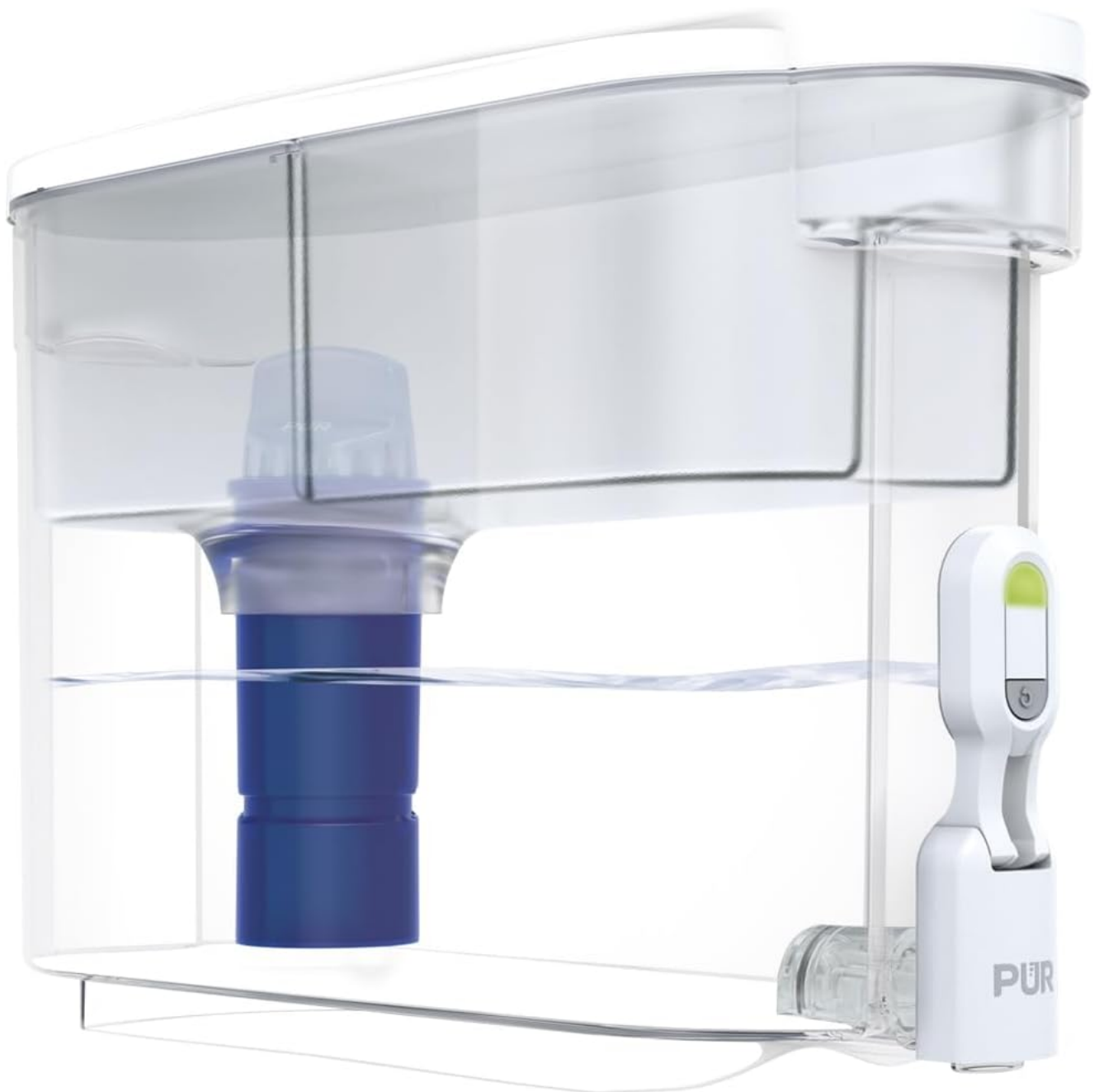
Image: Front view of the PUR 30-Cup Water Filter Dispenser, showcasing its clear design and internal filter.