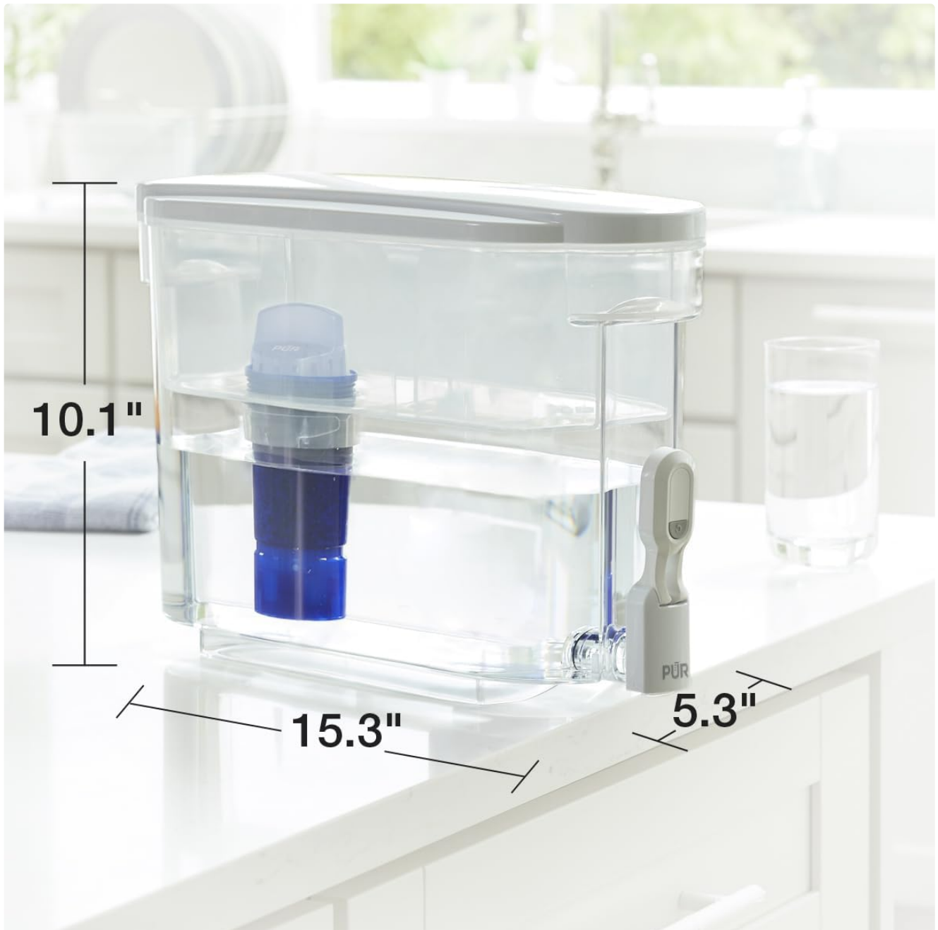
Image: Visual representation of the dispenser's dimensions: 15.3 inches length, 5.3 inches width, and 10.1 inches height.