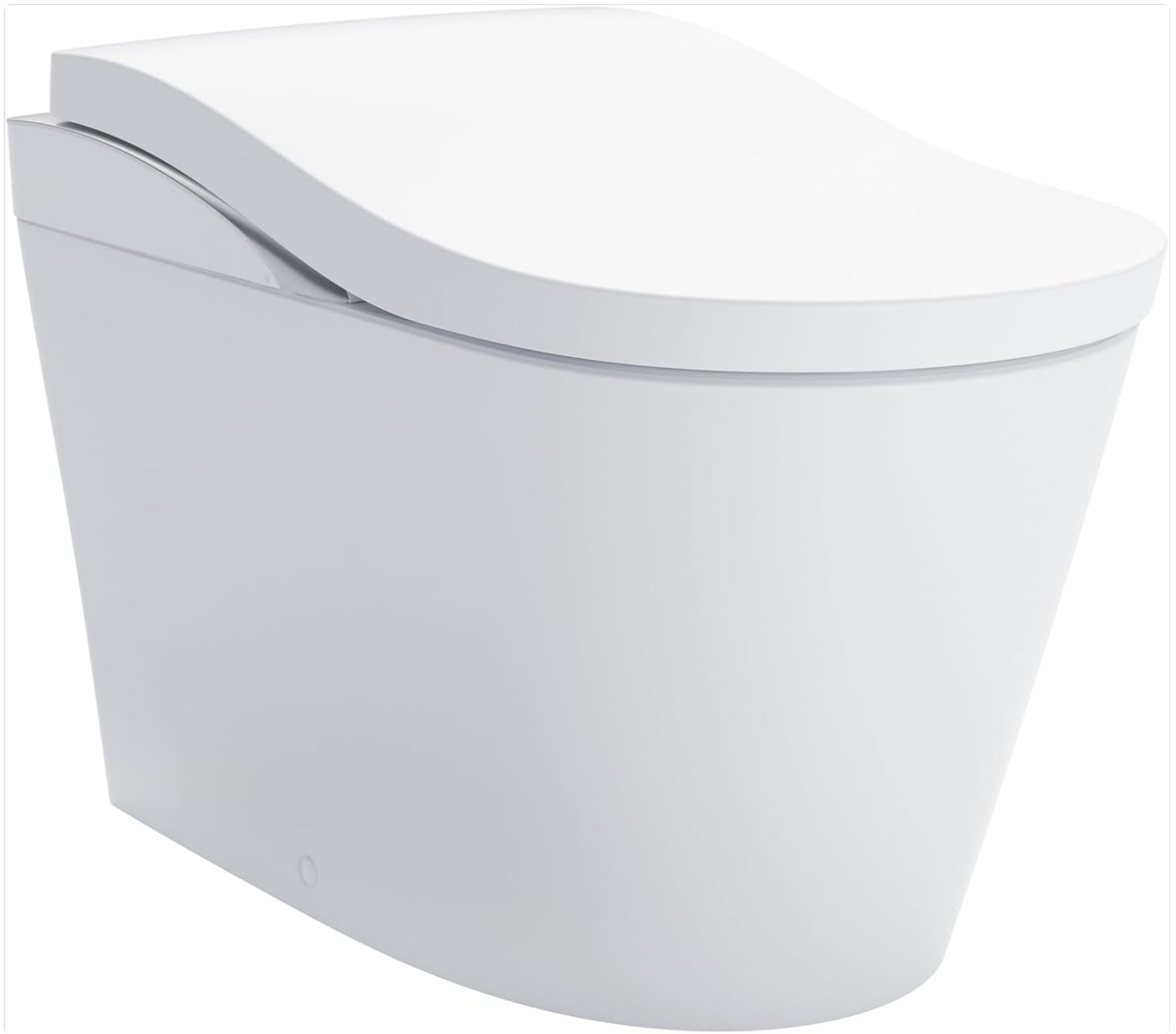
Image 1.1: Front view of the TOTO Neorest LS Integrated Bidet Toilet. This image displays the sleek, skirted design of the toilet in Cotton White, with the lid closed.