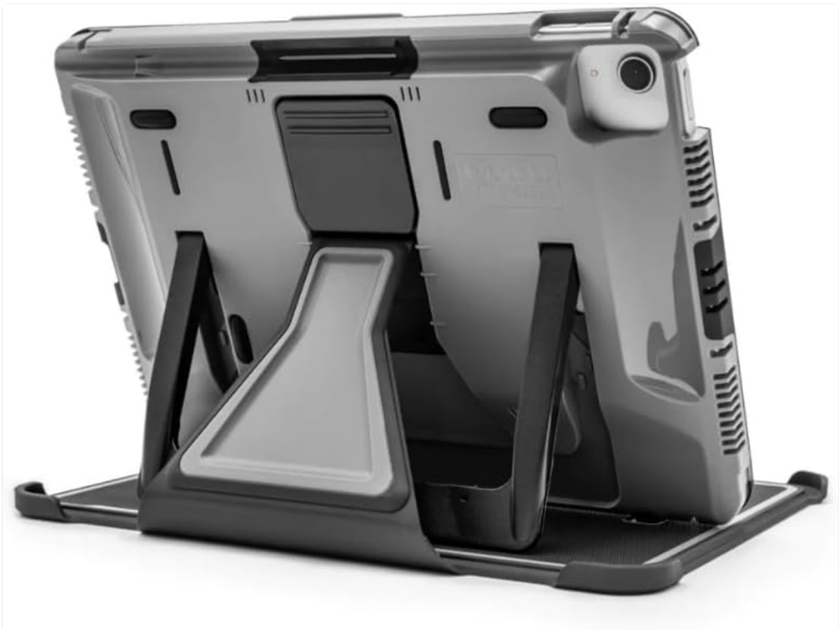
Image: Rear view of the PIVOT A22A Atlas Tablet Case with an iPad inserted, demonstrating the integrated kickstand in an open position.