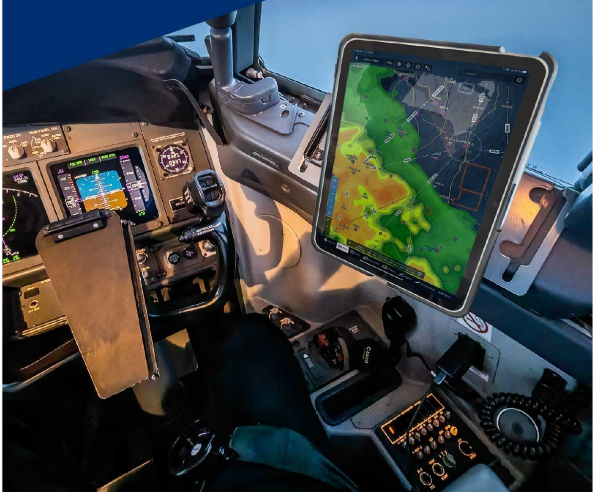
Image: An iPad secured within a PIVOT case, mounted within an aircraft cockpit, demonstrating its intended use in aviation environments.