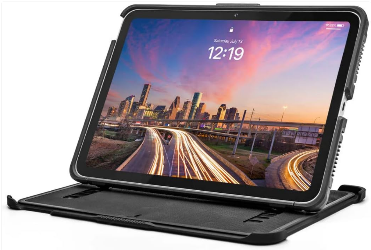
Image: The PIVOT A22A Atlas Tablet Case holding an iPad, with the folio cover folded to create a stable viewing stand.