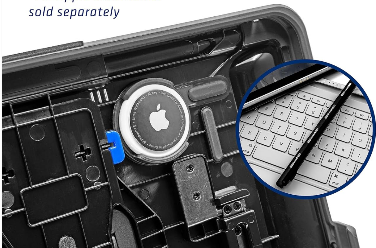
Image: A detailed view of the PIVOT A22A Atlas Tablet Case, highlighting the integrated storage for an Apple Pencil and a socket for an Apple AirTag.