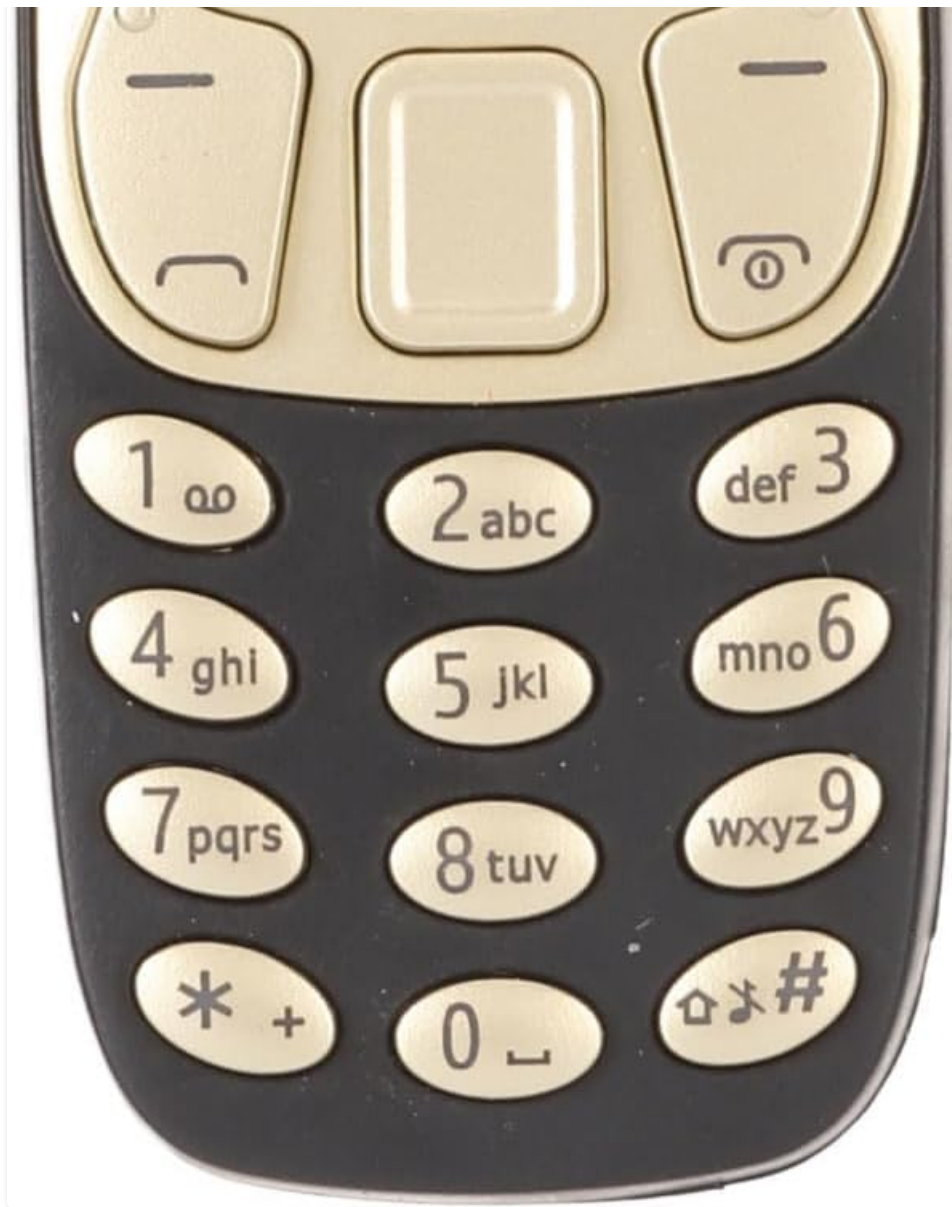
Figure 1.1: Front view of the Jectse Mini Bluetooth Phone.