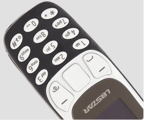
Figure 6.3: The phone features large, easy-to-press buttons.