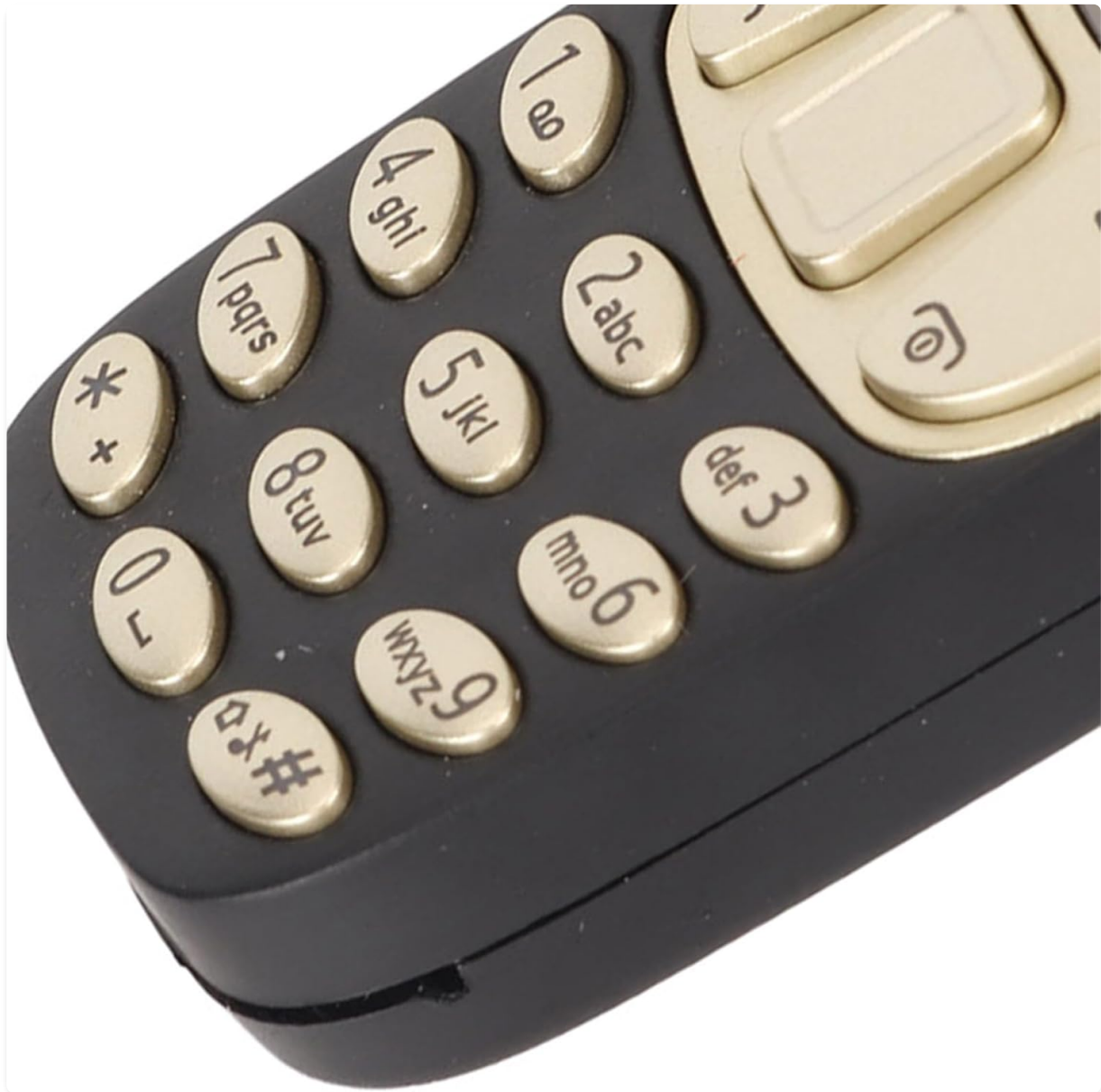
Figure 5.1: The phone's keypad with large, clear buttons.