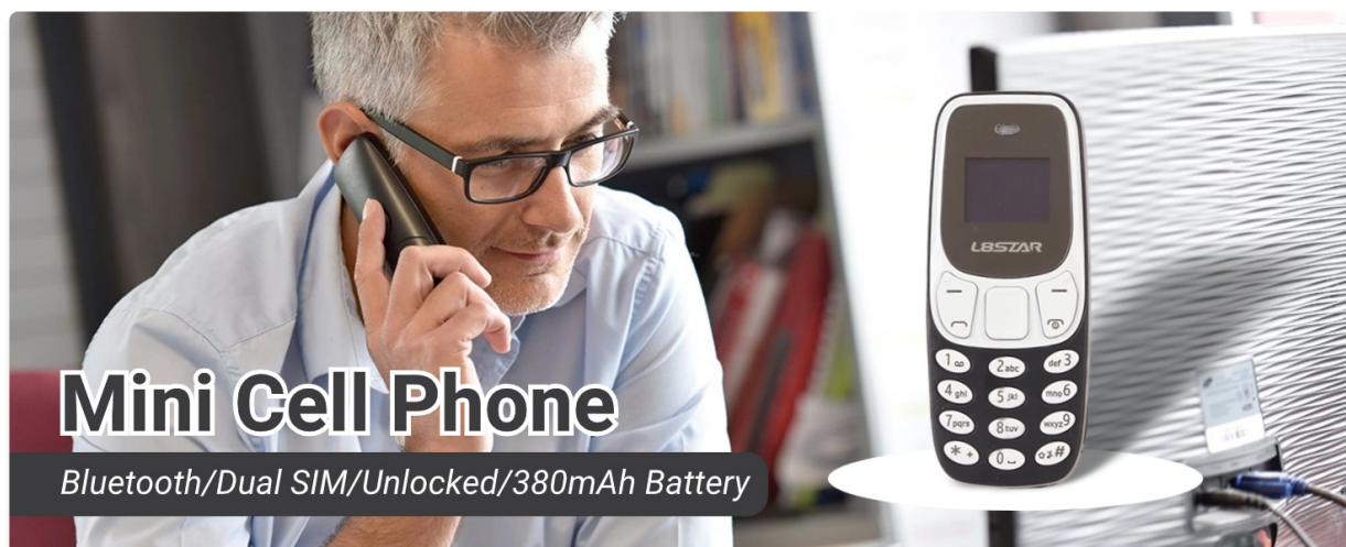
Figure 2.1: Overview of the Jectse Mini Phone's main features.

The Jectse Mini Bluetooth Phone is a compact mobile device featuring dual SIM support, Bluetooth connectivity, and a voice changer function. It operates on GSM 2G networks and is designed with low radiation for user safety. Its intuitive keypad and clear display ensure straightforward operation.