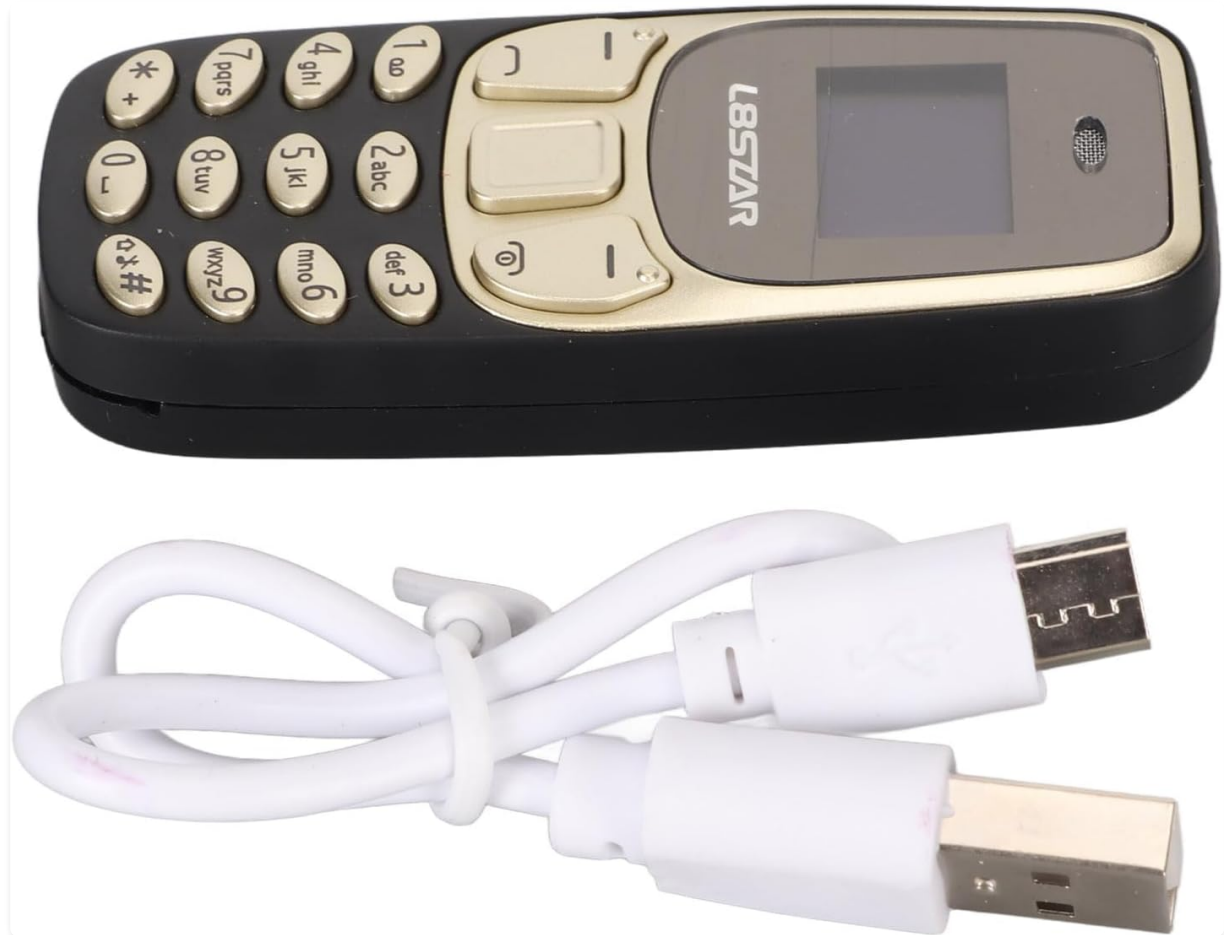
Figure 3.1: The Jectse Mini Phone and its USB charging cable.