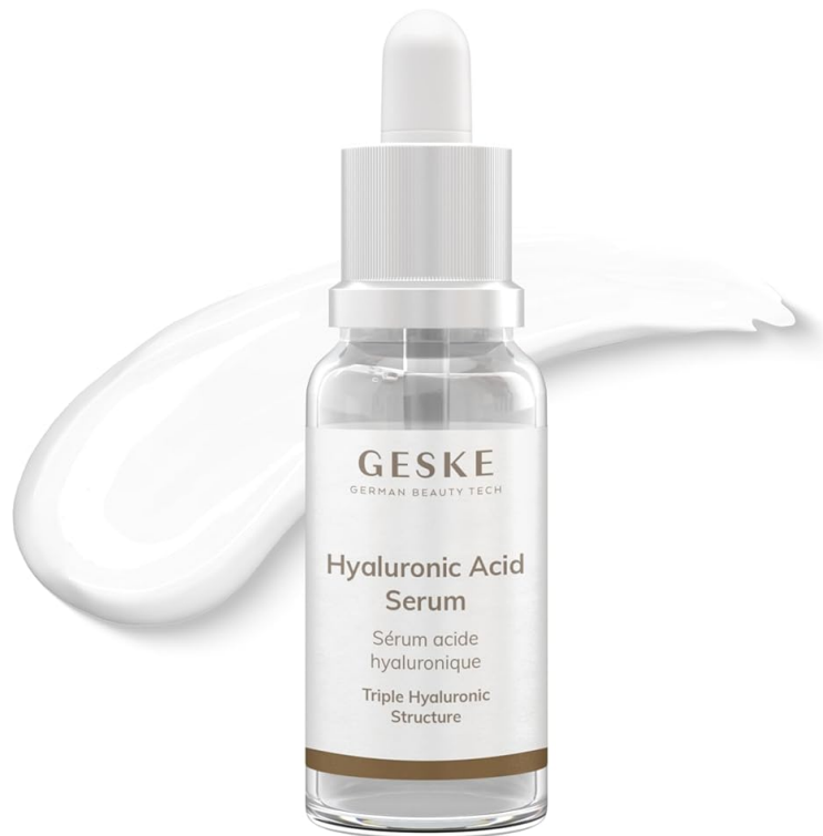
Image: GESKE Skin Smoothing Serum, recommended for post-treatment application.