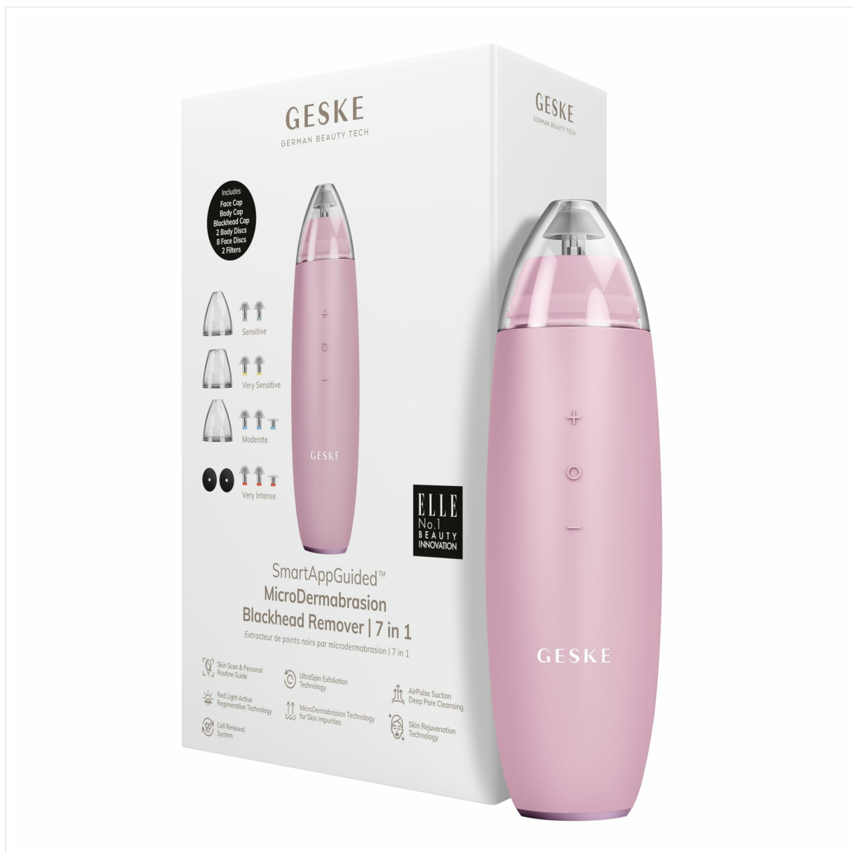
Image: The GESKE SmartAppGuided MicroDermabrasion Blackhead Remover device.