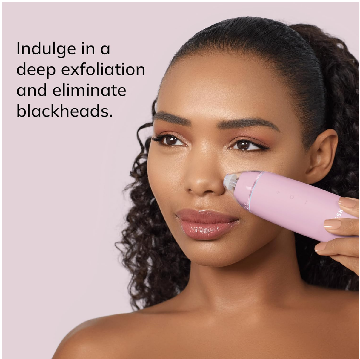
Image: A user demonstrating the application of the GESKE MicroDermabrasion device on the nose area.

Indulge in a deep exfoliation and eliminate blackheads.