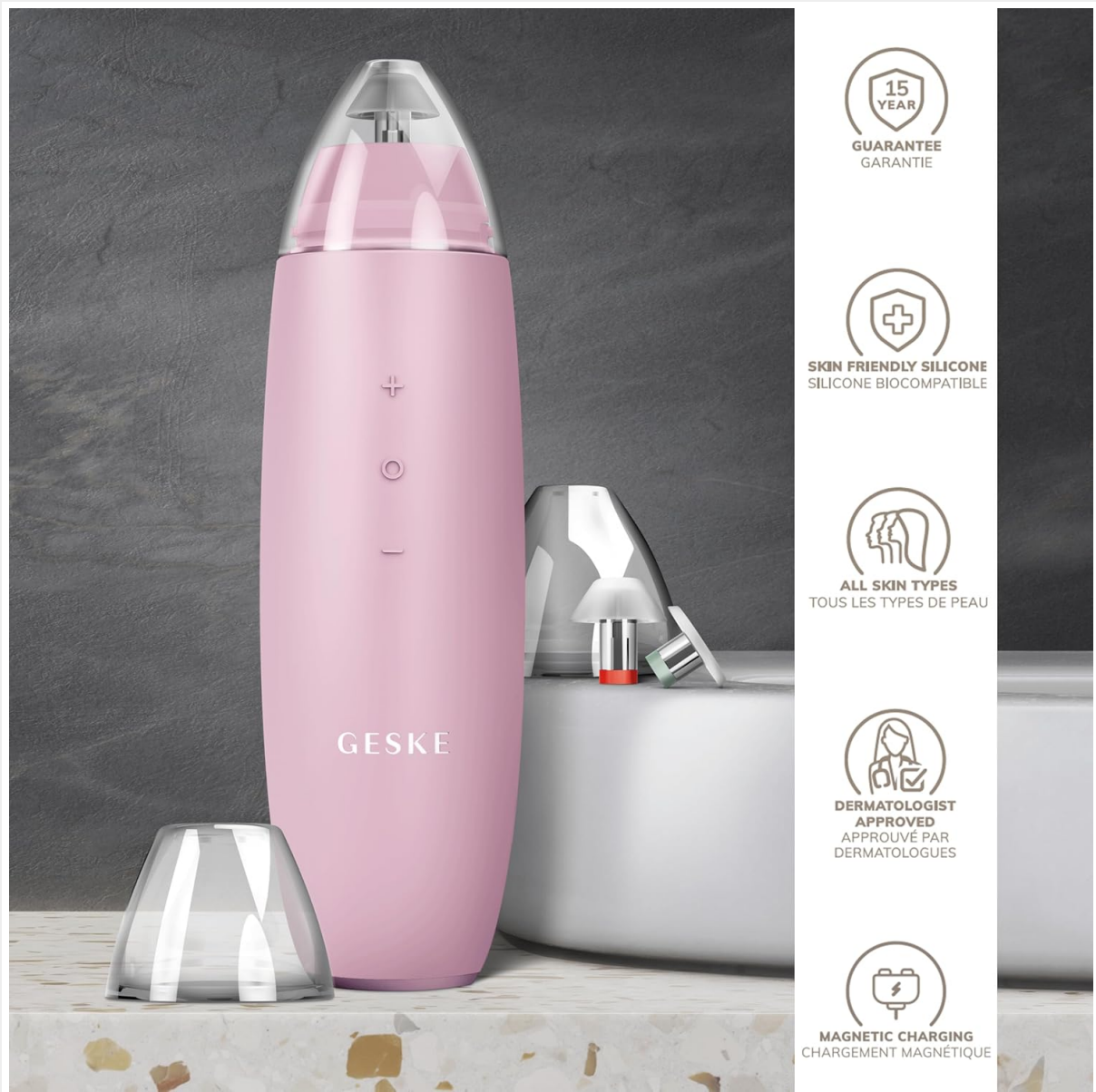
Image: The GESKE MicroDermabrasion device shown with different caps and accessories.