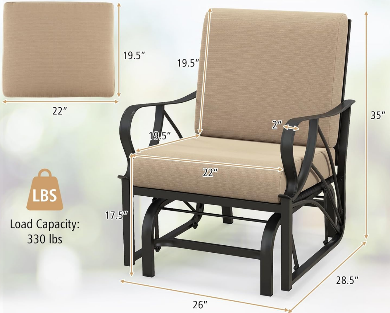
Image: Detailed product dimensions and load capacity.