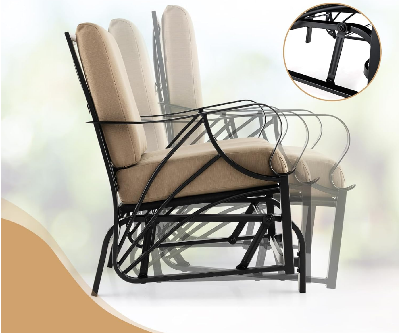
Image: Visual representation of the smooth rocking motion of the glider chair.