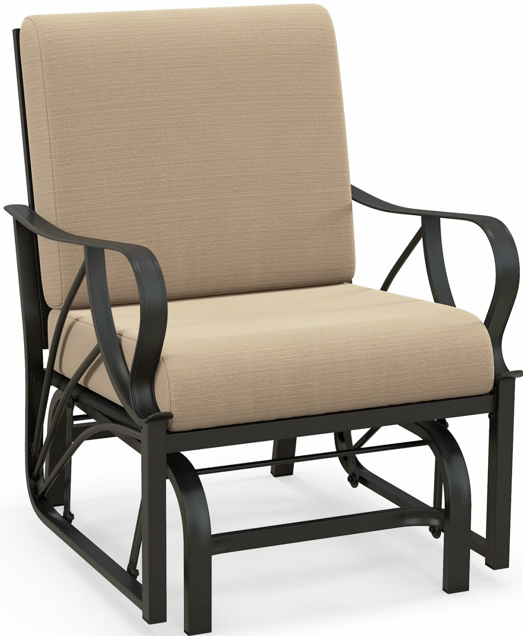
Image: The fully assembled Giantex Patio Glider with beige cushions.