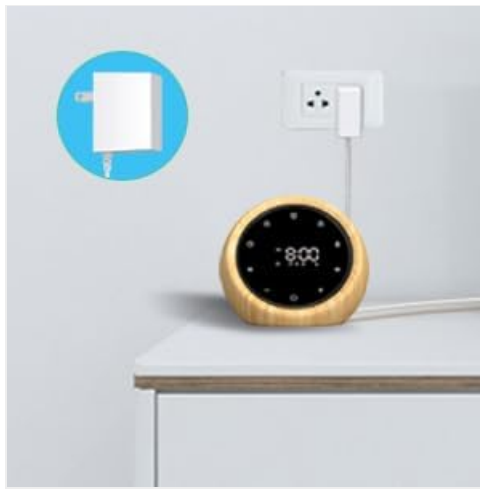
Image: The BGOVERSS charger plugged into a wall outlet, providing power to a wooden BGOVERSS sound machine on a bedside table.