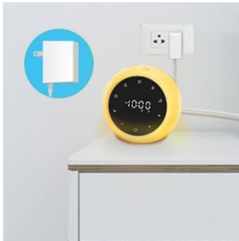
Image: The BGOVERSS charger plugged into a wall outlet, providing power to a yellow BGOVERSS sound machine on a bedside table.