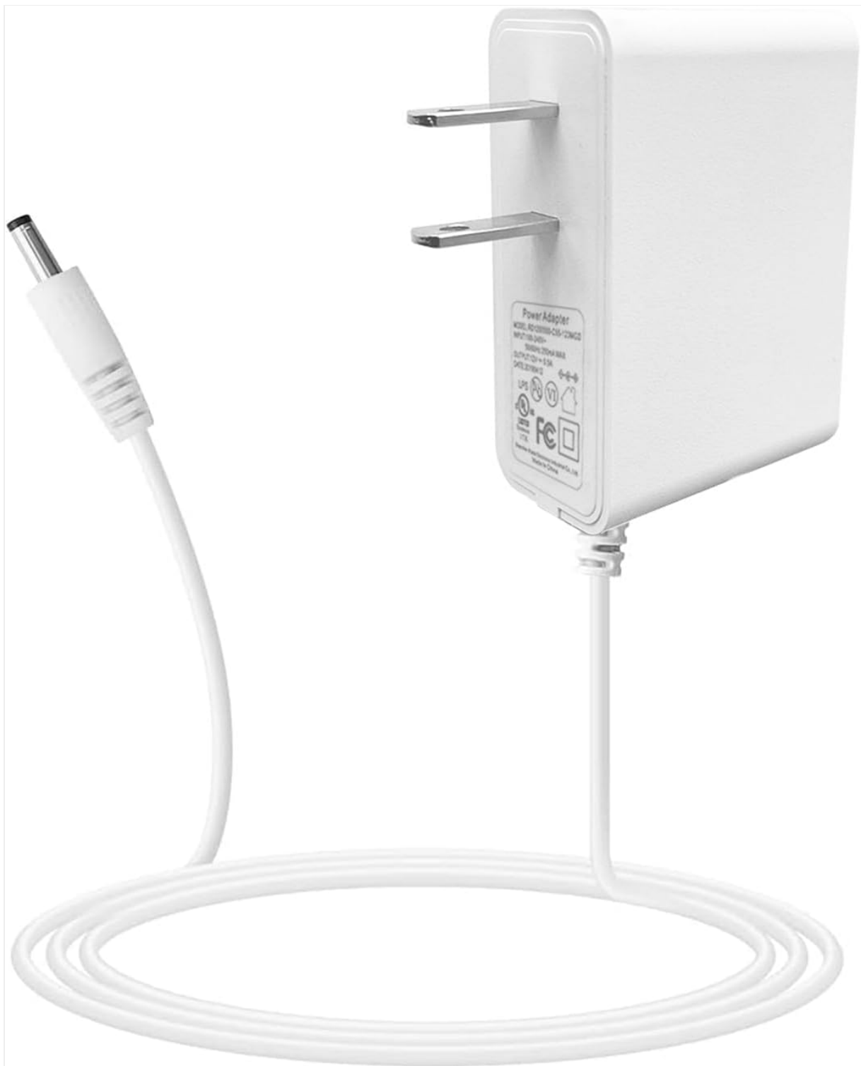
Image: The BGOVERSS White Noise Sound Machine Charger, showing the power adapter block and the attached DC cable with its connector.