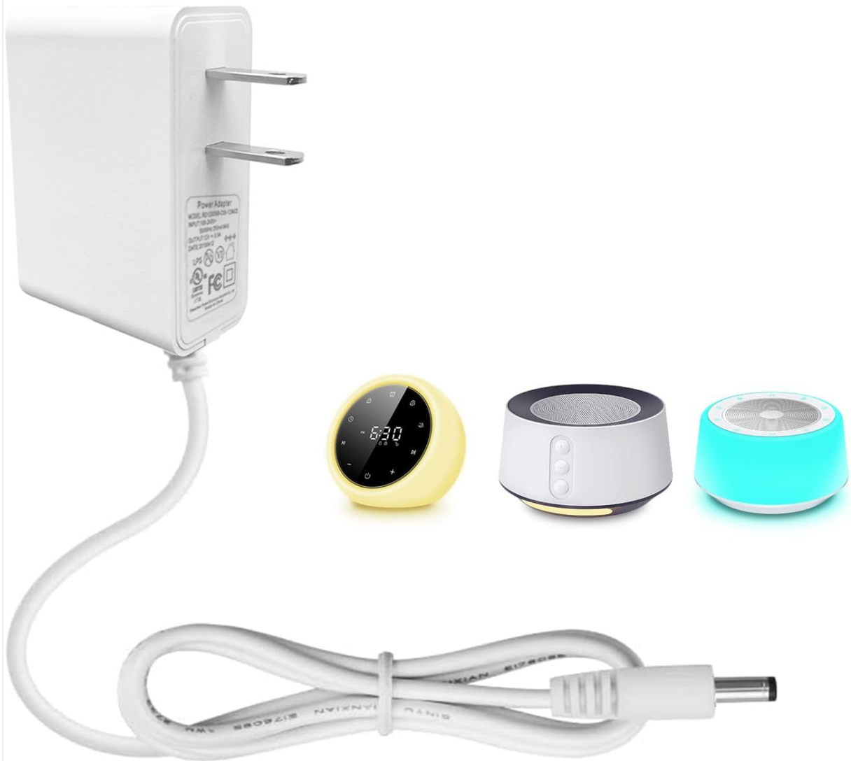
Image: The BGOVERSS charger displayed alongside three different BGOVERSS sound machine models, illustrating its compatibility.