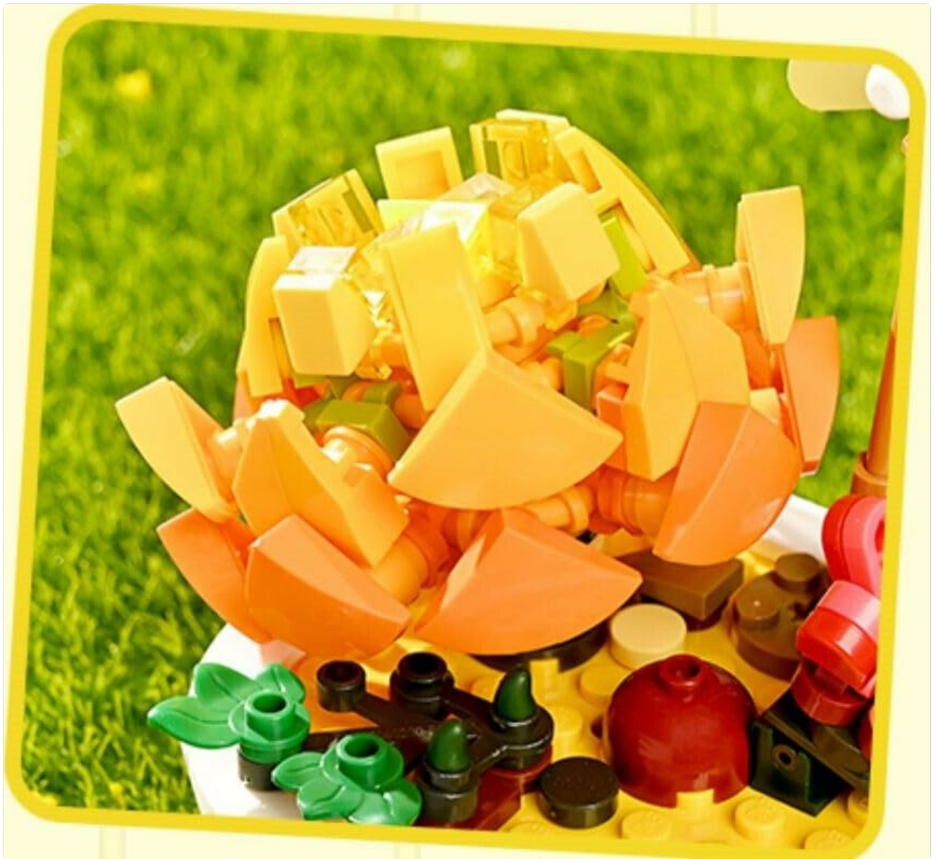
Image: A detailed view of the orange and yellow succulent-shaped building blocks, showcasing their intricate design.