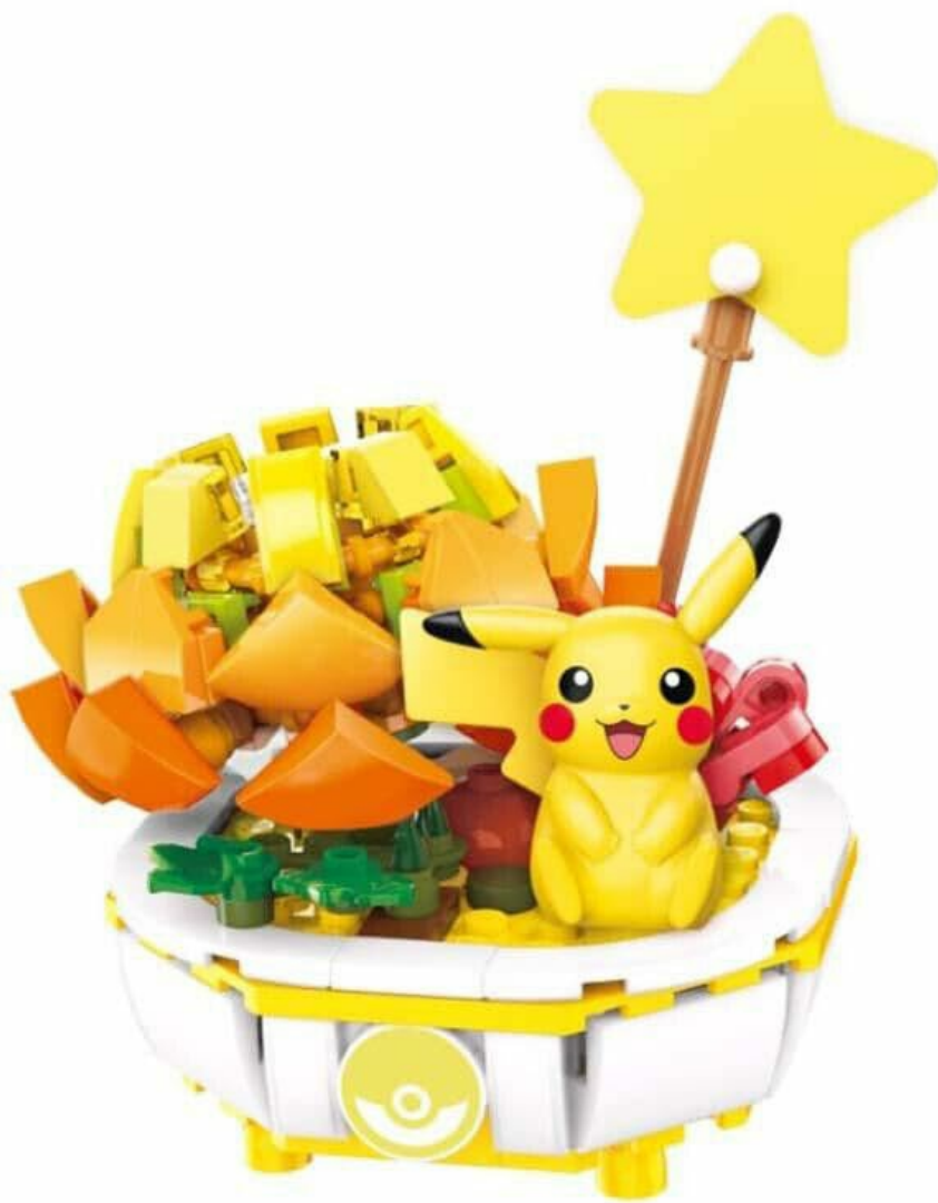
Image: The fully assembled Keeppley Bonasai PikaPlka model, showing the front view of Pikachu and the succulent elements.