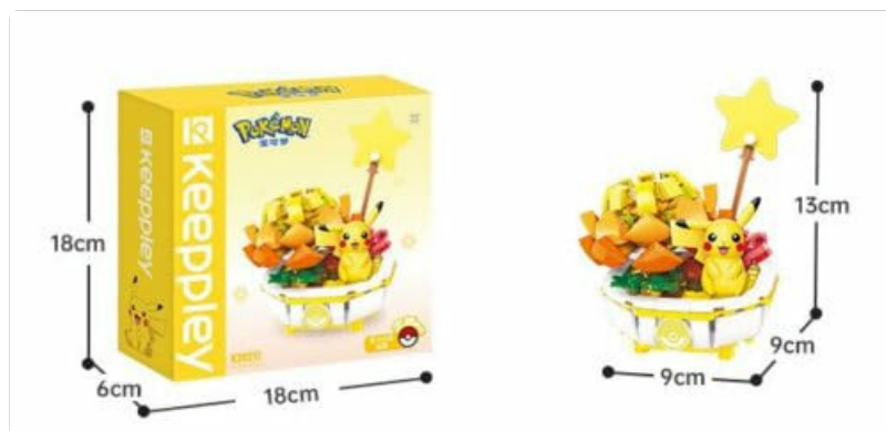
Image: Diagram illustrating the dimensions of the product box and the assembled model.