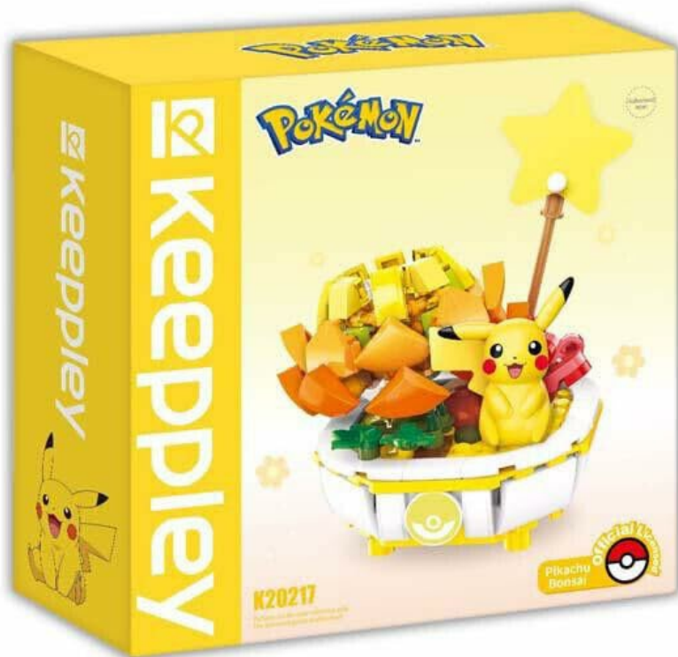
Image: The Keeppley Bonasai PikaPiKa K20217 product box, showcasing the assembled model on the front.