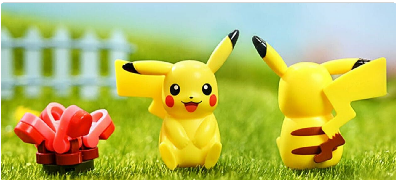
Image: A close-up of two Pikachu building block figures, illustrating the detailed facial features and body shape.