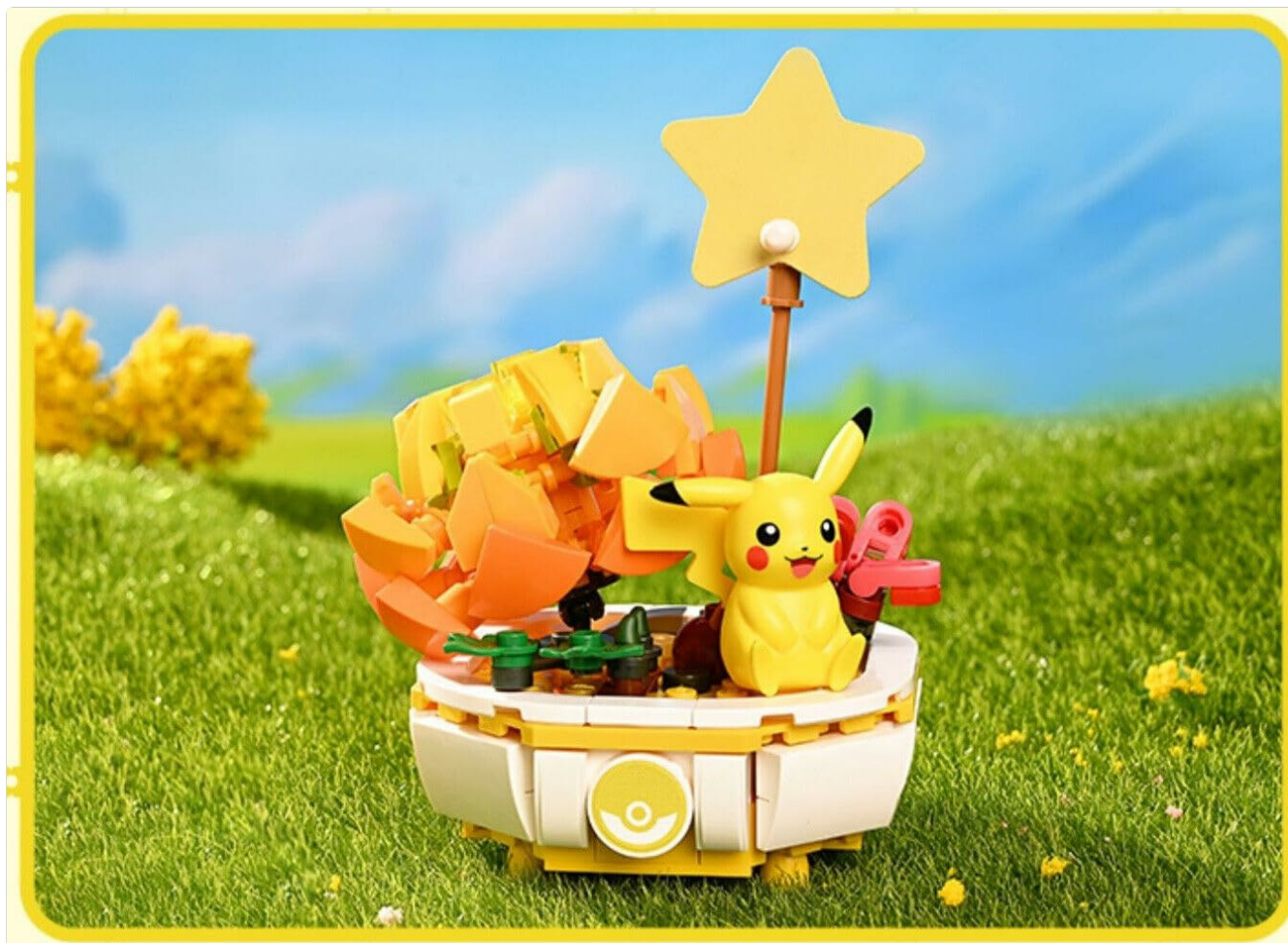
Image: The assembled building block set displayed outdoors, highlighting its vibrant colors against a green background.