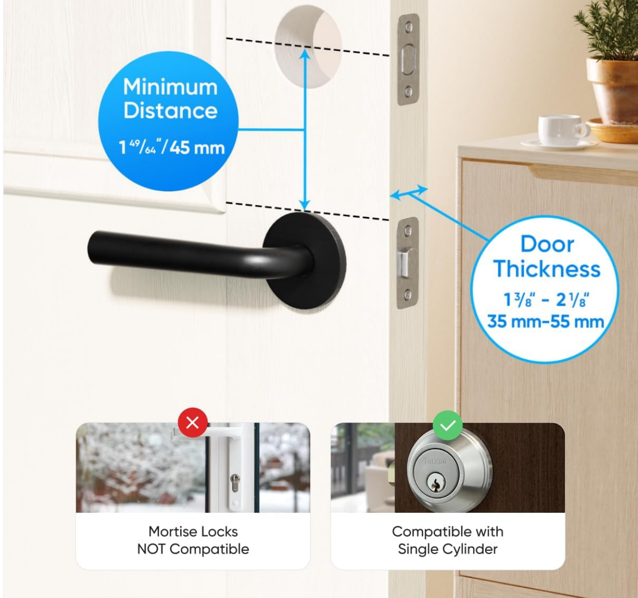
Figure 1: Door Compatibility Diagram