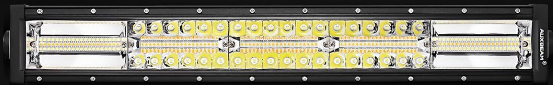
LED Light Bar