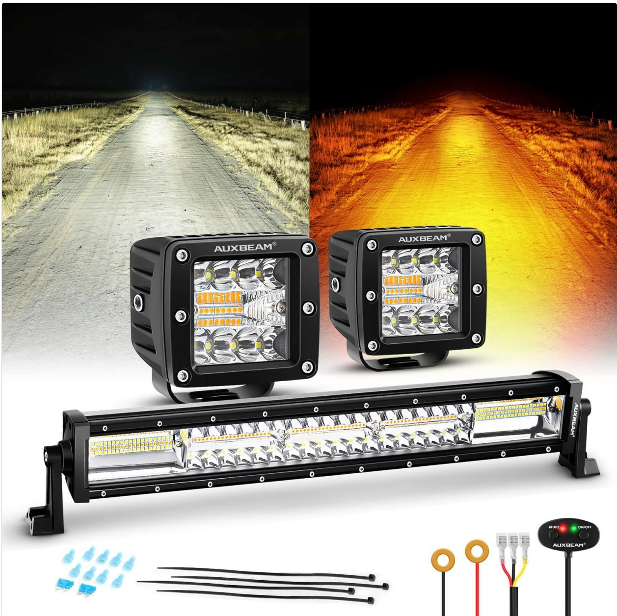
Image 1.1: Auxbeam 22-inch LED Light Bar and 3-inch LED Pods Combo Set.