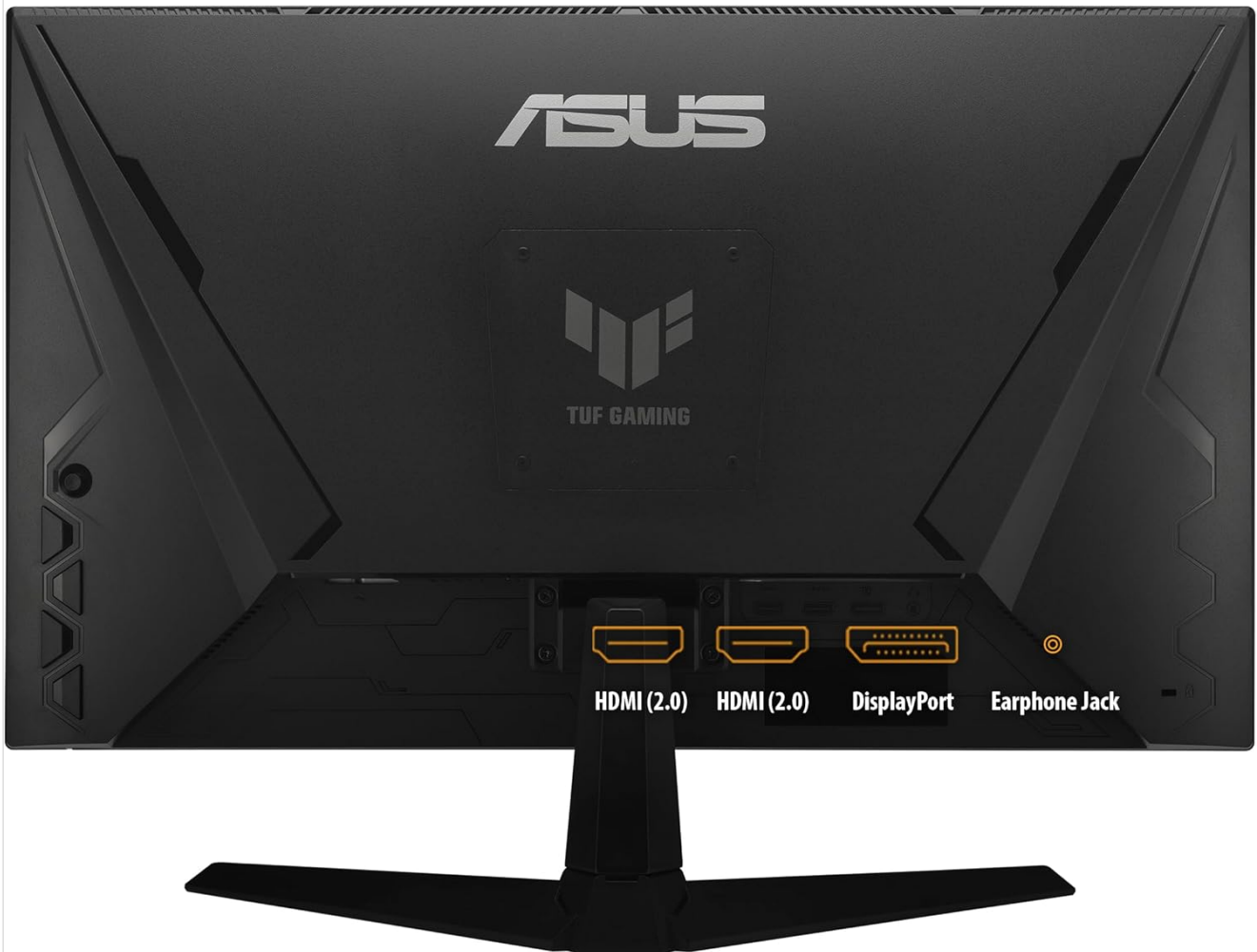
Figure 3: Rear panel connections for video and audio input.