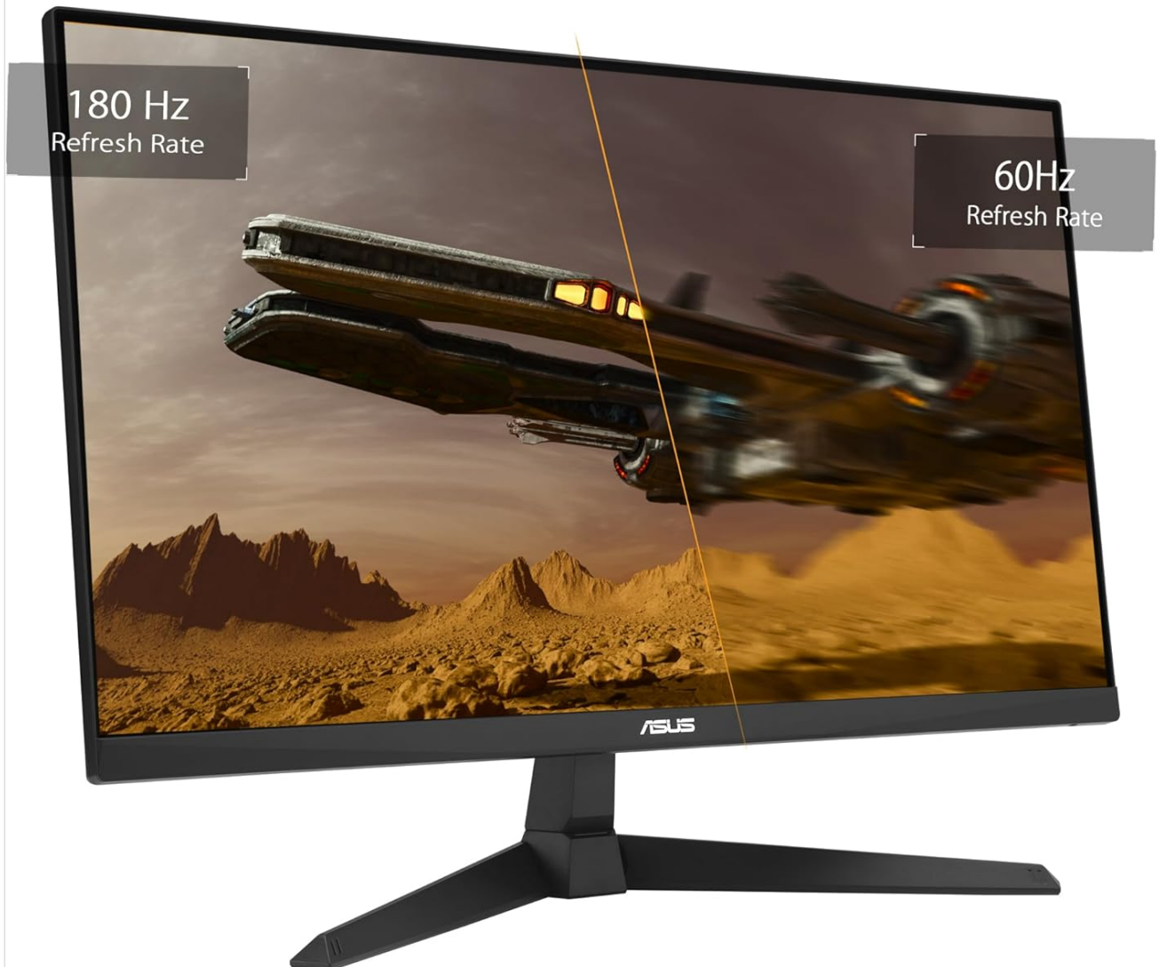
Figure 5: Visual comparison of 180Hz versus 60Hz refresh rates.