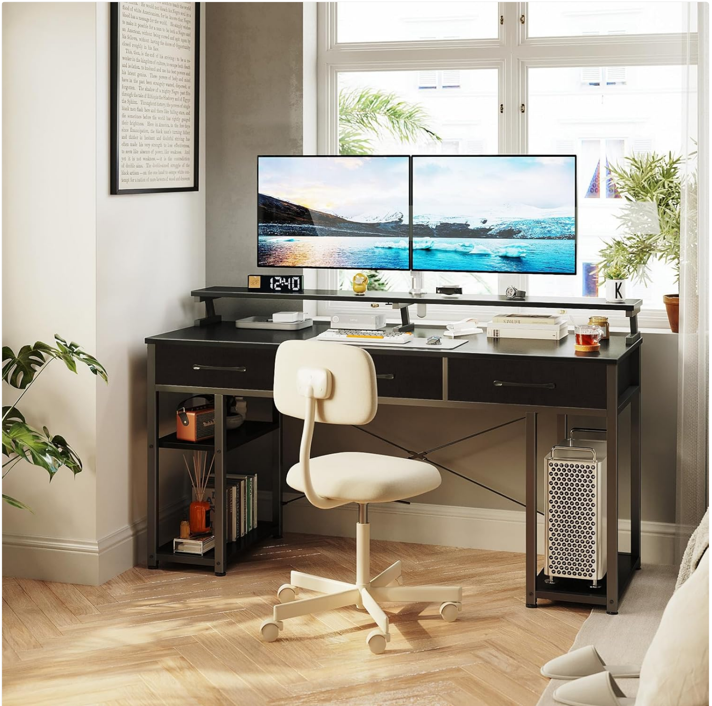
Figure 2: Assembled ODK Desk in a Home Office. This image shows the desk fully assembled and integrated into a typical home office setting, highlighting its aesthetic appeal and functional design.