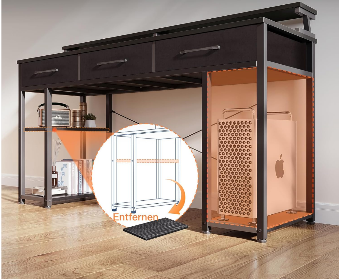
Figure 4: Integrated Storage Drawers. This image highlights the three spacious drawers, illustrating their capacity for organizing various items, contributing to a clutter-free desk.

| perfekt zum Organisieren Ihrer Gegenstände