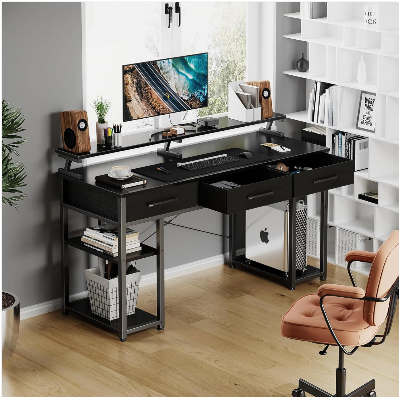
Figure 5: Versatile Storage with Removable Shelves. This image demonstrates the flexibility of the desk's lower shelves, including the option to remove them to accommodate larger items like a CPU tower, enhancing the desk's adaptability.