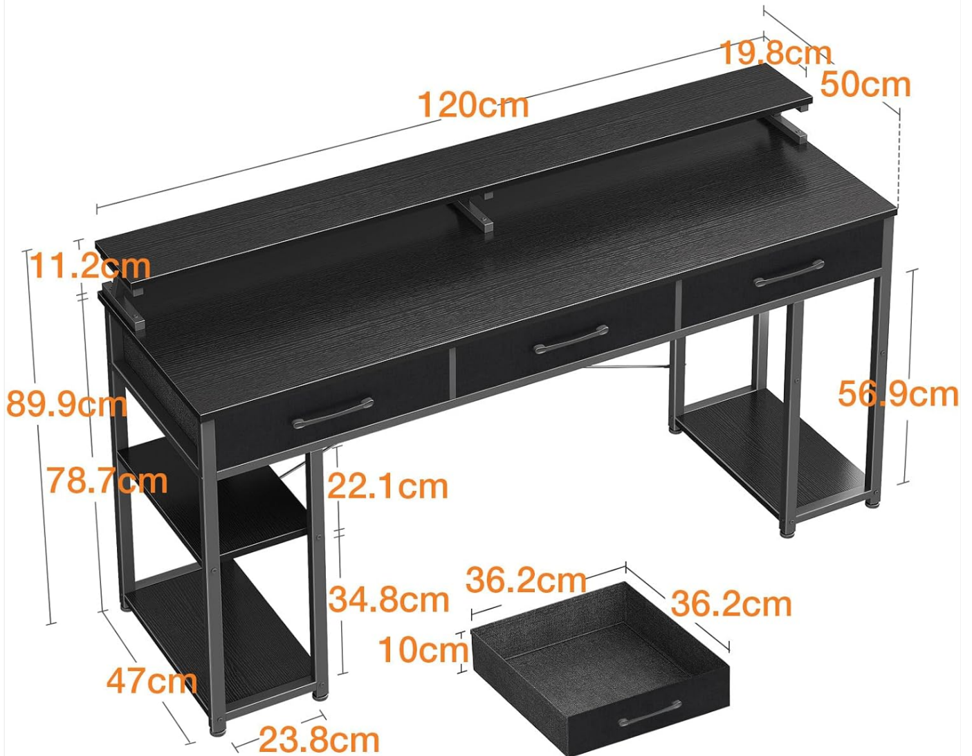
Figure 1: ODK Desk Dimensions. This image illustrates the precise measurements of the desk, including the overall length (120cm), width (50cm), height (90cm), and the dimensions of the monitor stand and side shelves.