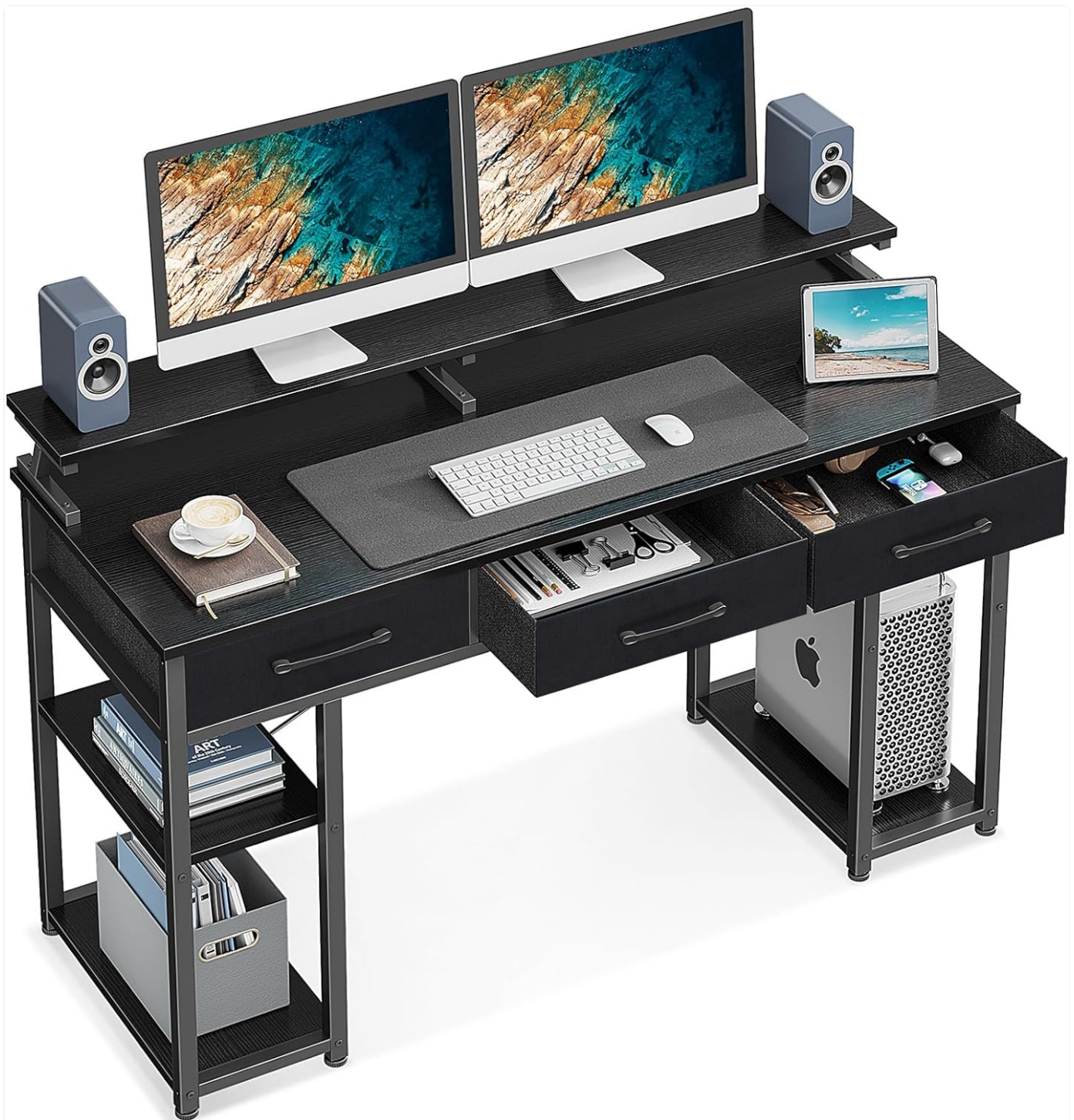
Figure 6: Full View of the ODK Desk in Use. This comprehensive view illustrates the desk's overall design and how its features, including the monitor stand and drawers, contribute to a functional and organized workspace.