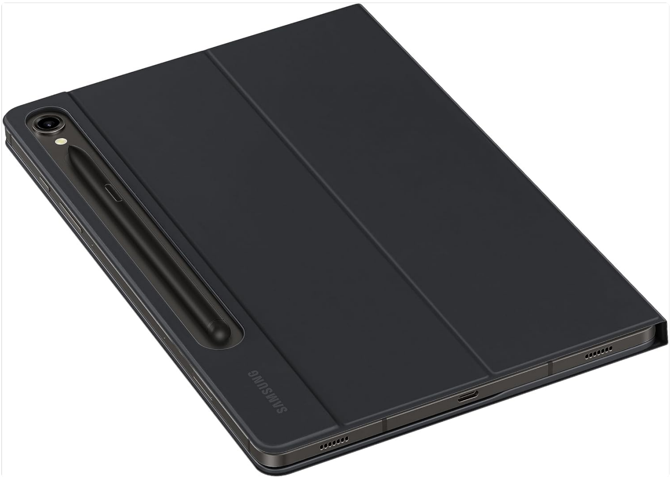
Image: The Samsung Galaxy Tab S9 FE Book Cover Keyboard Slim attached to a tablet, showcasing its sleek front profile.