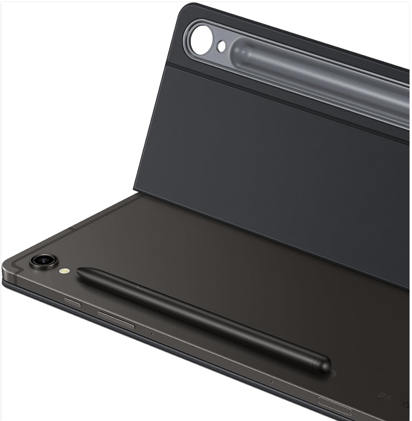
Image: A side view of the Book Cover Keyboard Slim, highlighting the integrated storage slot for the S Pen.