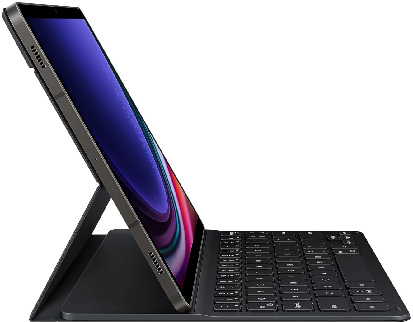
Image: A side view of the tablet in DeX Mode, demonstrating the ergonomic angle provided by the keyboard cover.