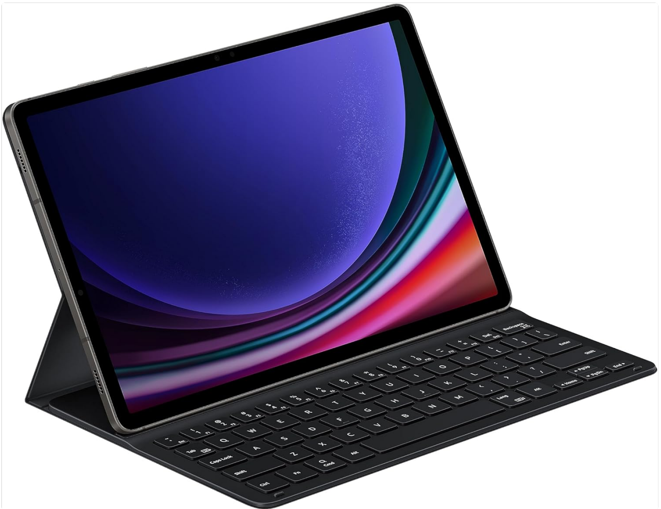
Image: The Samsung Galaxy Tab S9 FE tablet propped up by its Book Cover Keyboard Slim, ready for use.