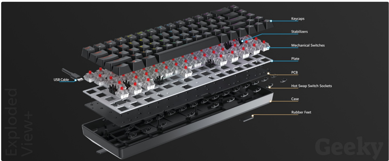
Image: An exploded diagram of the GK65 keyboard, illustrating its internal components including the hot-swappable switch sockets.