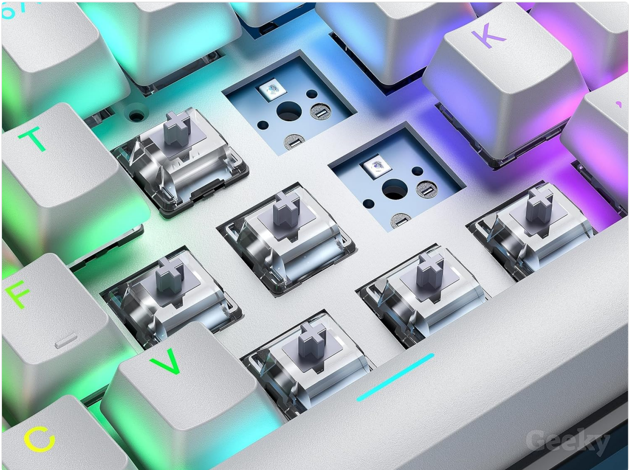
Image: The Geeky GK65 keyboard illuminated with colorful RGB backlighting, showcasing various lighting effects.