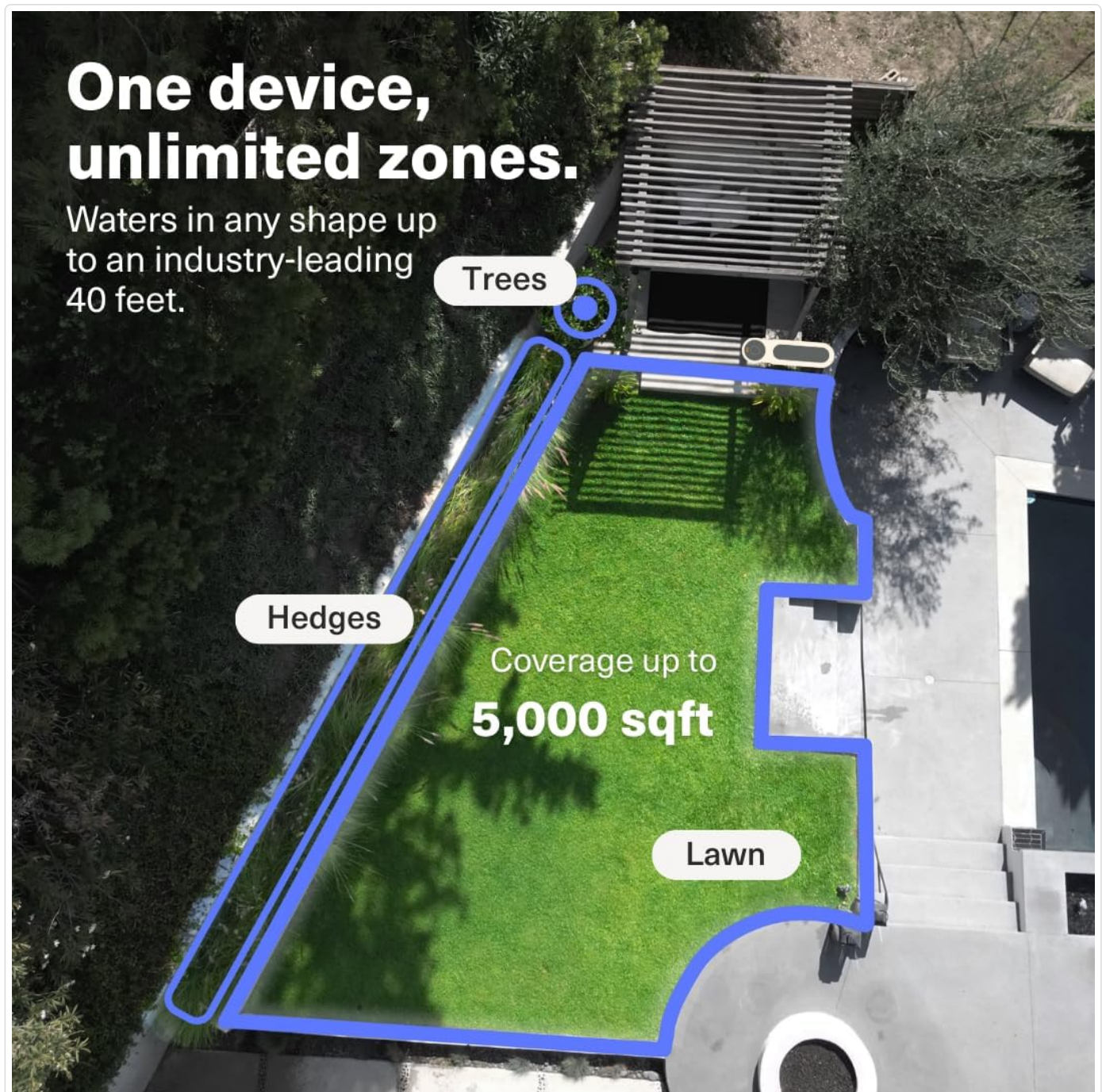
Figure 3: An aerial perspective illustrating how the OtO Smart Sprinkler can define multiple, customized watering zones within a single yard.