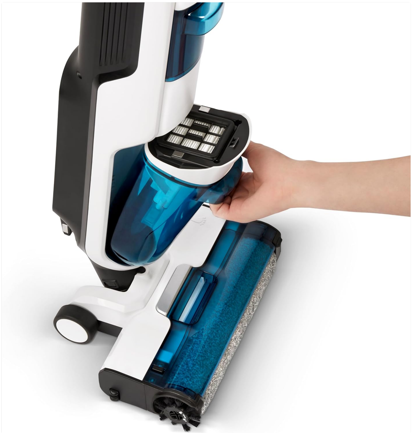
Figure 2: Illustration of removing a water tank for filling or emptying.