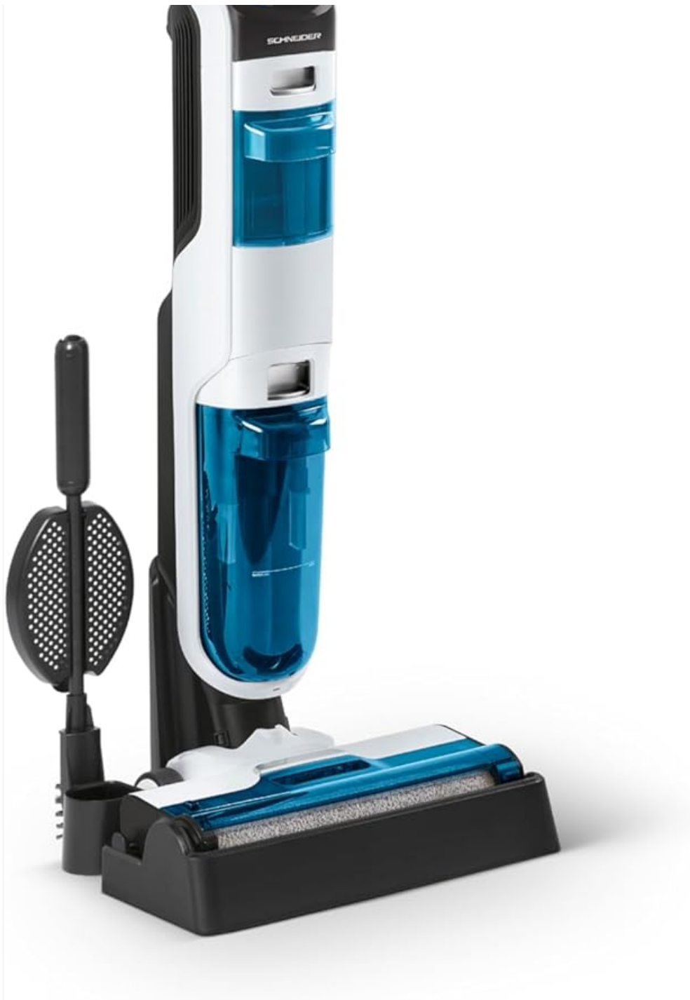
Figure 1: SCHNEIDER SCVCO2350DE Wet and Dry Vacuum Cleaner with charging base and cleaning tool.