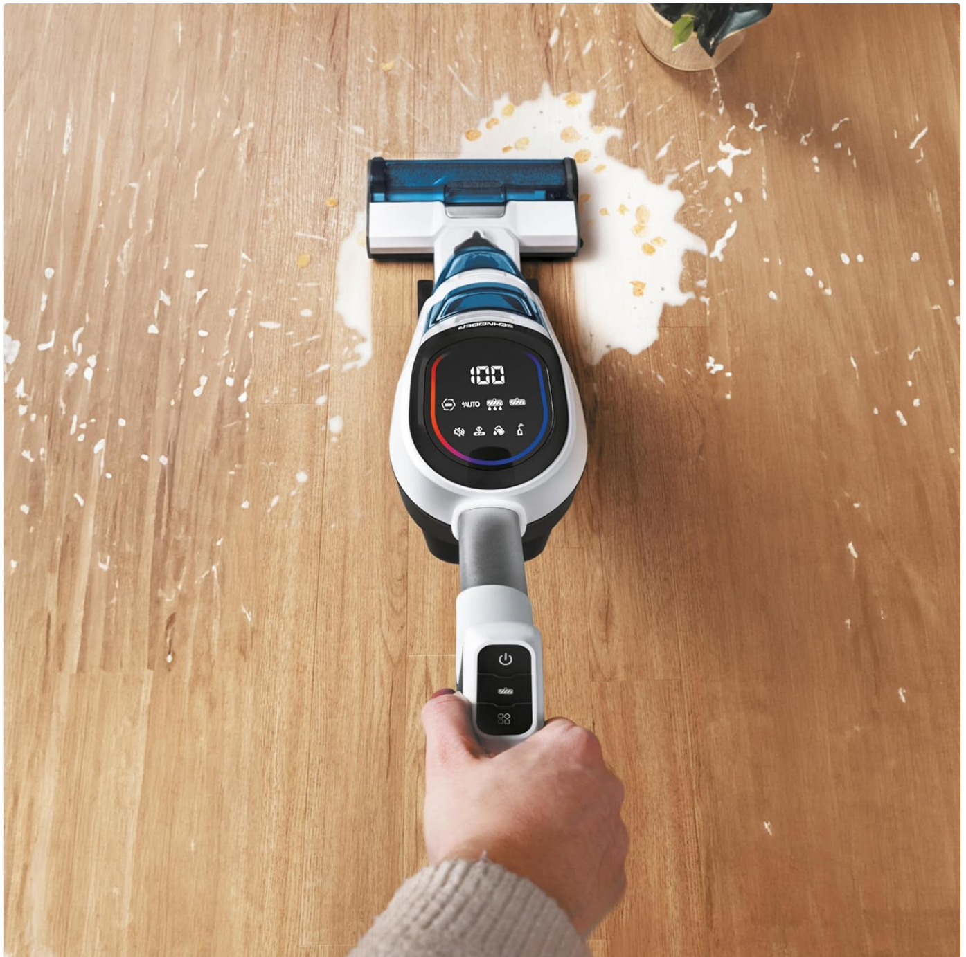
Figure 6: The vacuum cleaner effectively cleaning a wet spill on a hard floor.