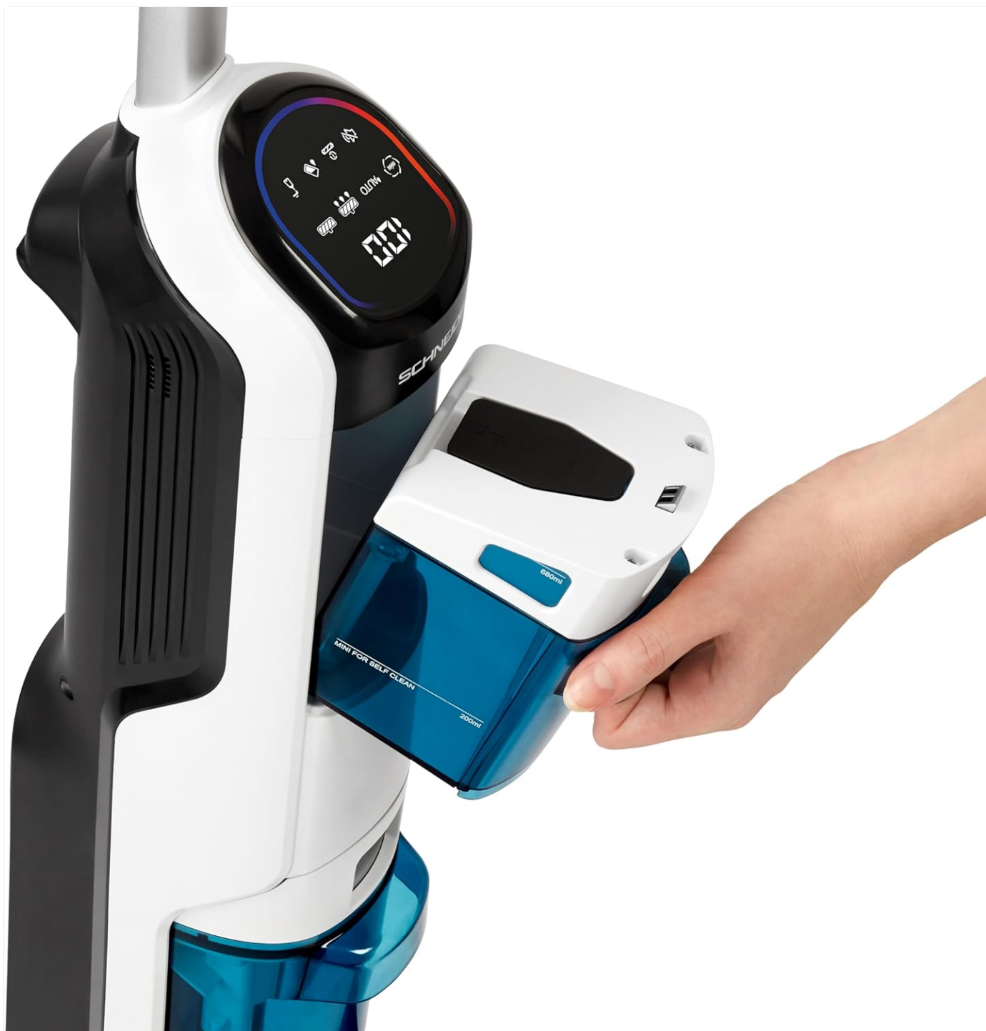
Figure 4: The clean water tank being held, ready for filling.