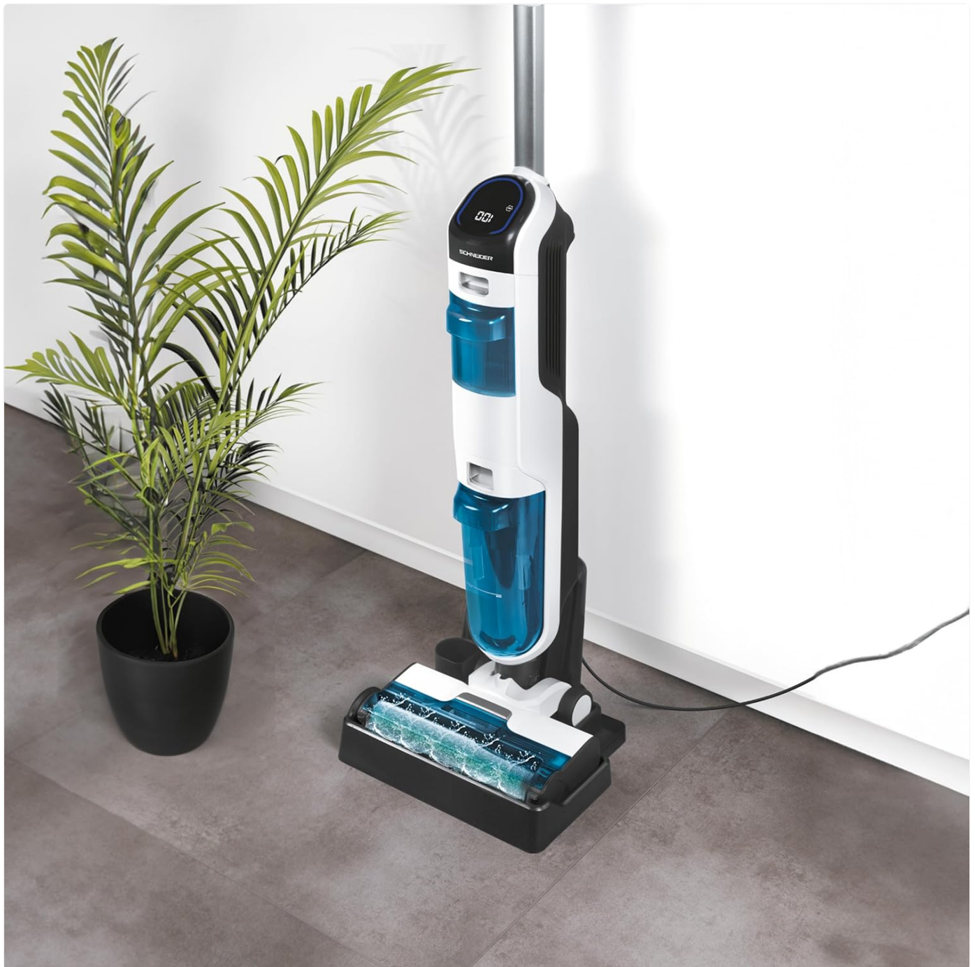
Figure 3: The vacuum cleaner docked on its charging base.