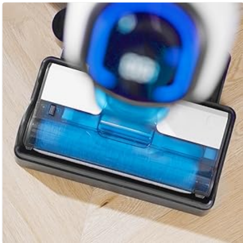
Figure 8: The vacuum cleaner can perform a self-cleaning cycle while on its charging base.