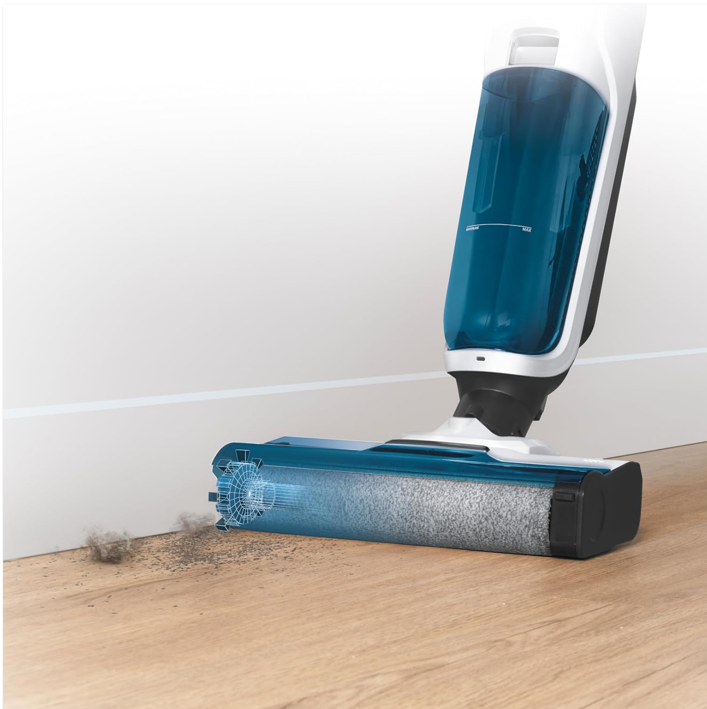
Figure 7: The specialized brush design allows for thorough cleaning along edges and baseboards.