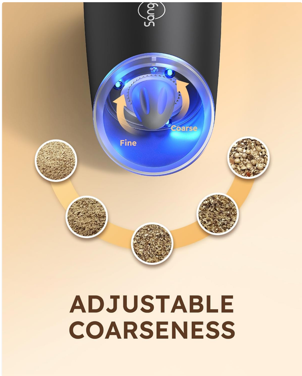
Image: A close-up of the grinder's top, showing the adjustable knob for coarseness settings, with examples of different grind sizes.