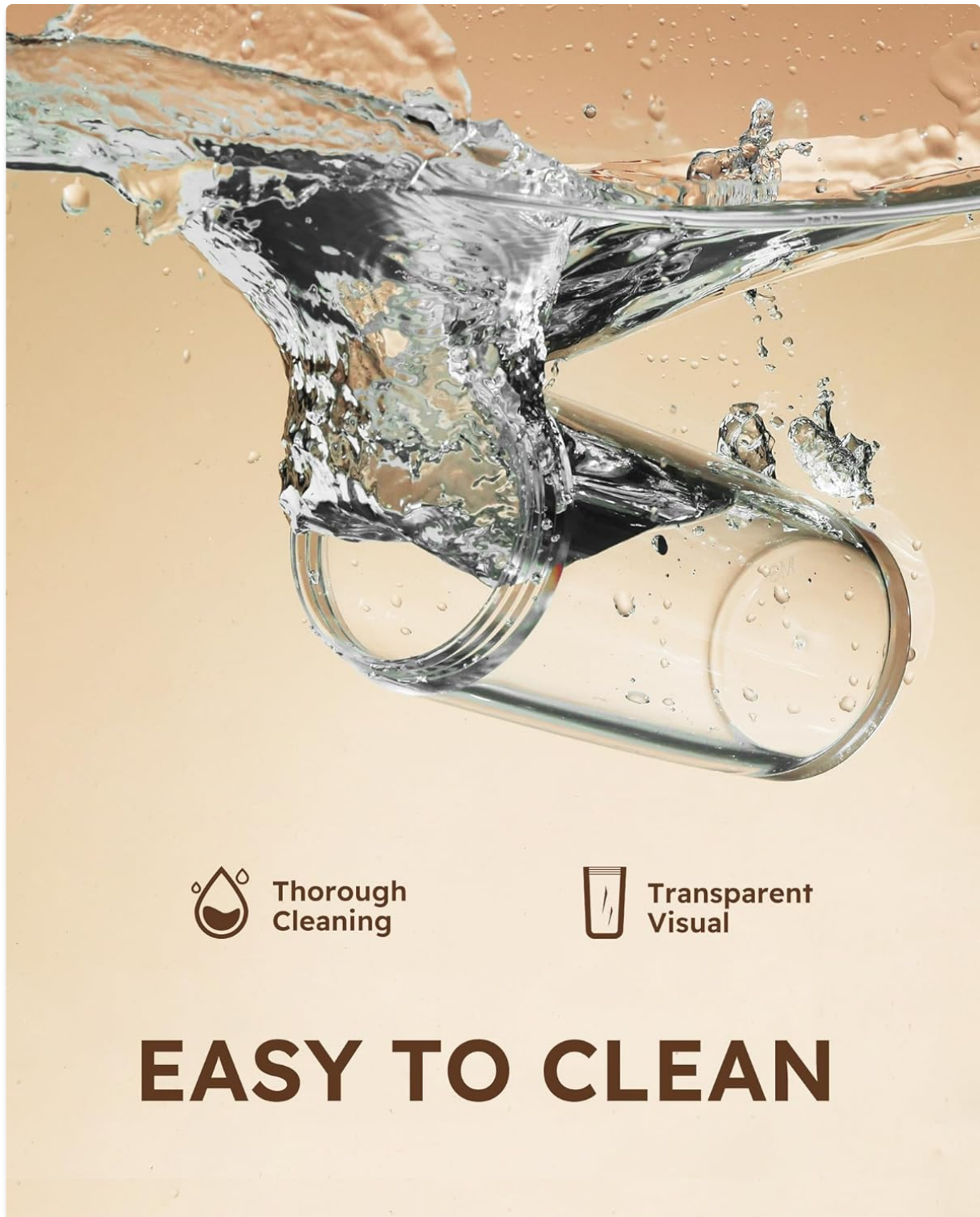
Image: The detachable spice bottle being cleaned under running water, highlighting its transparent design for visual inspection.