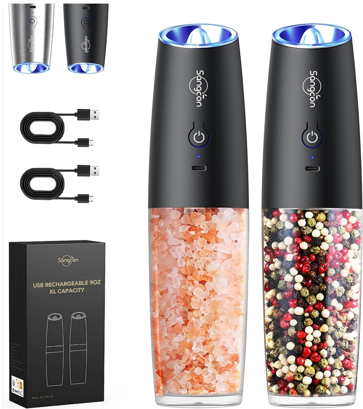
Image: The Sangcon Gravity Electric Salt and Pepper Grinder Set, featuring two black grinders with clear spice chambers, USB-C charging cables, and product packaging.