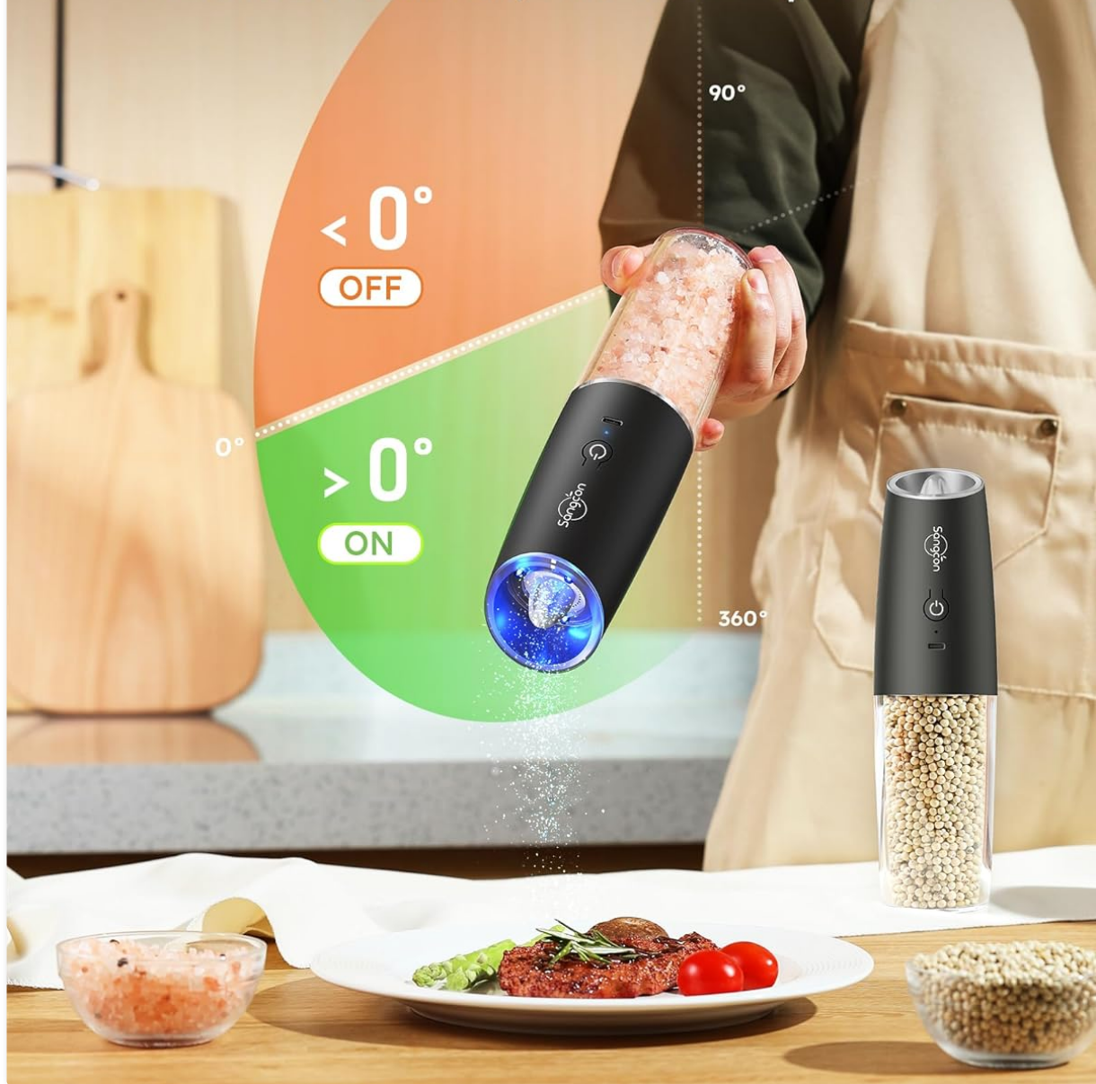
Image: A hand holding the grinder tilted downwards, demonstrating the gravity-activated grinding with the LED light on, dispensing spices onto food.