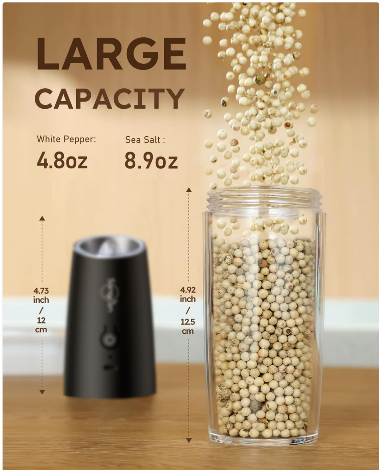
Image: A visual representation of the large capacity spice bottle, showing measurements and how to fill it with white peppercorns.