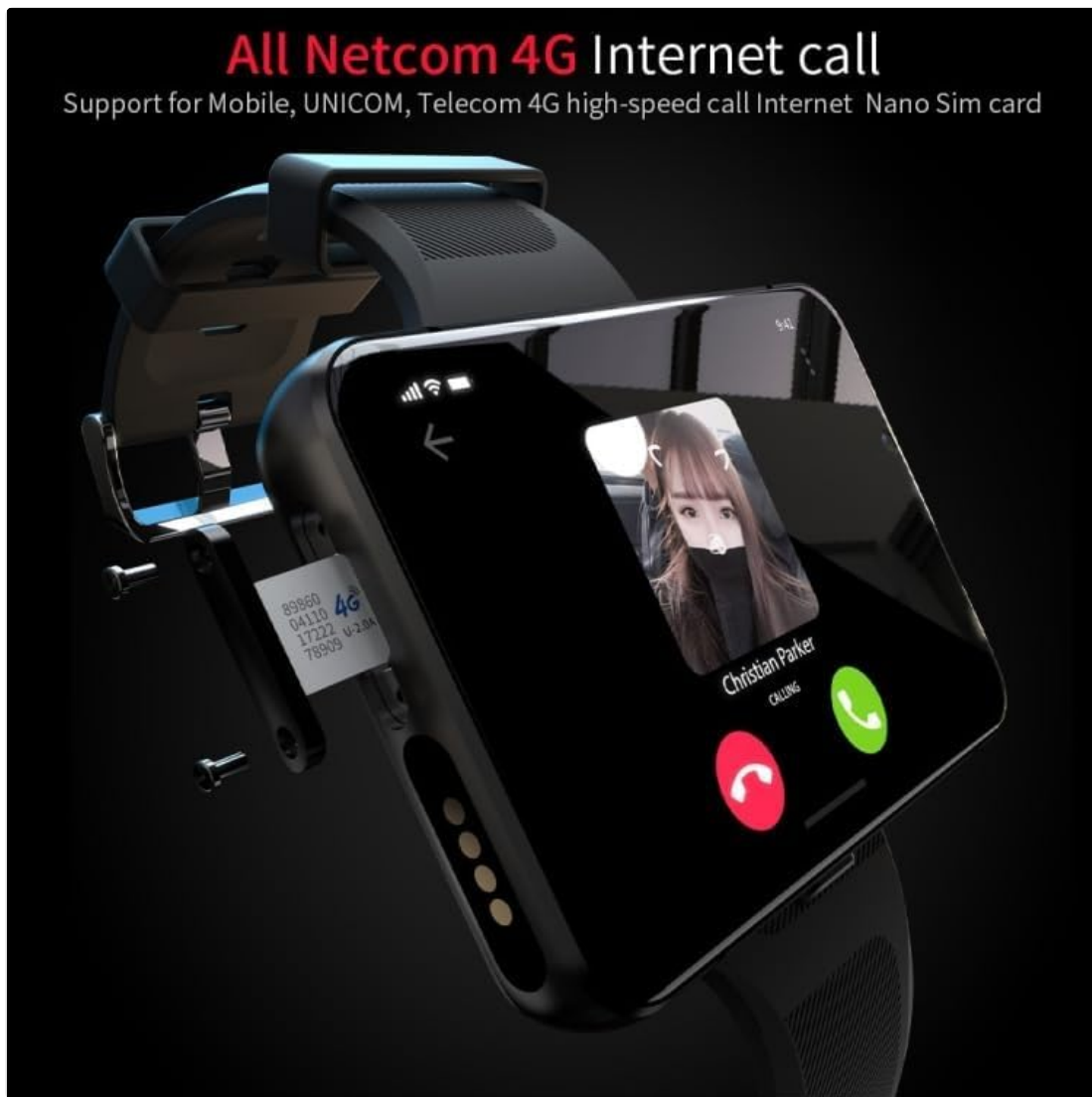
Image 4.1: Illustration of a Nano SIM card being inserted into the LOKMAT APPLLP Max Smart Watch. The image highlights the SIM card slot and the 4G network capability.