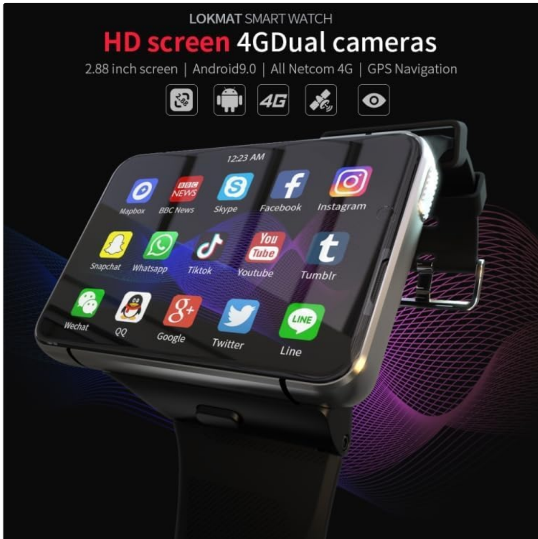
Image 5.1: The LOKMAT APPLLP Max Smart Watch screen showing a grid of application icons, including social media, news, and communication apps, demonstrating its Android 9.0 capabilities.