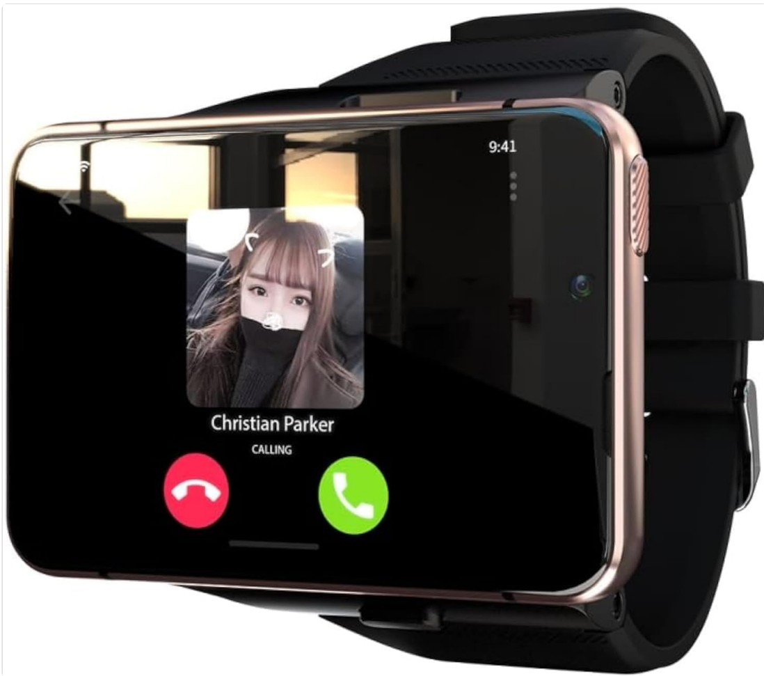
Image 3.1: Front view of the LOKMAT APPLLP Max Smart Watch, displaying an active video call. The large rectangular screen is prominent, showing a contact's image and call controls.