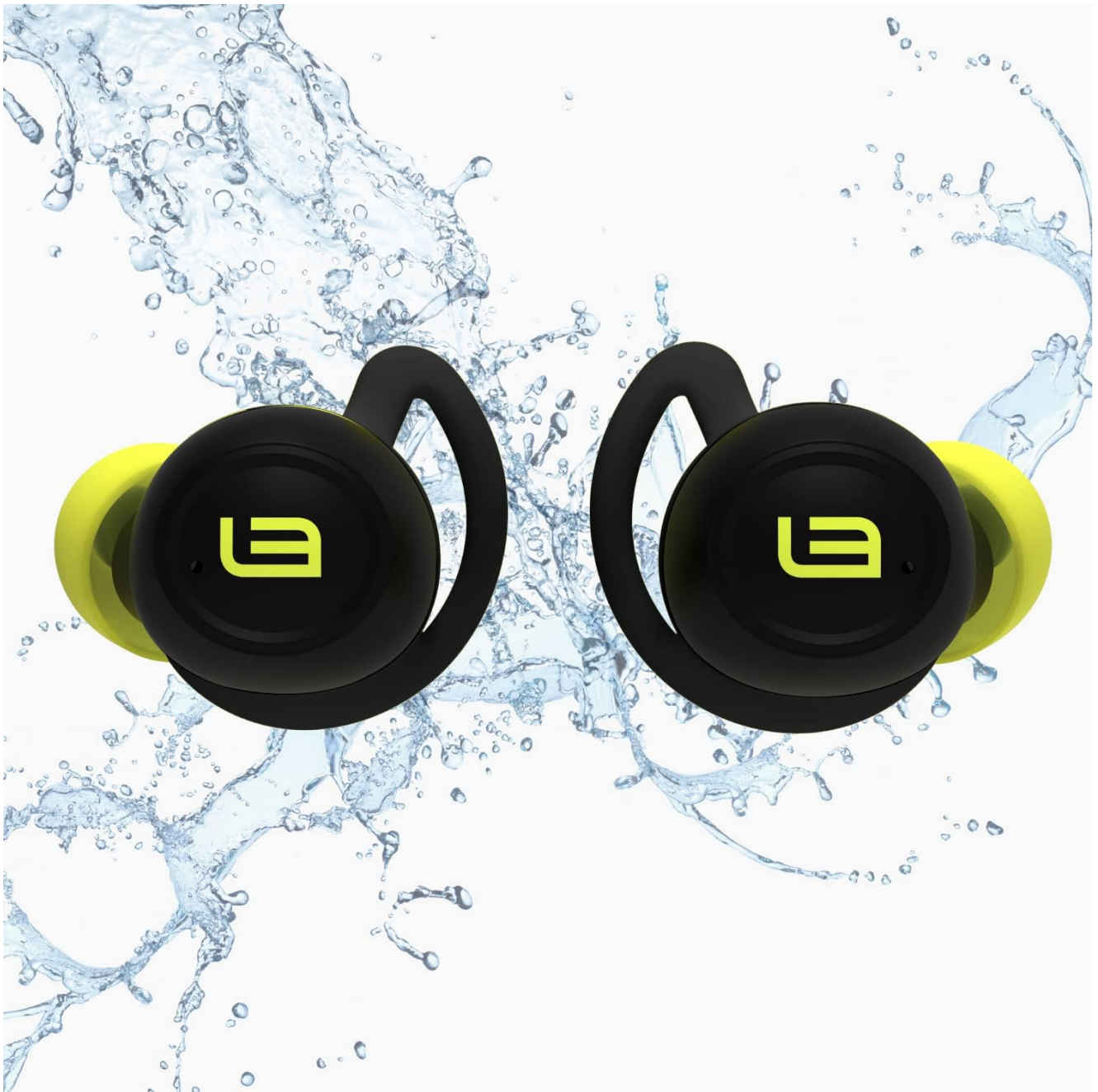
Image: A pair of HyperSonic earbuds, showcasing their design and waterproof capability with water splashes.