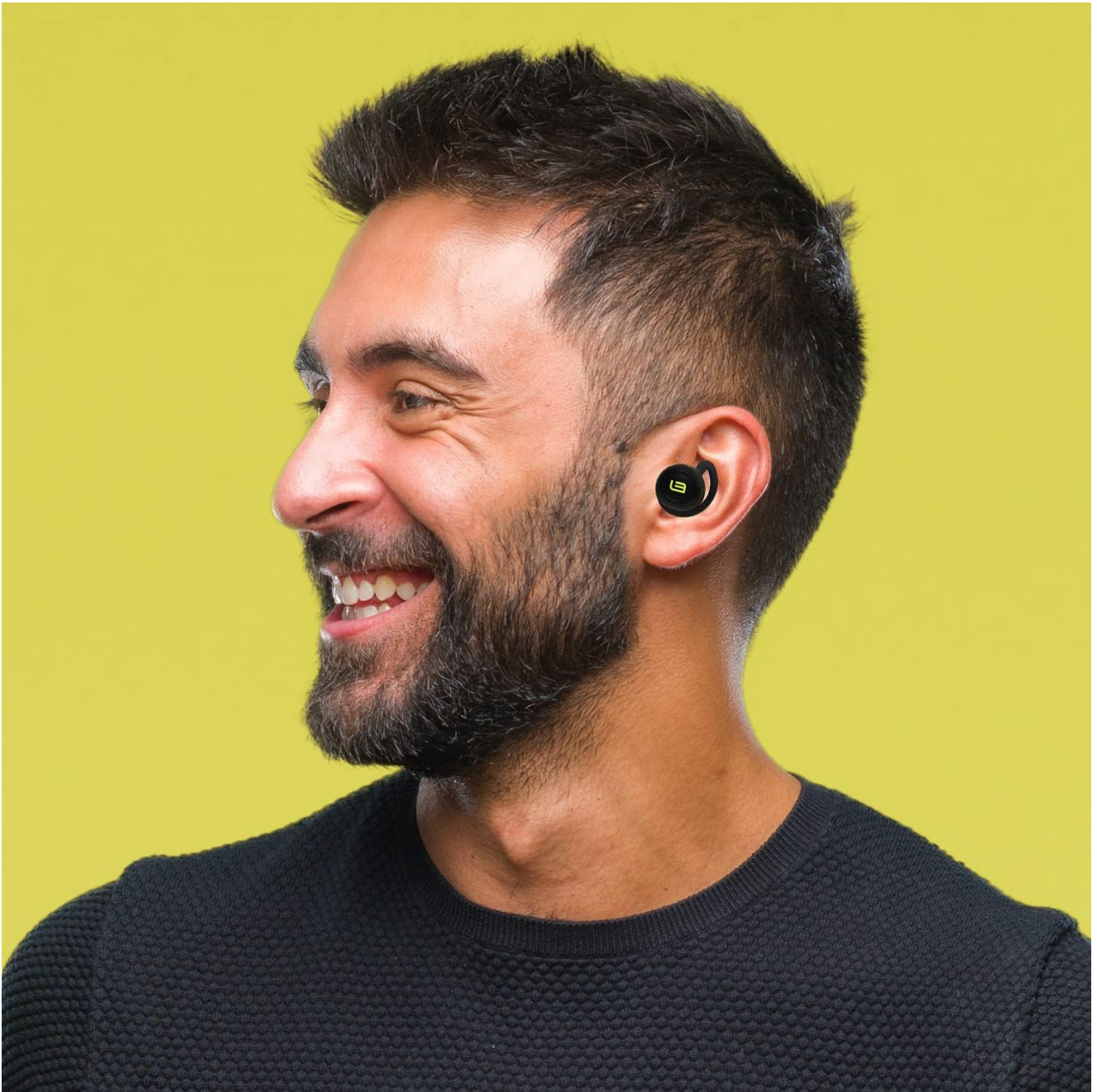
Image: A HyperSonic earbud comfortably seated in a user's ear, illustrating its ergonomic design.