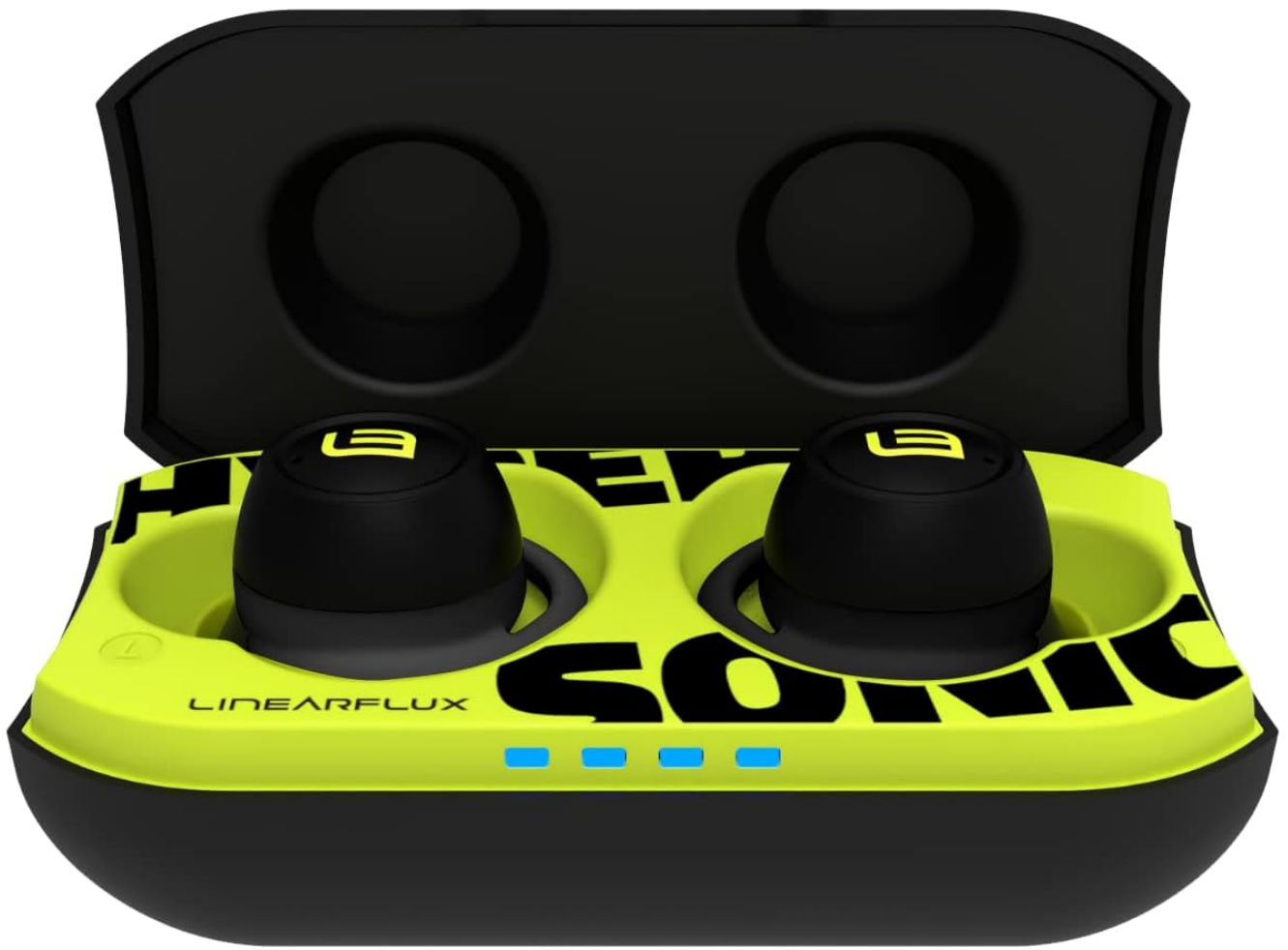
Image: HyperSonic earbuds resting in their open charging case, ready for charging or use. The case features LED indicators for battery status.