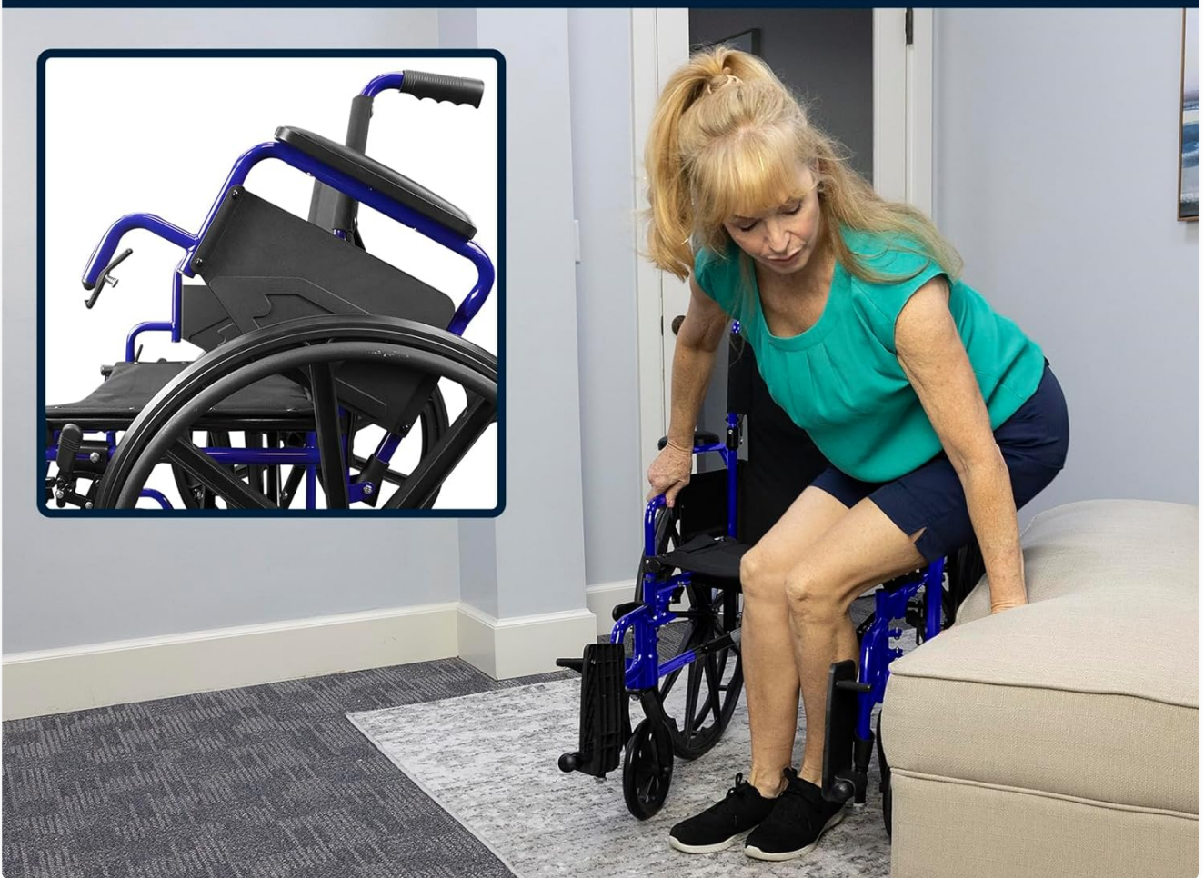
Image 4: Swingback armrests facilitate easier transfers into and out of the wheelchair.

Let you get into & exit your wheelchair more easily