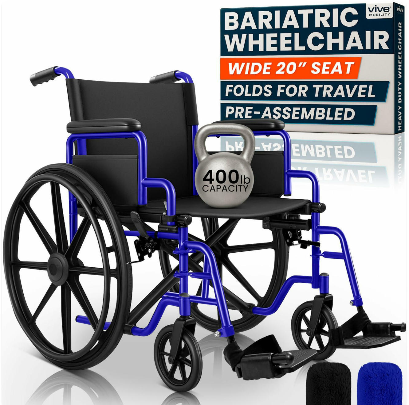
Image 1: The Vive Bariatric Heavy-Duty Wheelchair, showcasing its robust design.