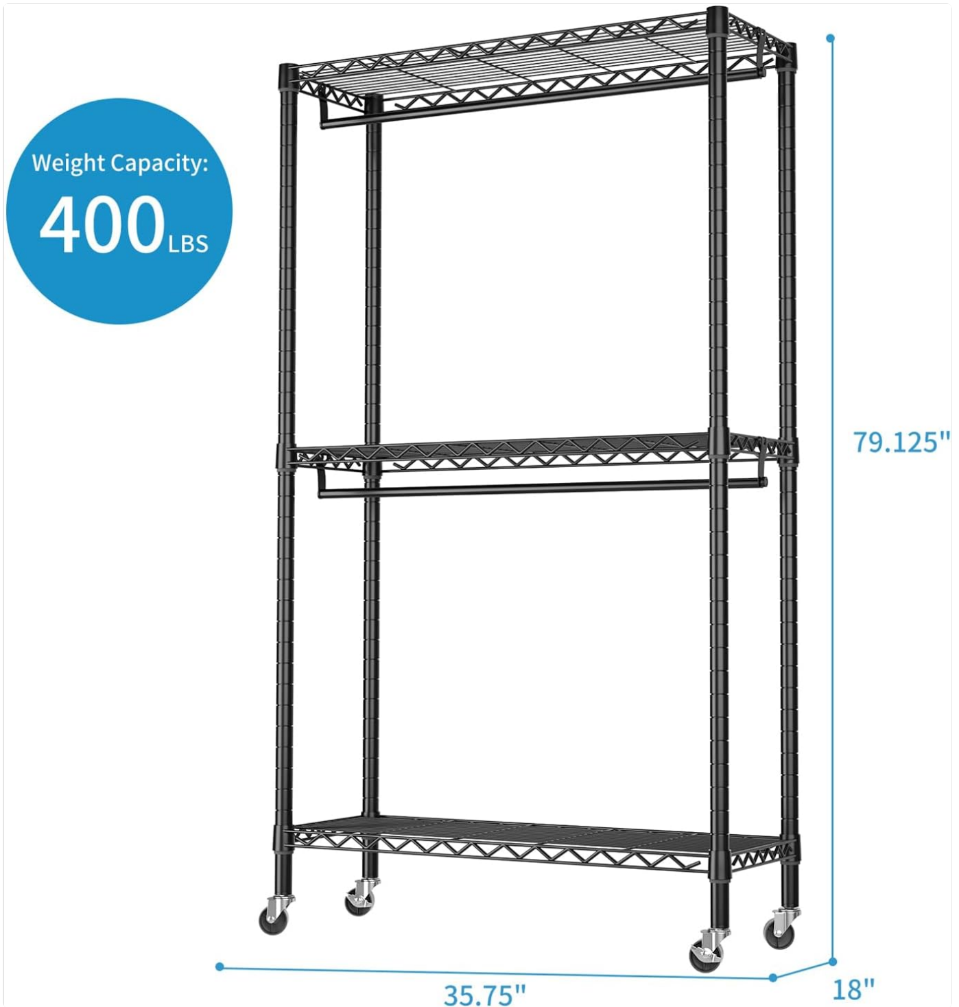
Figure 8.1: Key dimensions and weight capacity of the Golpart Garment Rack.