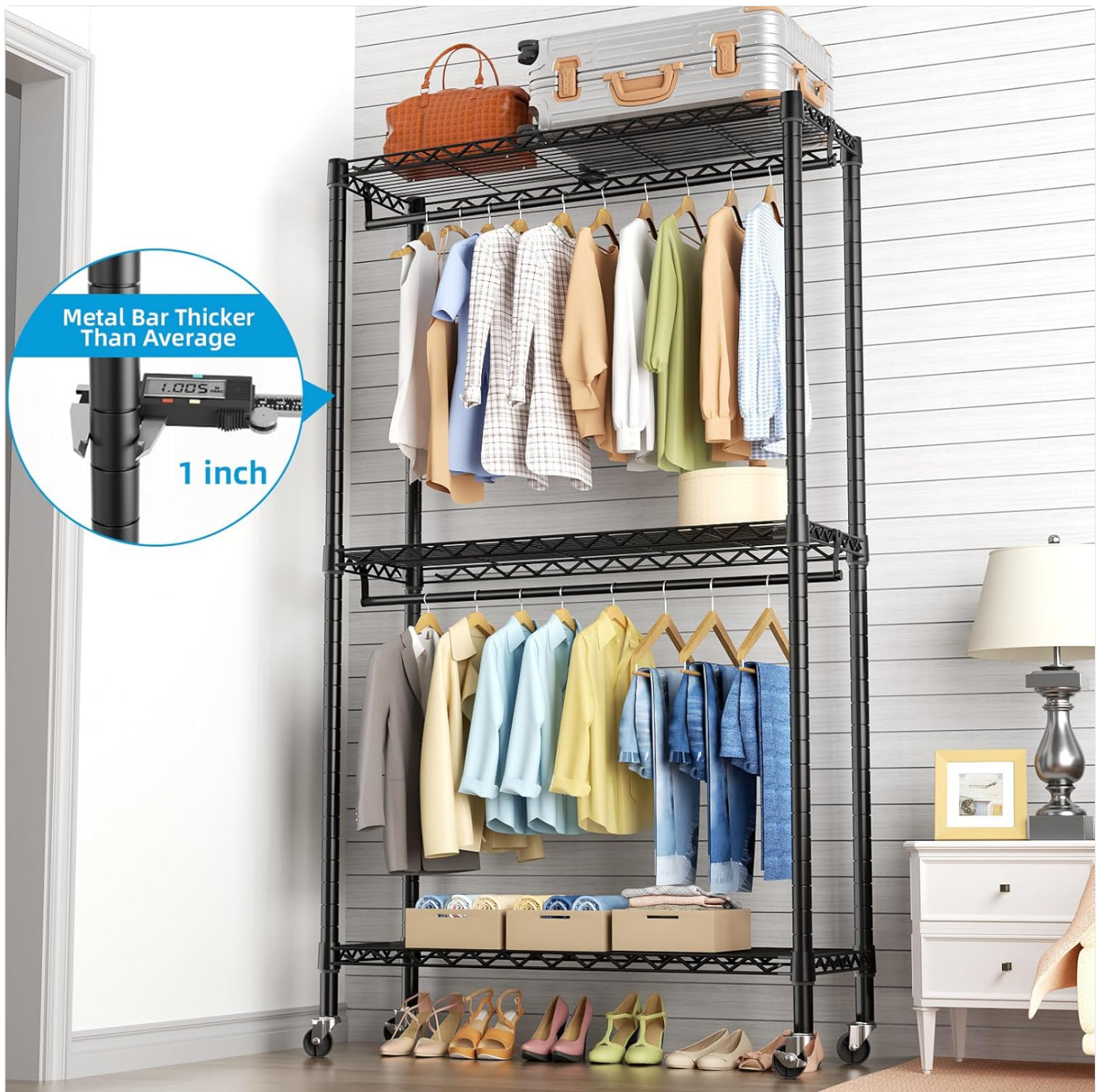
Figure 2.1: Detail showing the 1-inch pipe diameter, highlighting the robust construction.