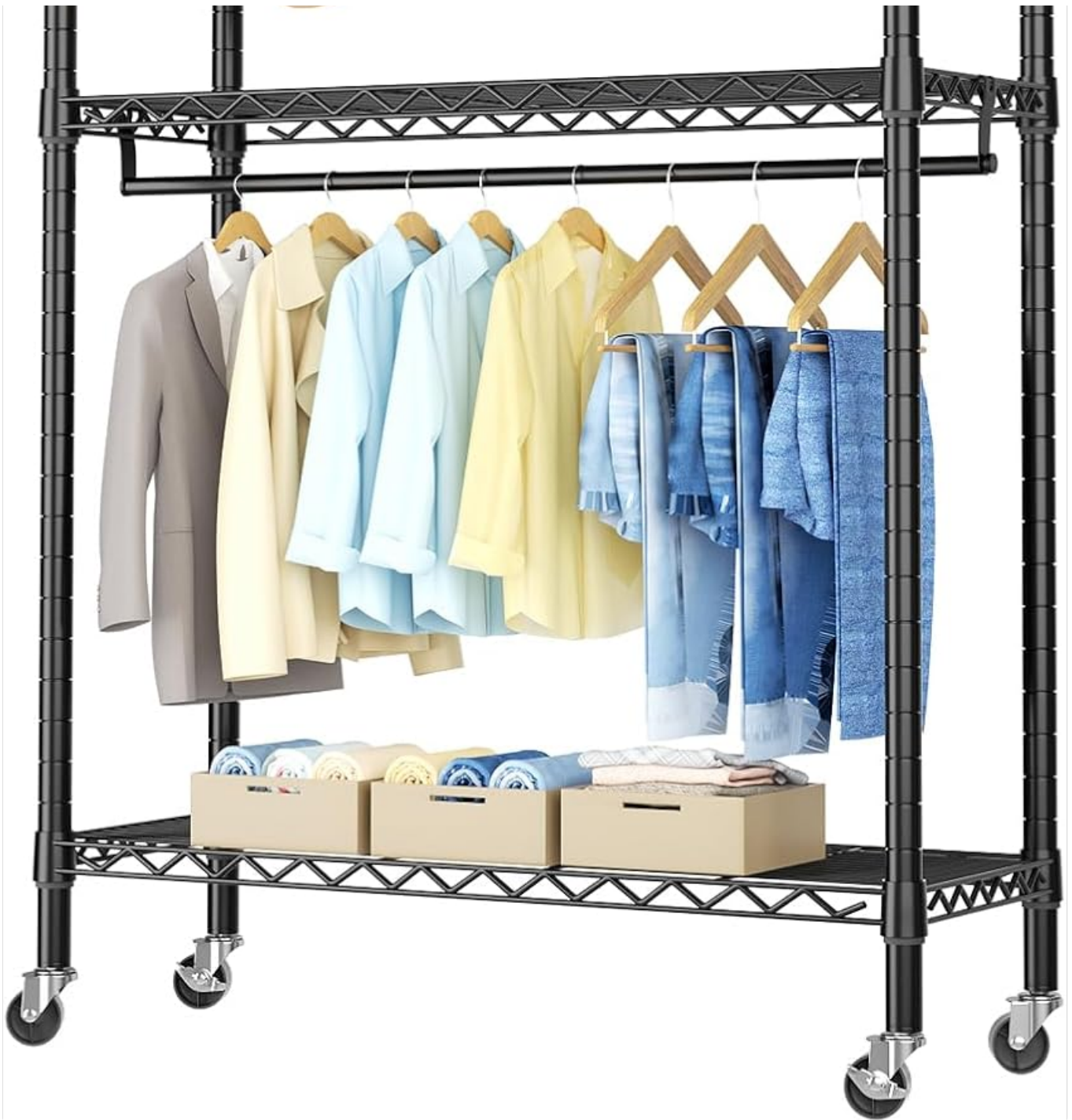
Figure 1.1: Golpart Heavy Duty Rolling Garment Rack in use, showcasing its storage capacity for hanging clothes and boxed items.