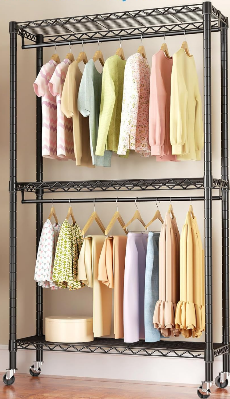
Figure 5.1: The 360° swivel wheels provide easy mobility, while the lockable casters ensure stability when the rack is stationary.