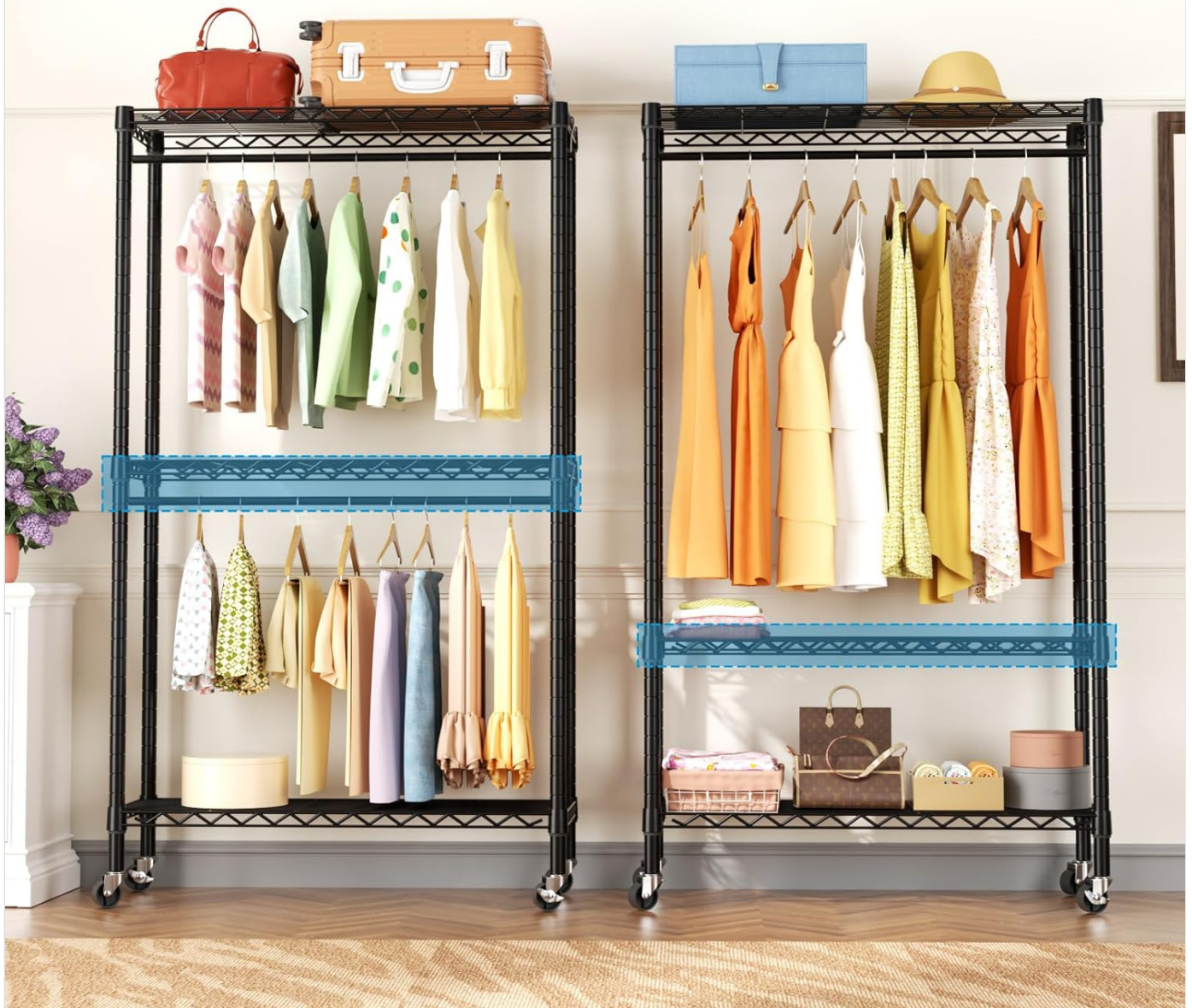
Figure 5.2: Examples of customizable configurations, illustrating how shelves and rods can be adjusted to suit individual storage needs.