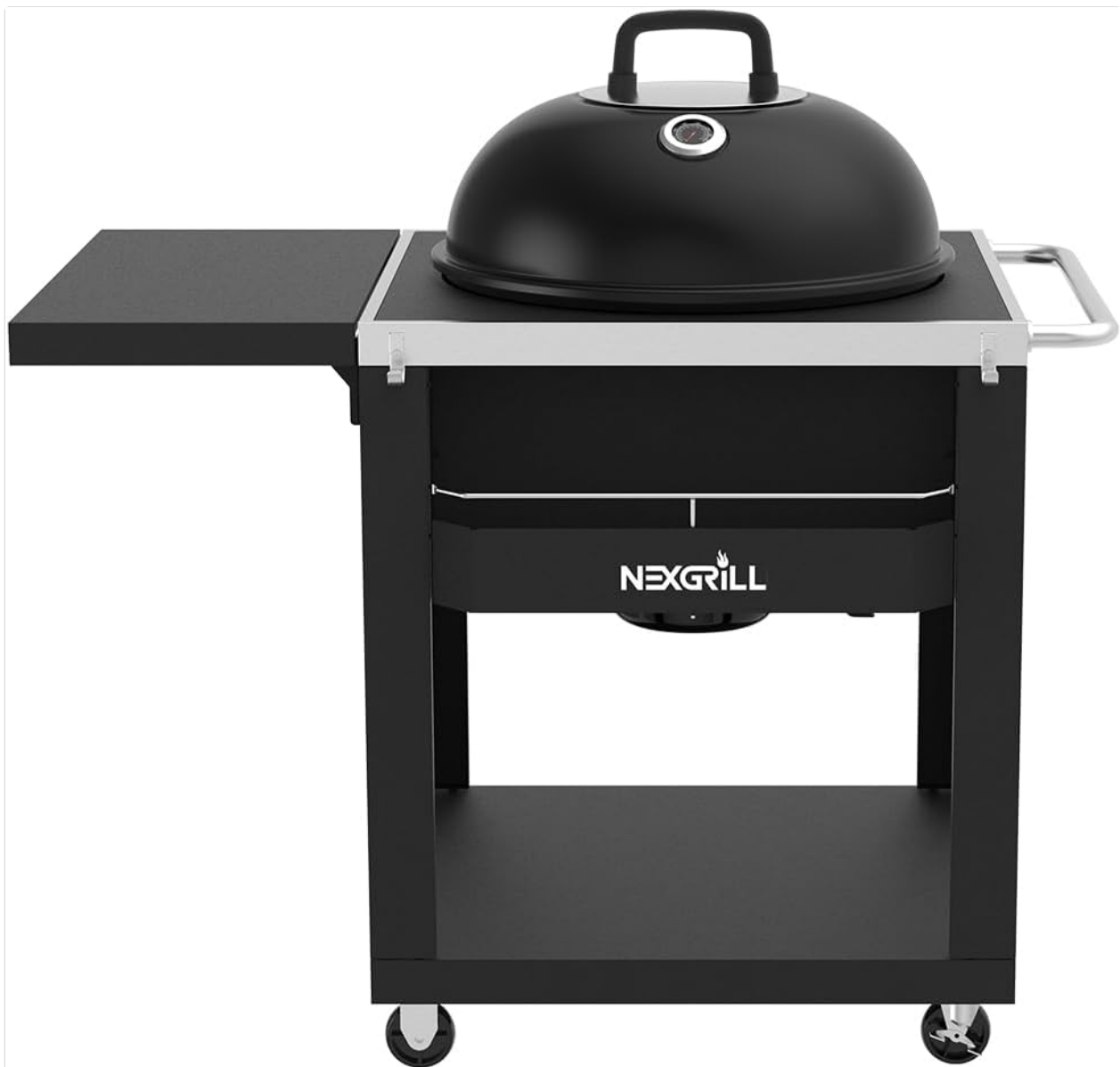
Overview of the Nexgrill 22-inch Charcoal Grill with Table Cart and Side Table.