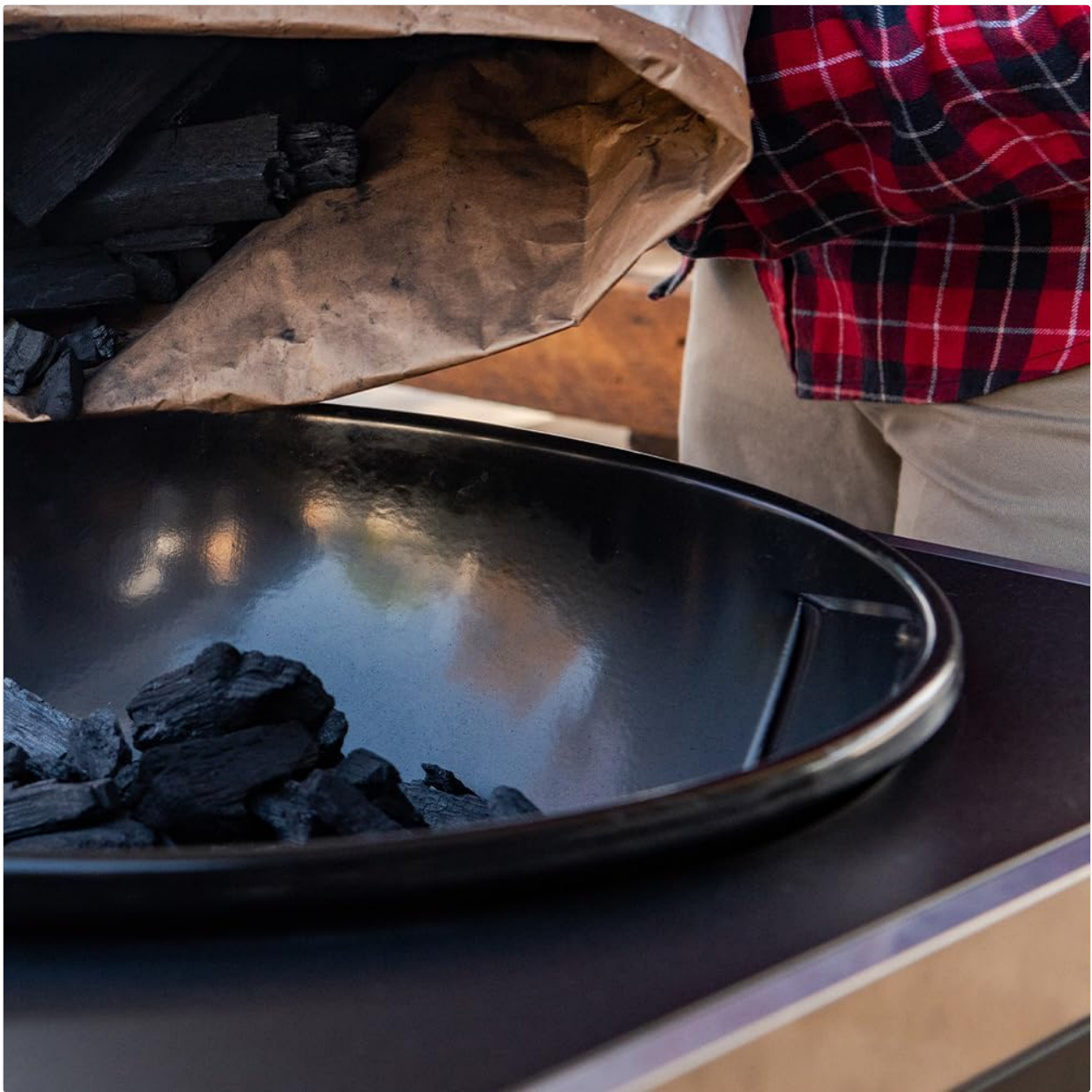
Image showing charcoal being loaded into the grill bowl.