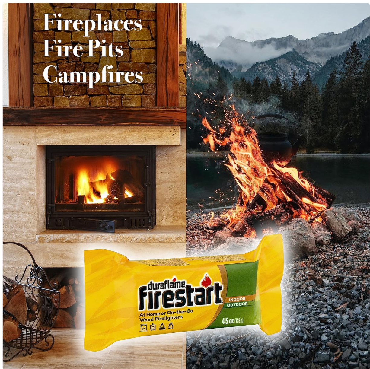
Image: Duraflame Firestart logs facilitating fires in various settings: a cozy fireplace, an outdoor fire pit, and a rustic campfire.