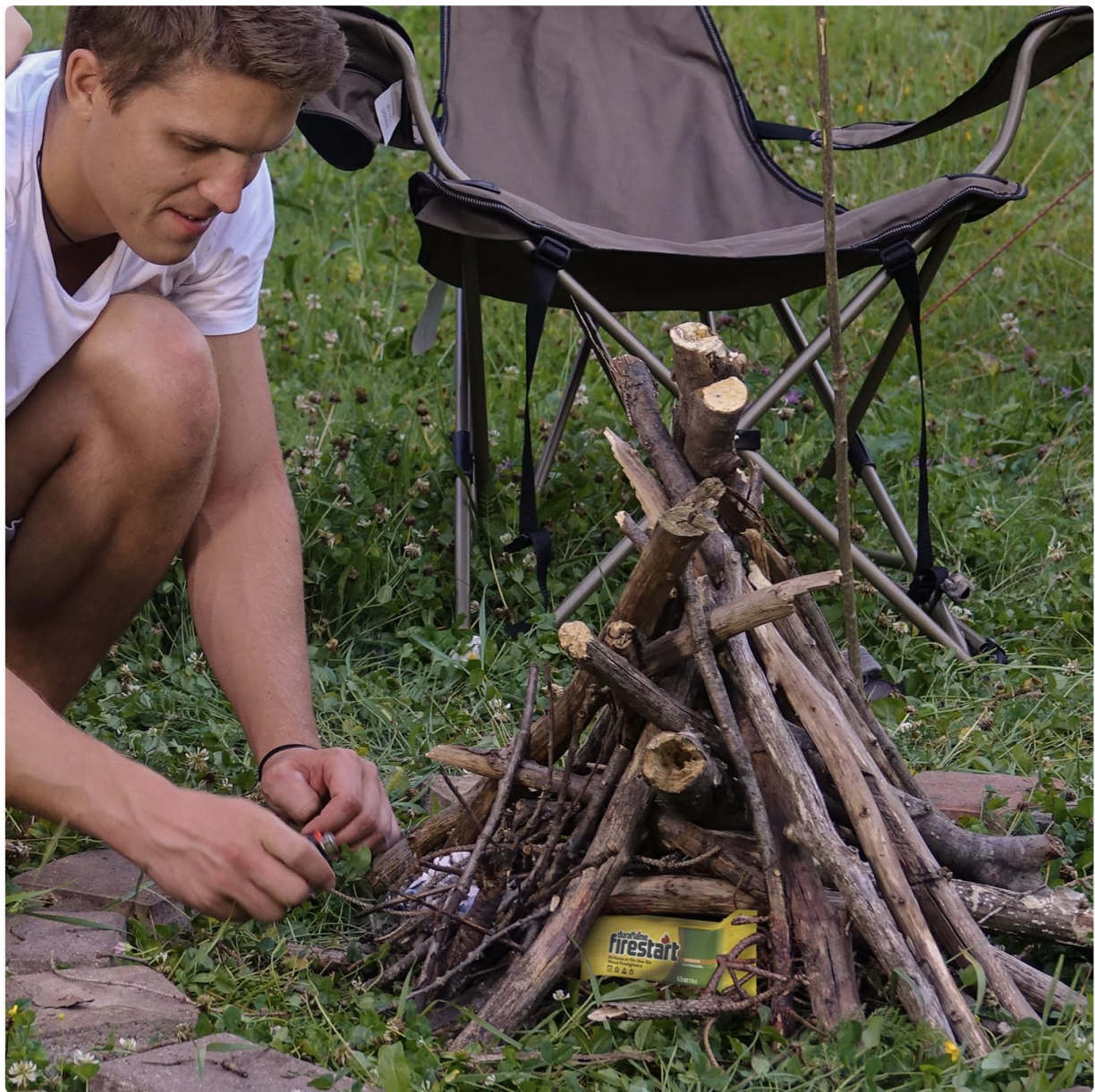
Image: A Duraflame Firestart log positioned under kindling in a campfire setup.

Place one individually wrapped Duraflame Firestart log directly under the kindling or smaller pieces of wood in your fire setup. Ensure the wrapper remains intact, as it is designed to ignite along with the fire starter.