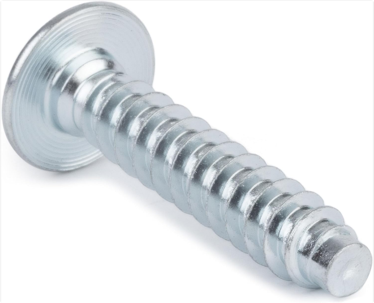
Image: A single Conformat hex screw, showcasing its design and material finish.