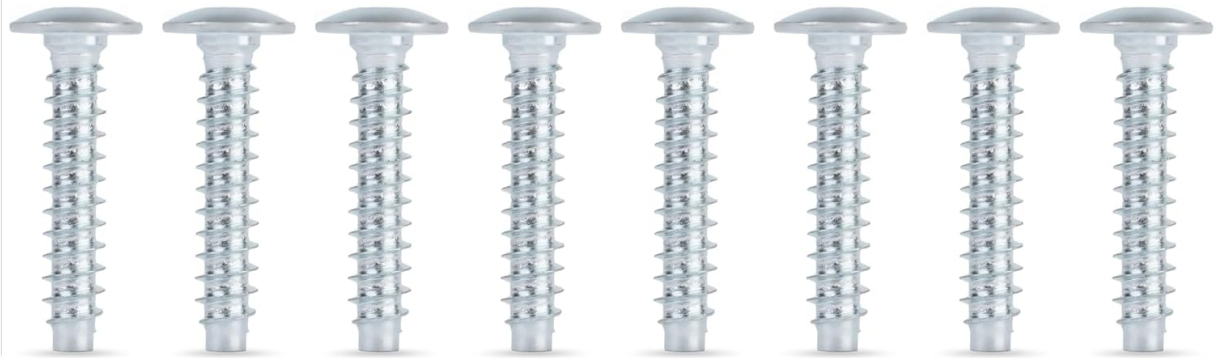
Image: A pack of 8 screws, as supplied.

Contains 8 individual pieces for all your assembly needs!