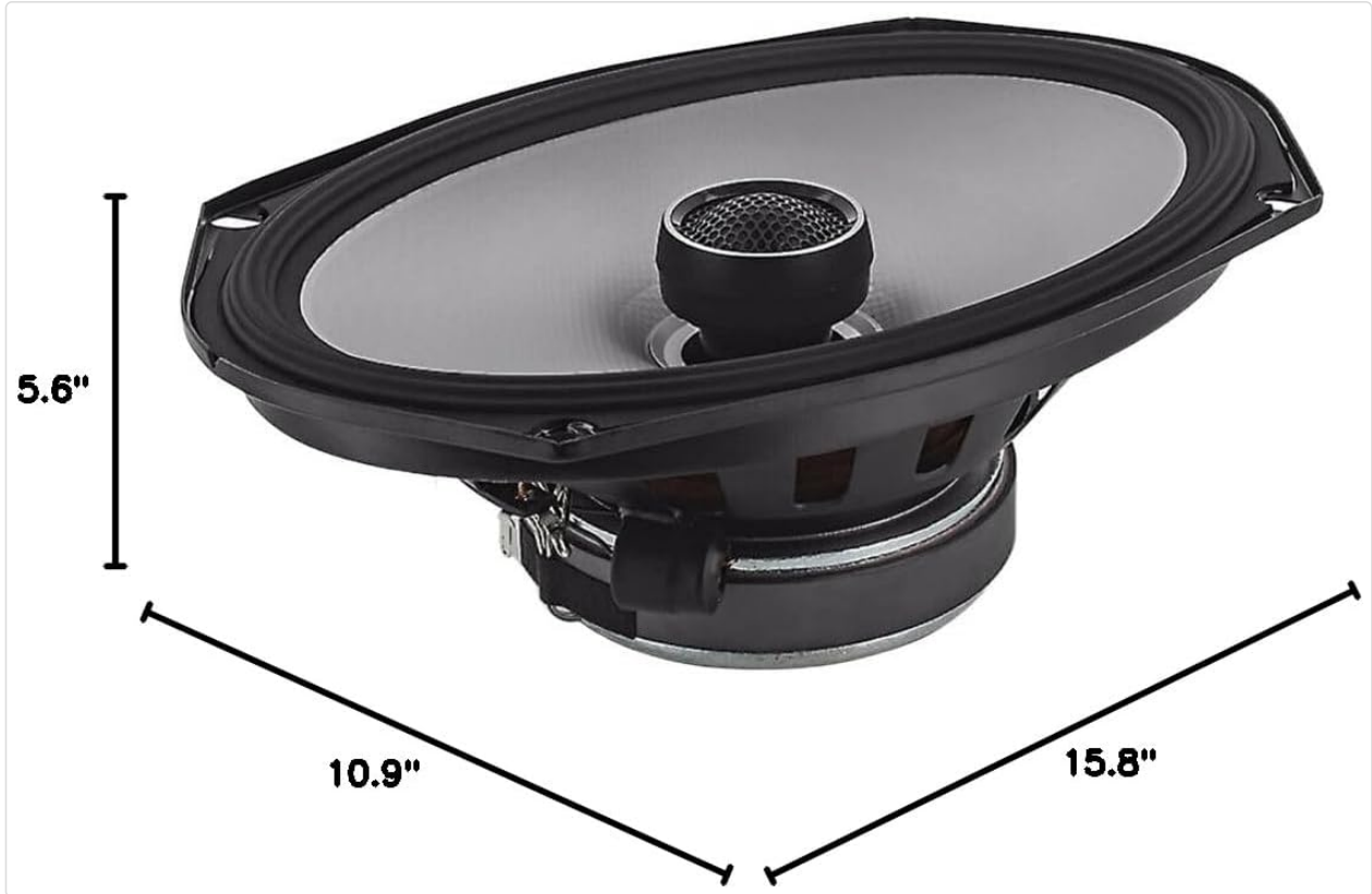
Figure 1: Alpine S2-S69 speaker with key dimensions.

The S2-S69 speakers are designed for door mount applications. Ensure adequate clearance for the speaker depth and diameter. The overall dimensions are approximately 5.6 inches (D) x 10.9 inches (W) x 15.8 inches (H).