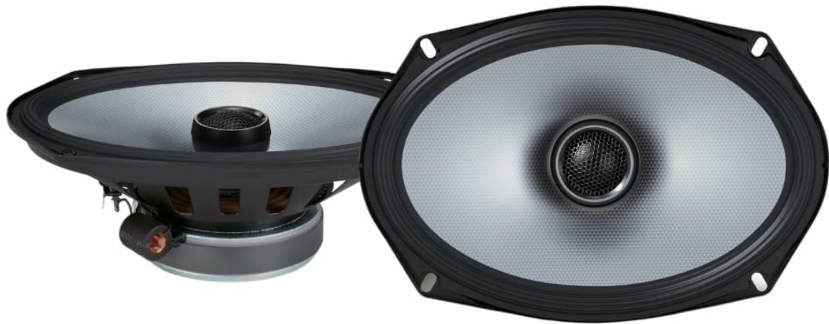
Figure 2: Rear view of the Alpine S2-S69 speaker, highlighting wiring terminals.