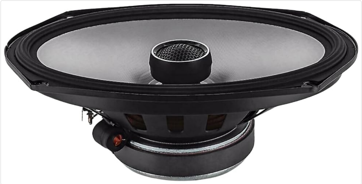
Figure 4: Front view of the Alpine S2-S69 speaker.