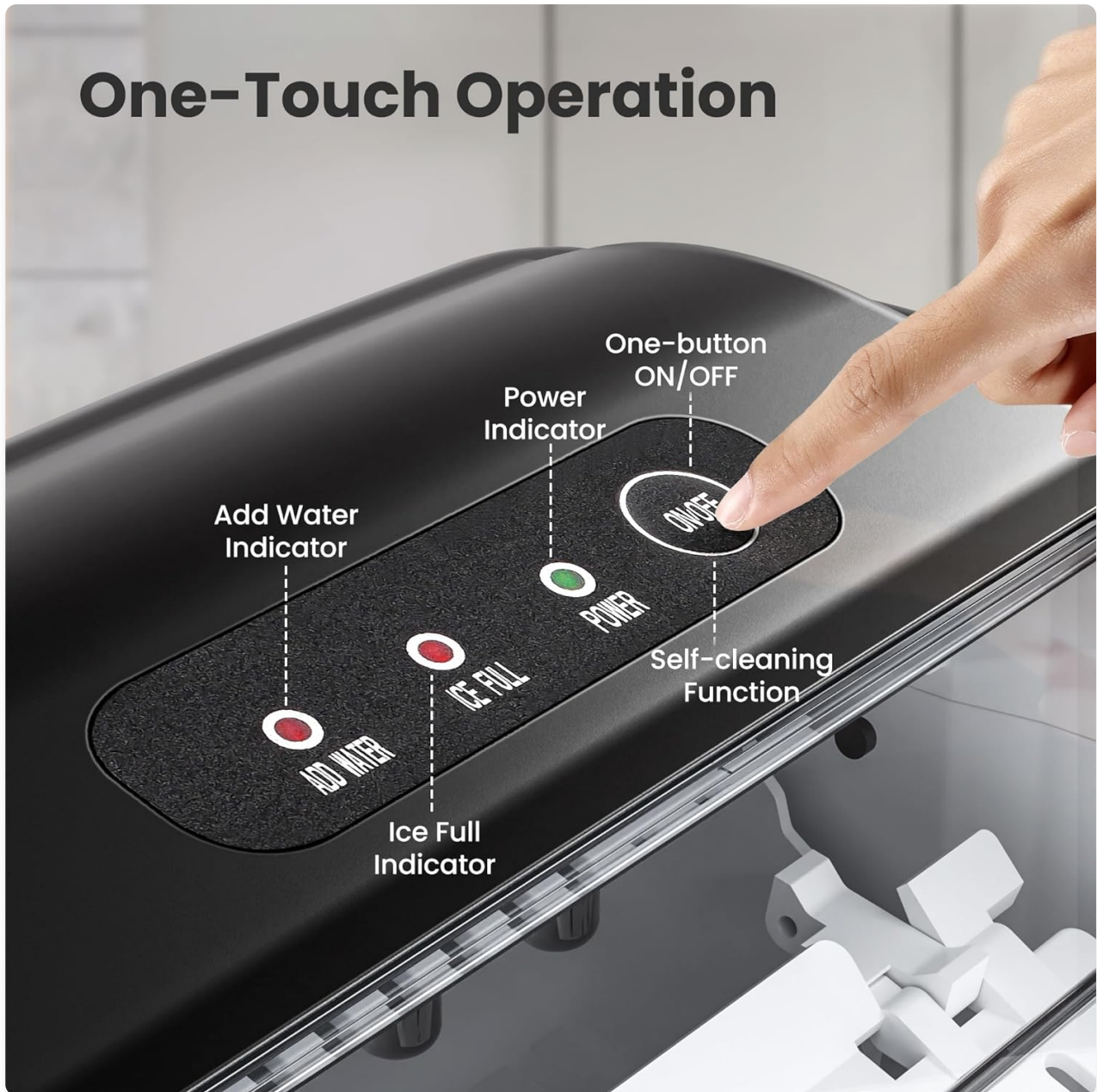
Image: Close-up of the ice maker's control panel showing the 'ON/OFF' button, 'POWER' indicator, 'ICE FULL' indicator, and 'ADD WATER' indicator.