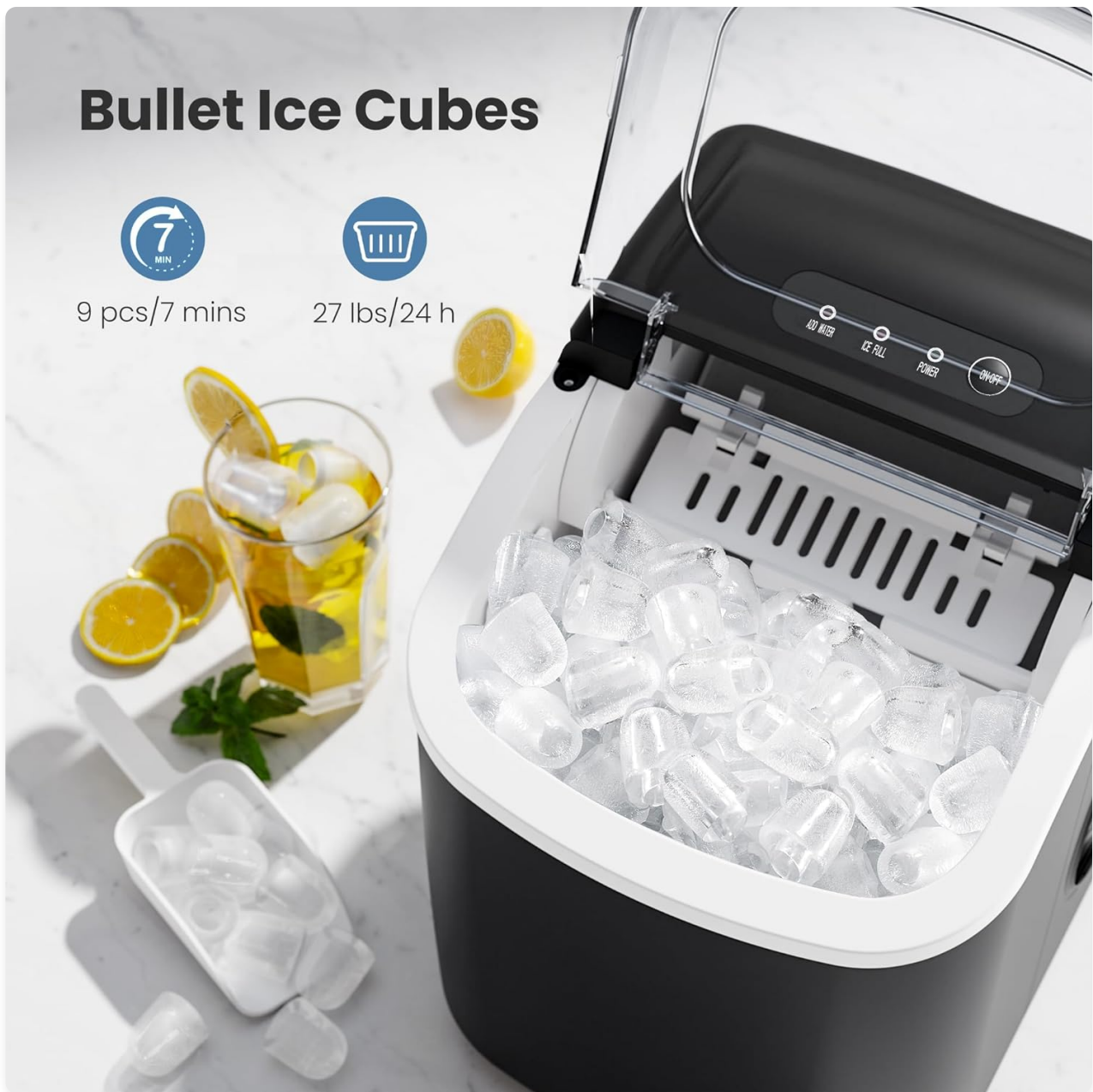
Image: A close-up view of the bullet-shaped ice cubes produced by the machine, with a glass of iced beverage in the background.