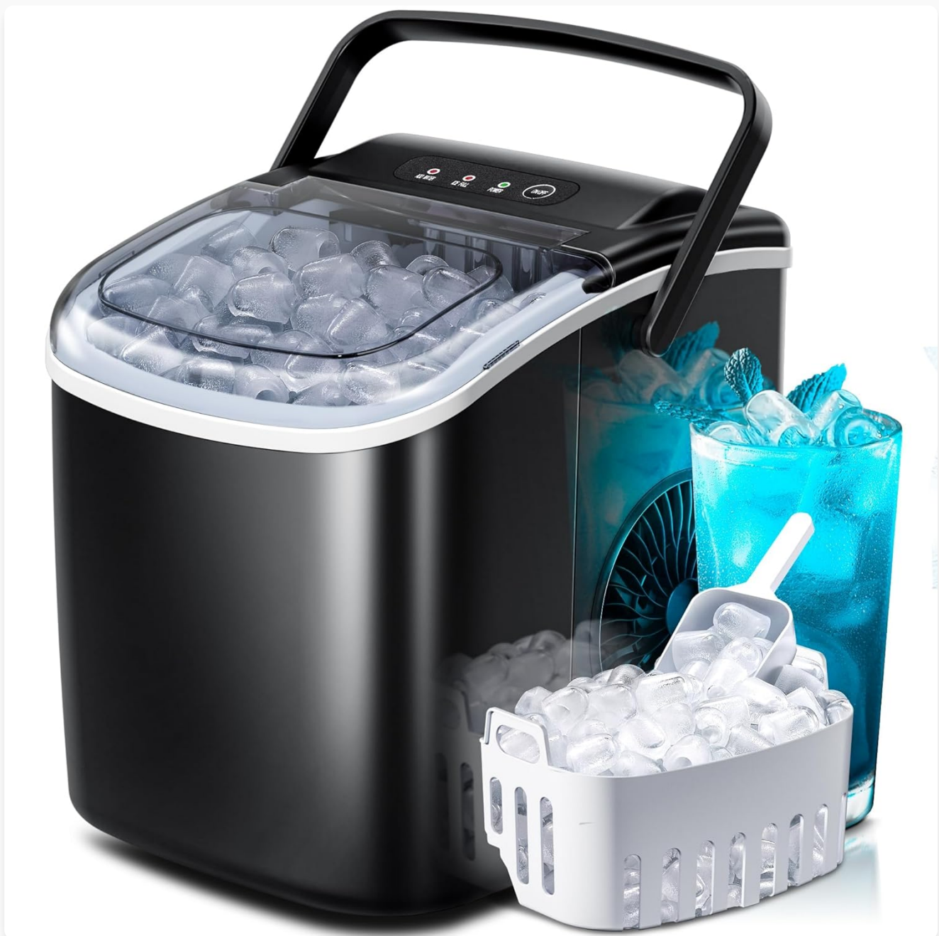
Image: Crzoe Countertop Ice Maker Machine with ice basket and scoop, alongside a glass of iced blue beverage.