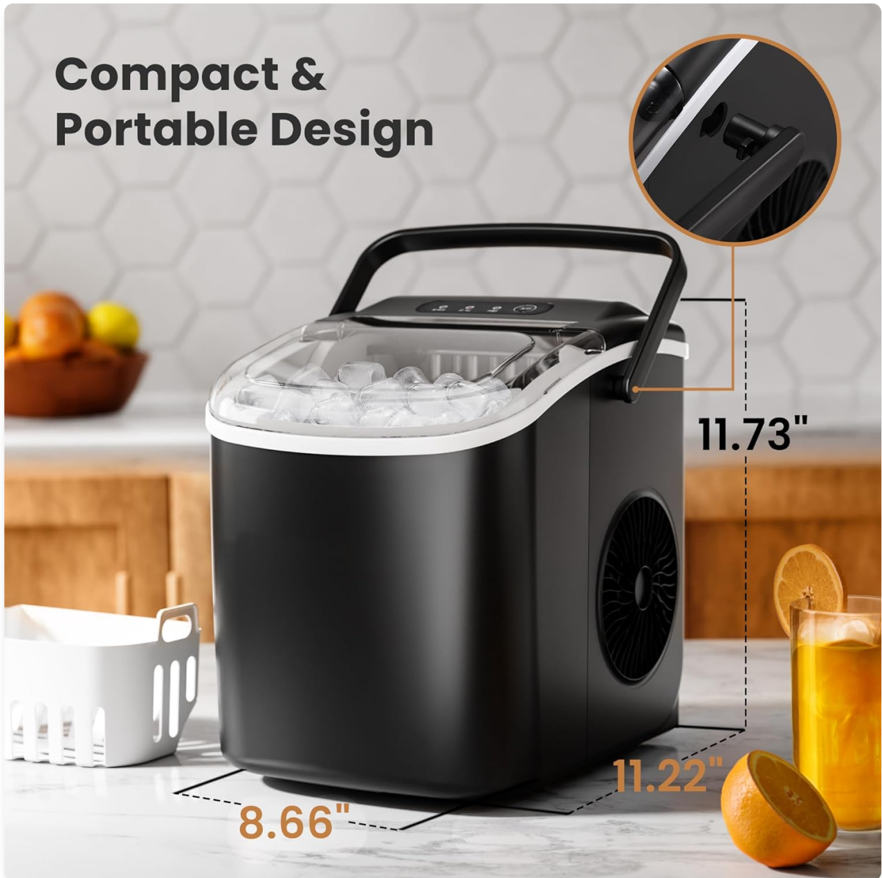
Image: The Crzoe ice maker highlighting its compact dimensions (11.22"D x 8.66"W x 11.73"H) and integrated handle for portability.