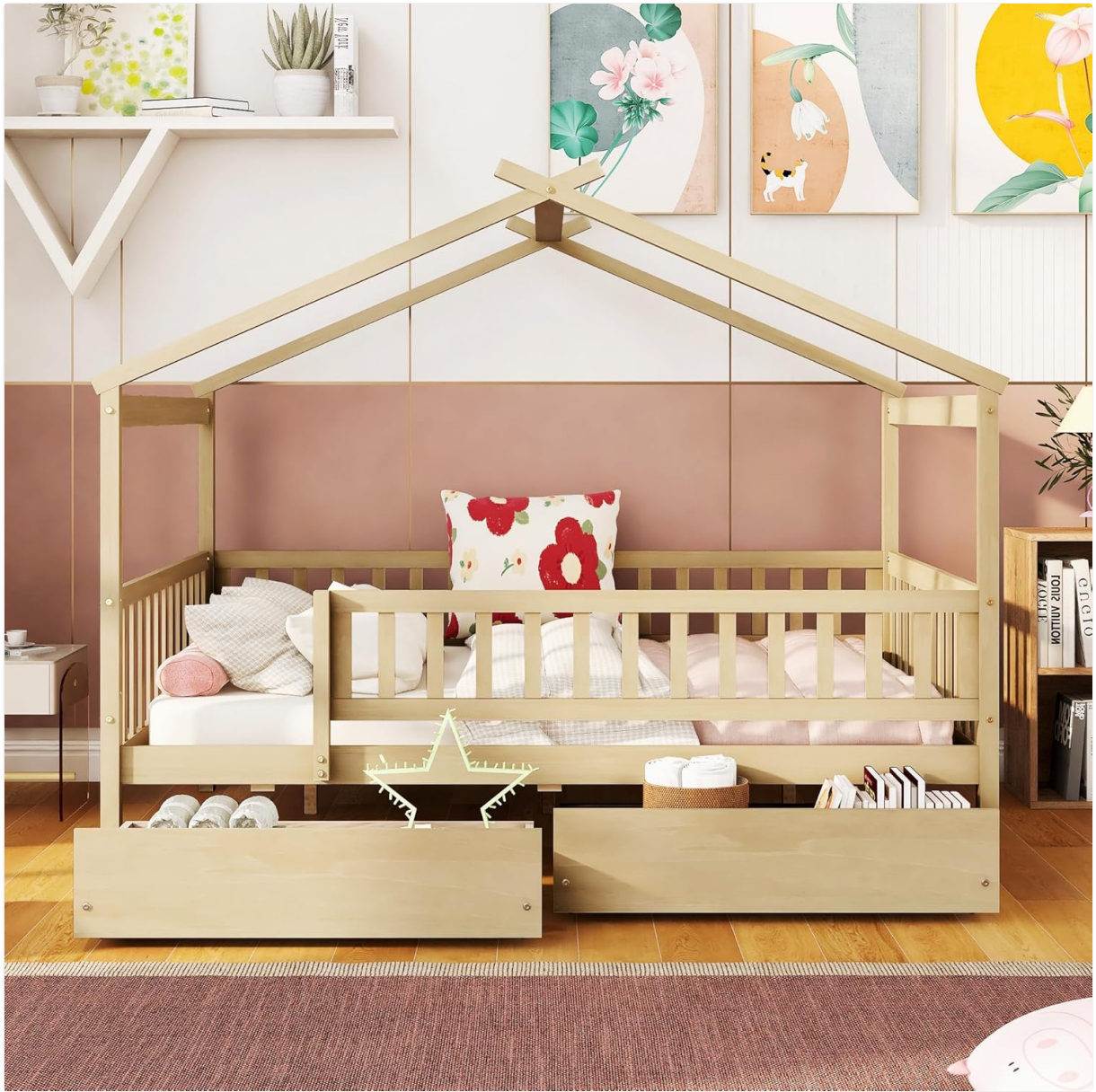
Figure 5.1: Fully assembled bed frame.