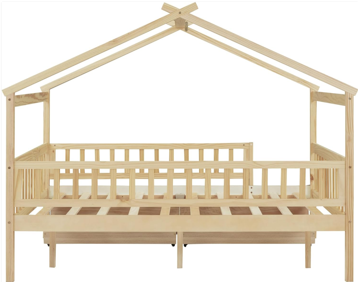
Figure 5.2: Detail of the integrated storage drawers.