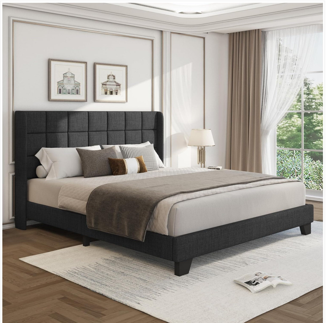
Image: The upholstered wingback headboard and side rails of the bed frame.