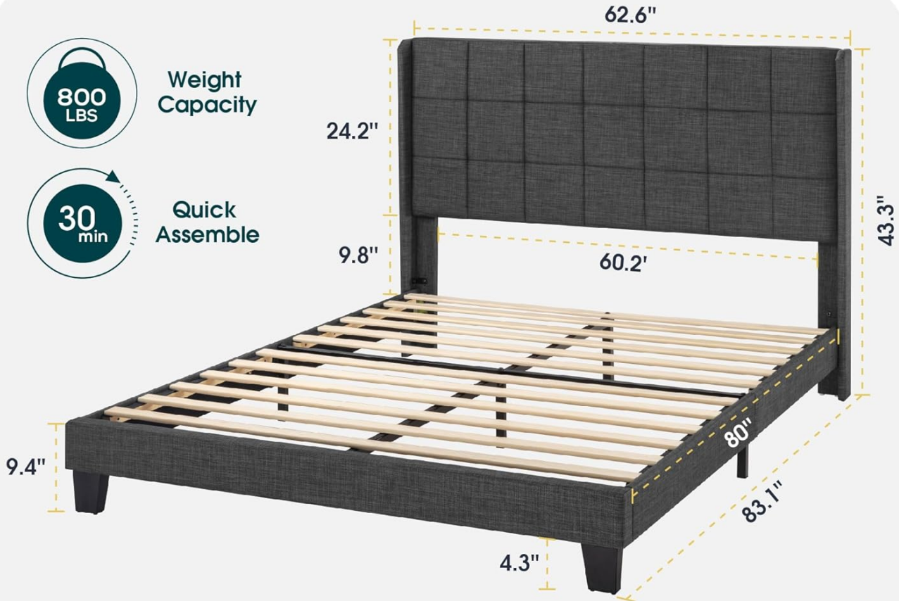
Image: Detailed dimensions diagram for the WEEWAY Queen Size Bed Frame, showing length, width, and height measurements.