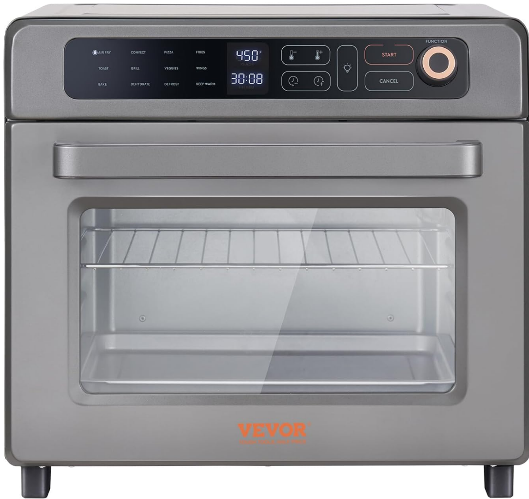
Figure 2.2.1: Front view of the VEVOR 12-IN-1 Air Fryer Toaster Oven, showcasing the control panel and glass door.