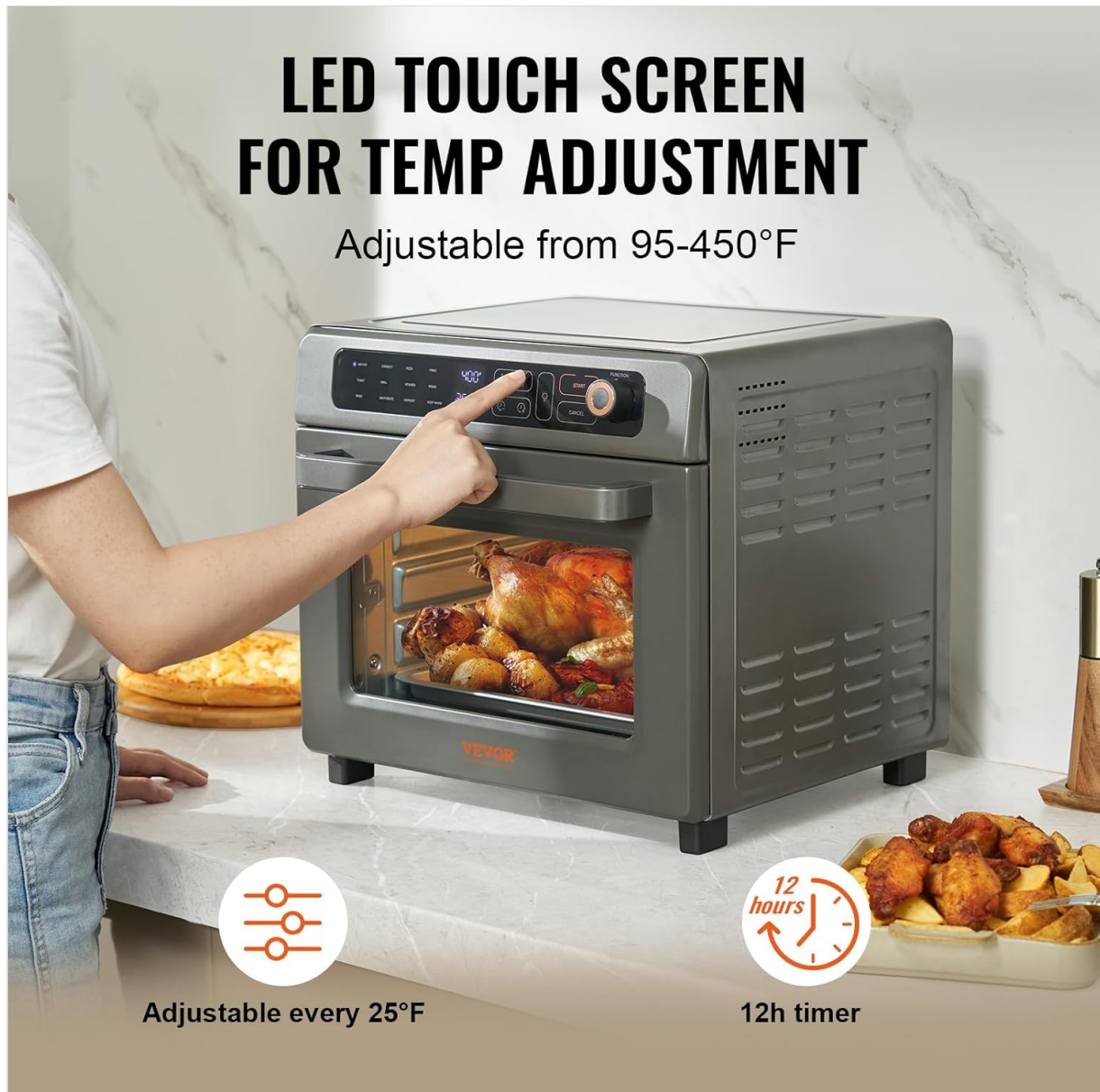
Figure 4.1.1: Close-up of the LED touch screen, showing temperature and timer controls, and function selection buttons.