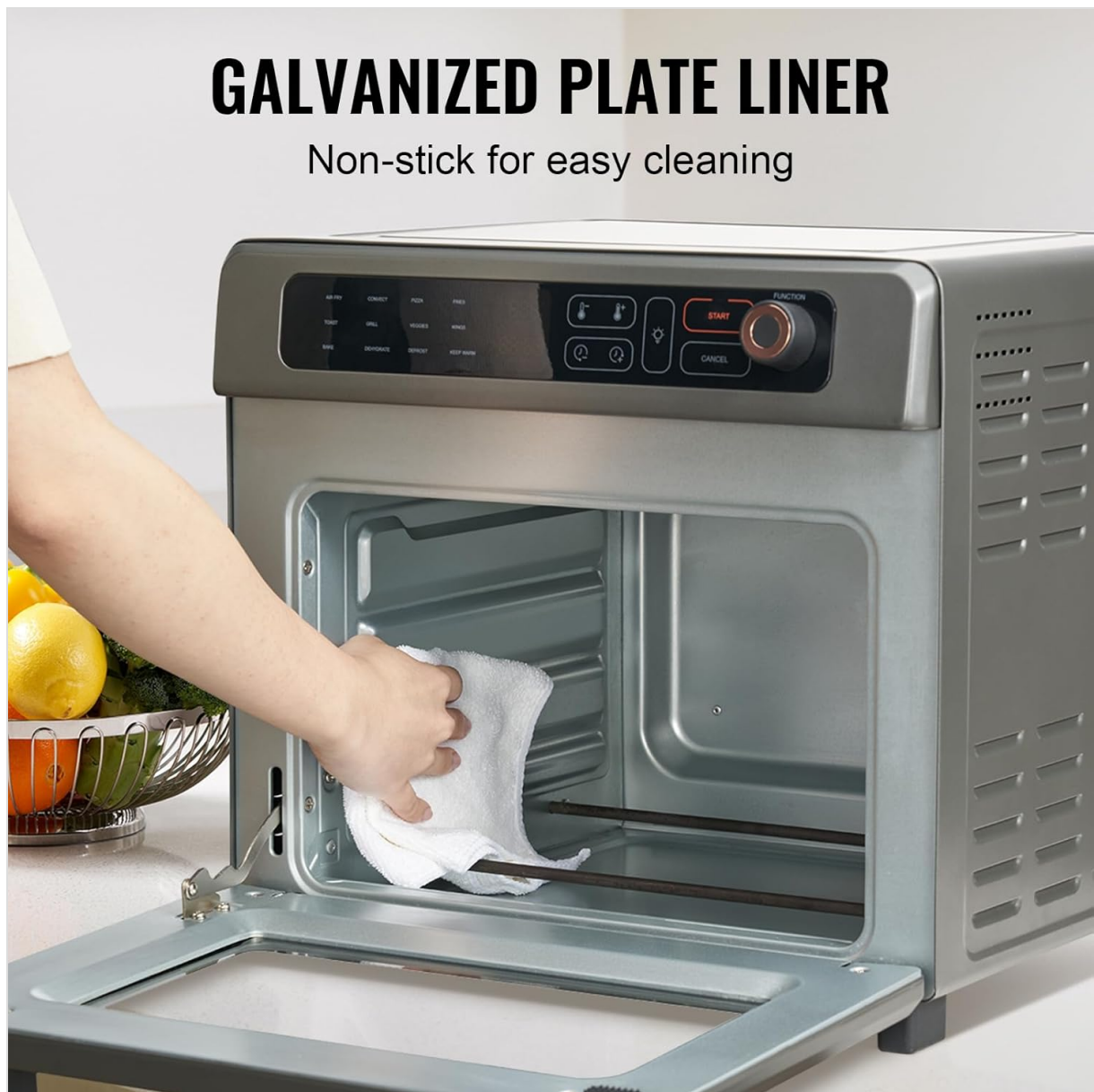
Figure 5.1.1: Demonstrates the ease of cleaning the non-stick galvanized plate liner inside the oven.