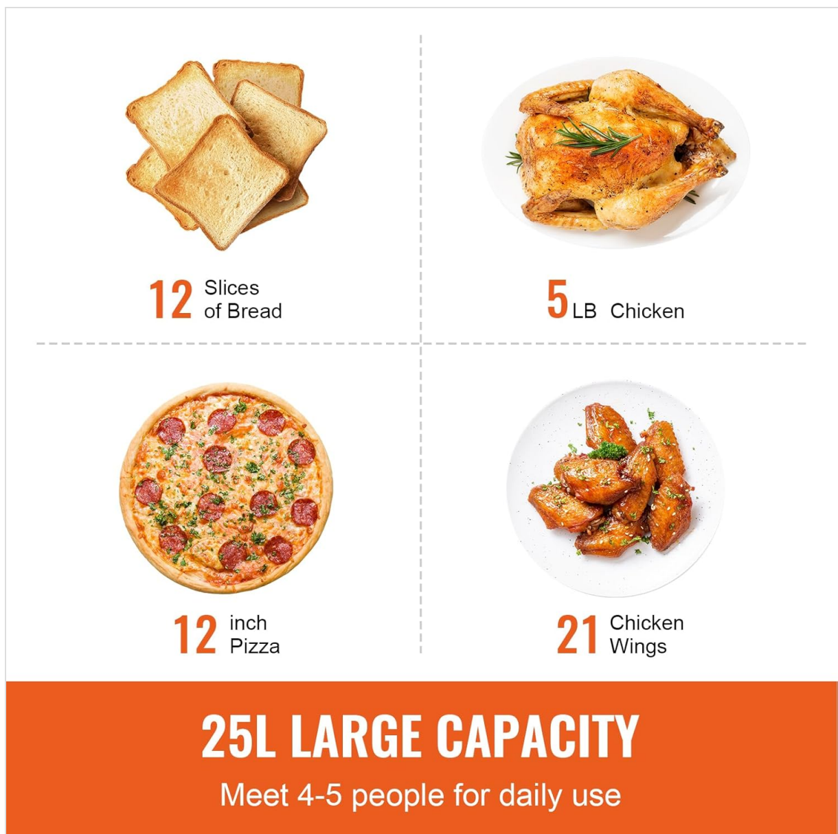
Figure 4.3.1: Examples of food quantities that can be accommodated by the 25L capacity, including 12 slices of bread, a 5 lb chicken, a 12-inch pizza, and 21 chicken wings.

The 25L capacity is designed to handle various meal sizes: