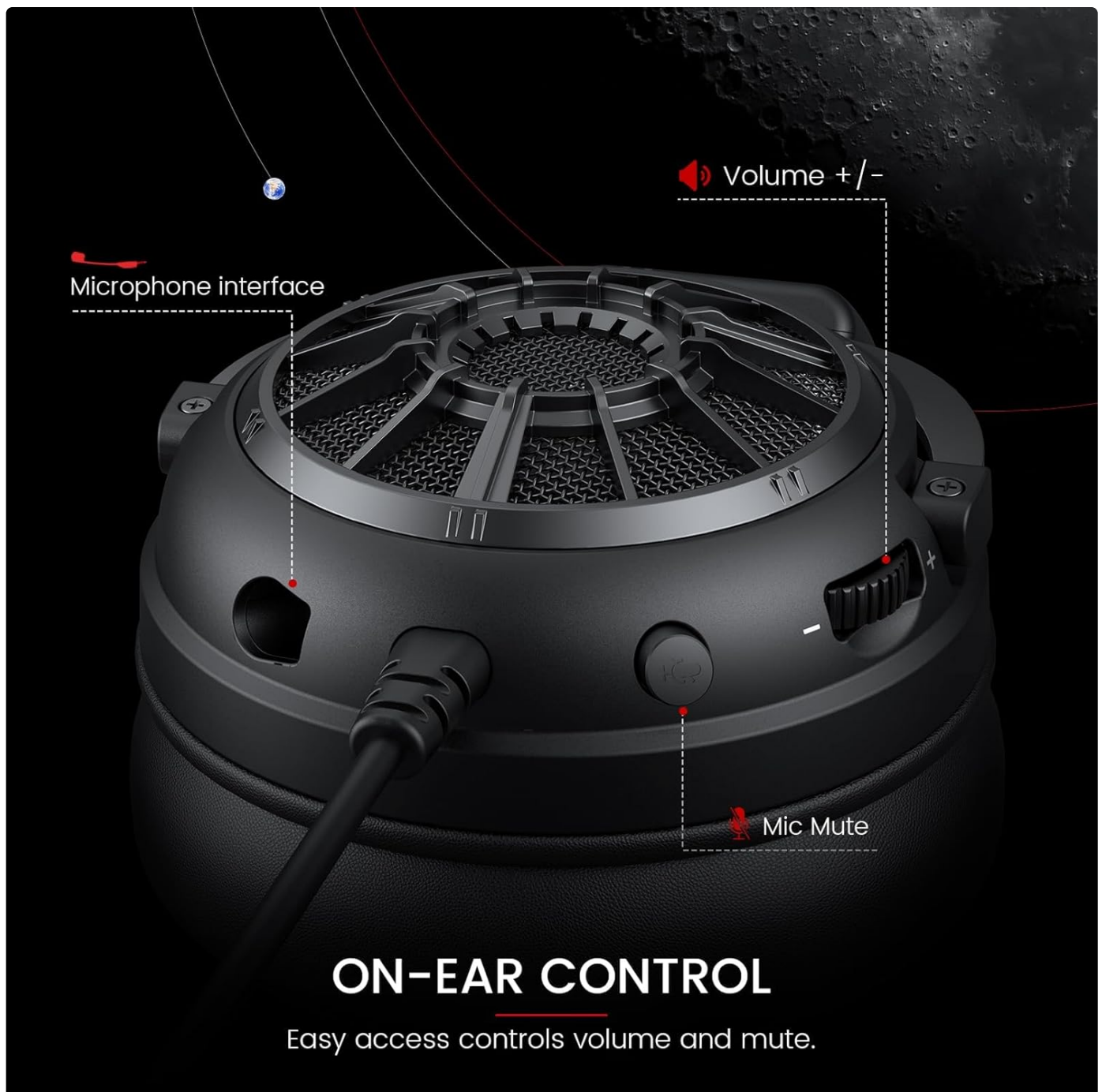
Image: Detailed view of the volume control and mic mute button on the headset's earcup.