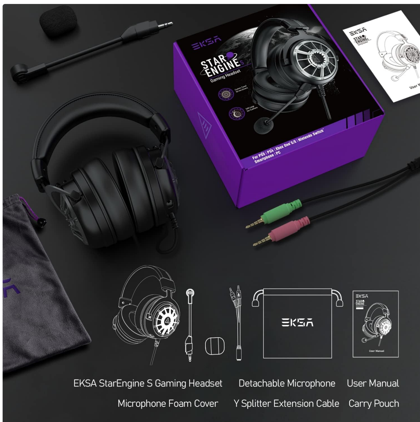
Image: All components included with the EKSA StarEngine S headset, neatly arranged.