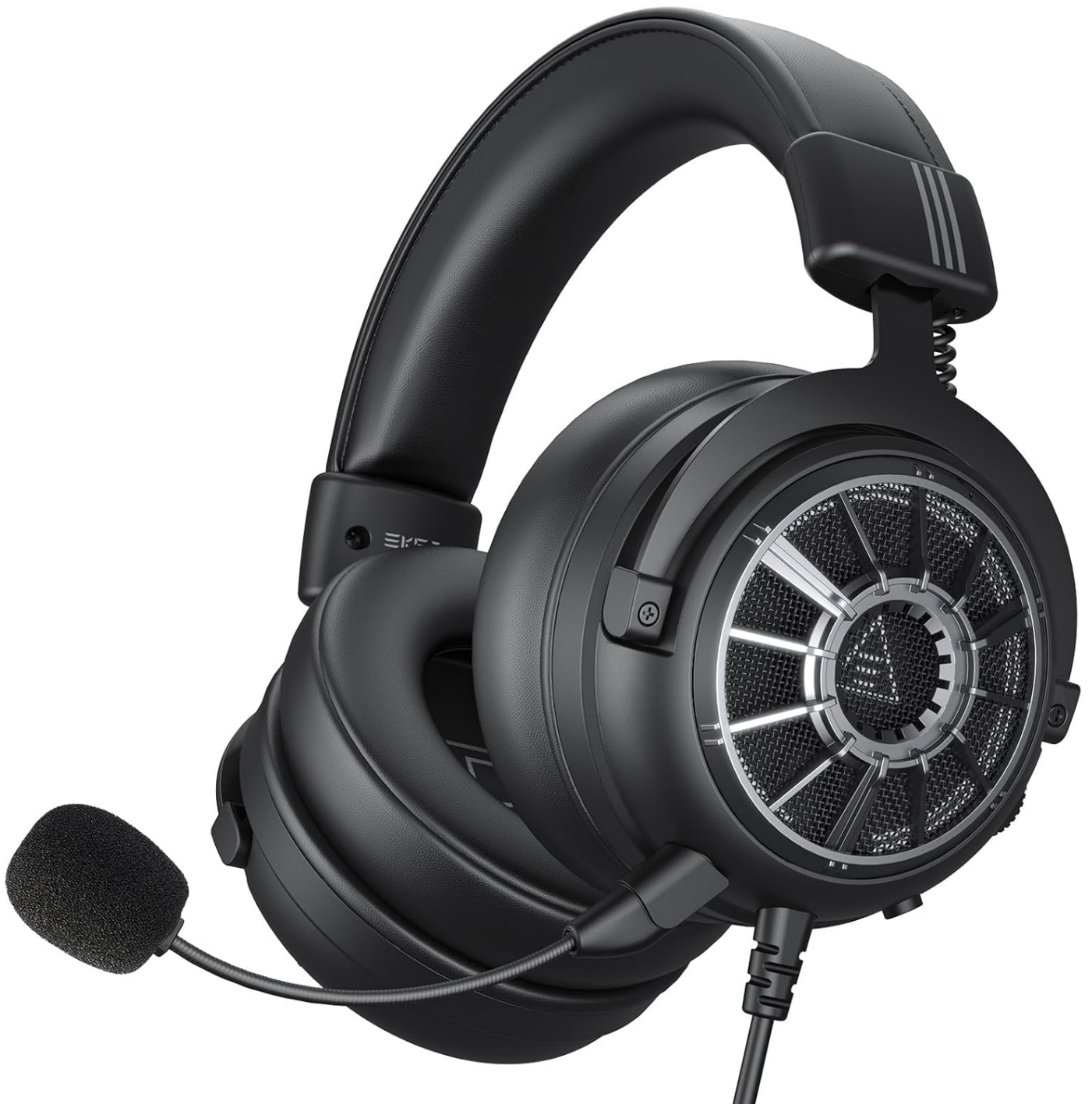
Image: The EKSA StarEngine S Gaming Headset, showcasing its overall design with the detachable microphone attached.