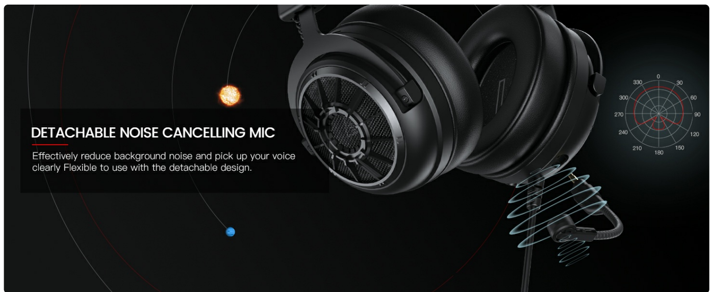
Image: Visual representation of the headset's adjustable features for comfort.