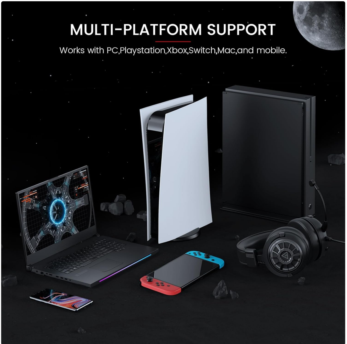
Image: Multi-platform compatibility of the headset with different gaming systems.

Works with PC,Playstation,Xbox,Switch,Mac,and mobile.