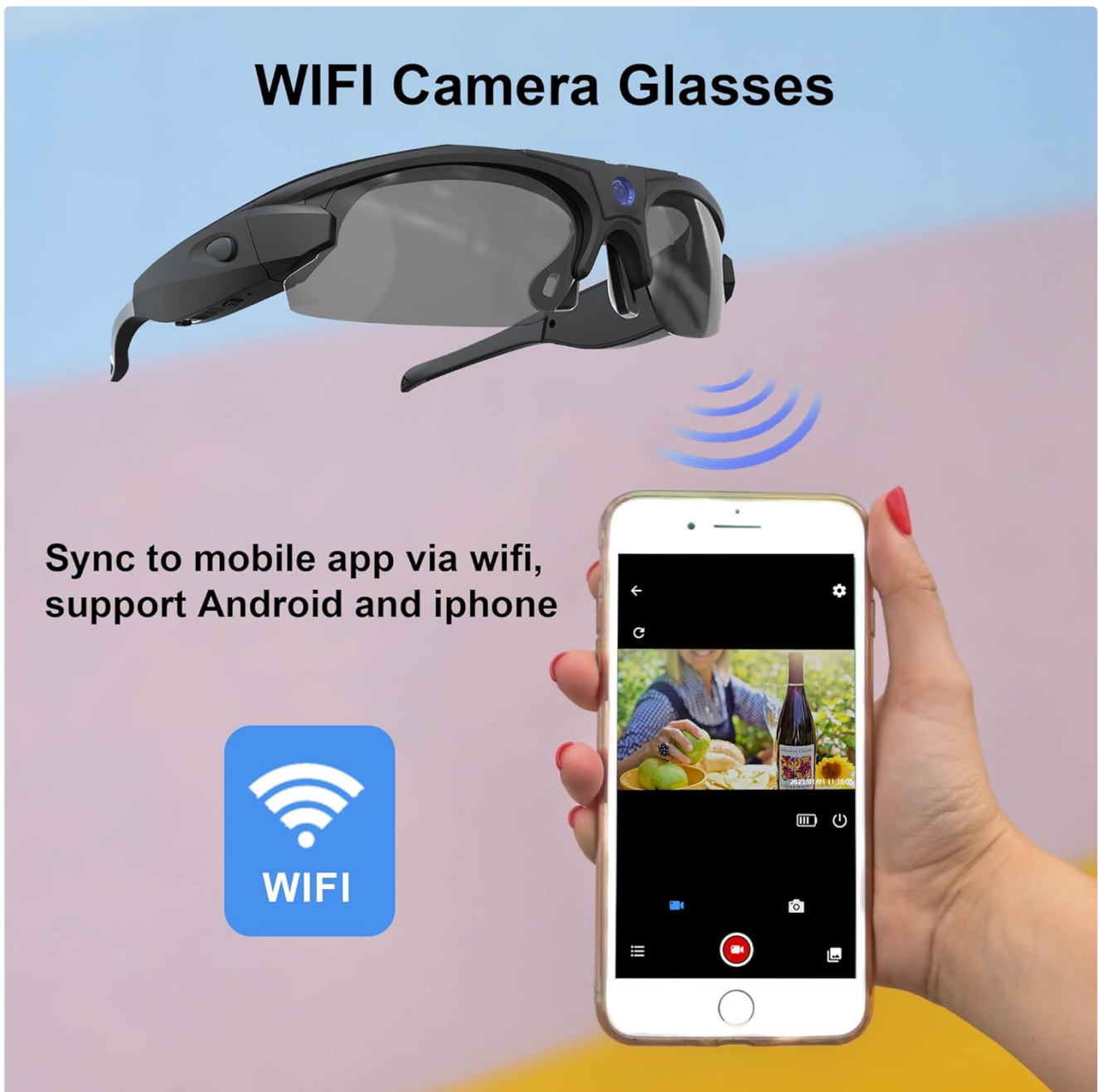
Figure 6: RERBO MS35 WiFi Camera Sunglasses connected to a mobile app for remote control and media management.

Video 3: Guide on connecting the RERBO MS35 to a smartphone via WiFi and using the companion app.