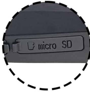
TF Card Slot