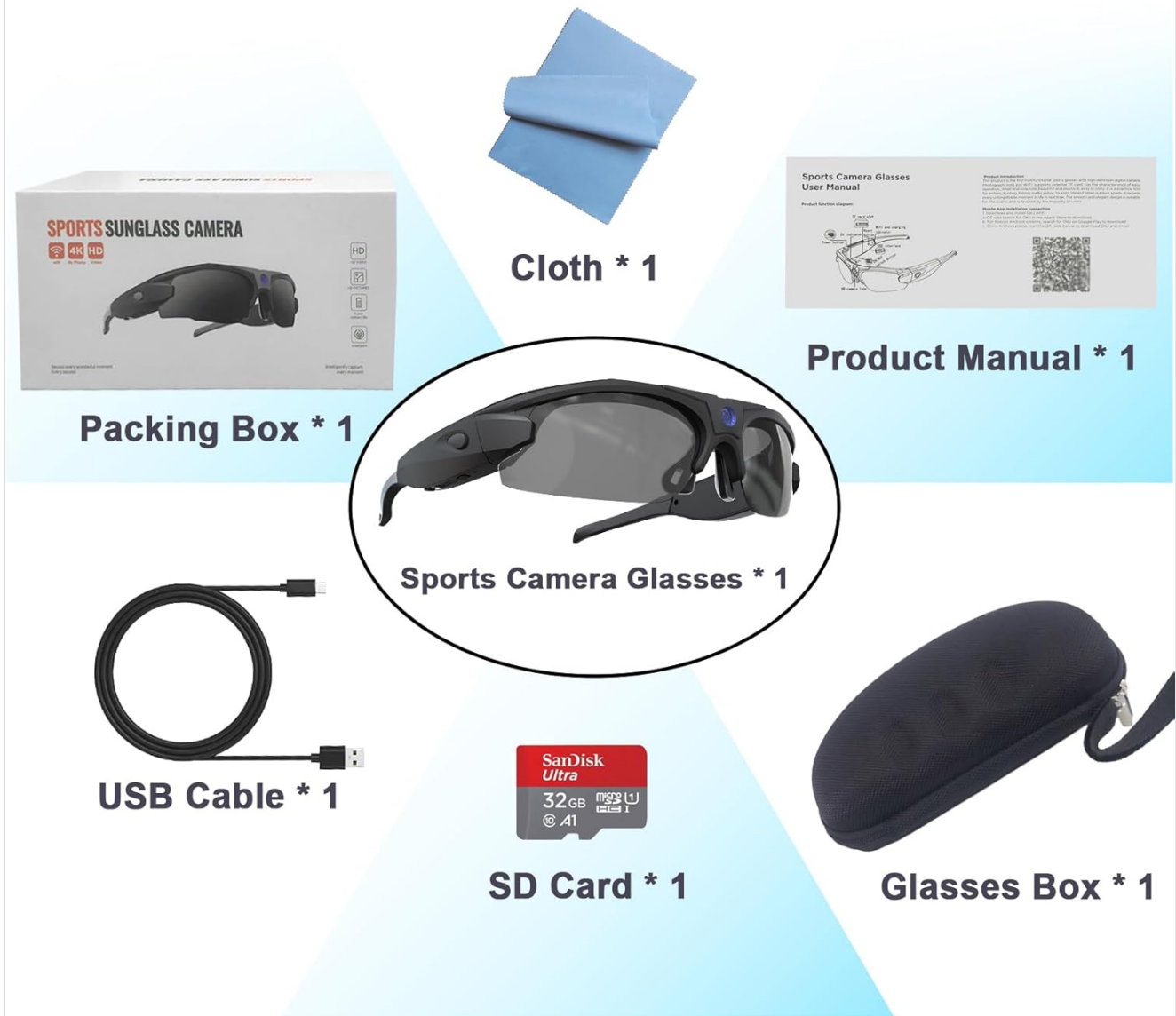
Figure 2: Package contents including the camera glasses, case, 32GB SD card, and USB cable.