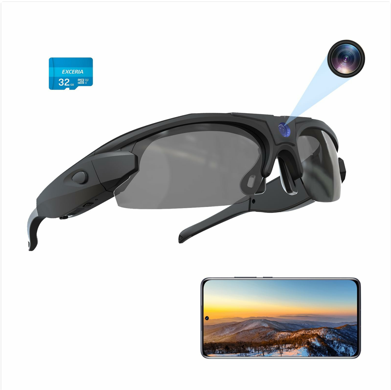
Figure 1: RERBO MS35 WiFi Camera Sunglasses