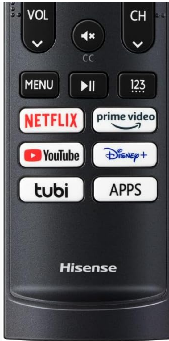
Image: The Hisense U8K TV remote control, featuring dedicated buttons for power, input, settings, navigation, volume, channel, and popular streaming services like Netflix, Prime Video, YouTube, and Disney+. It also includes a Google Assistant button for voice commands.