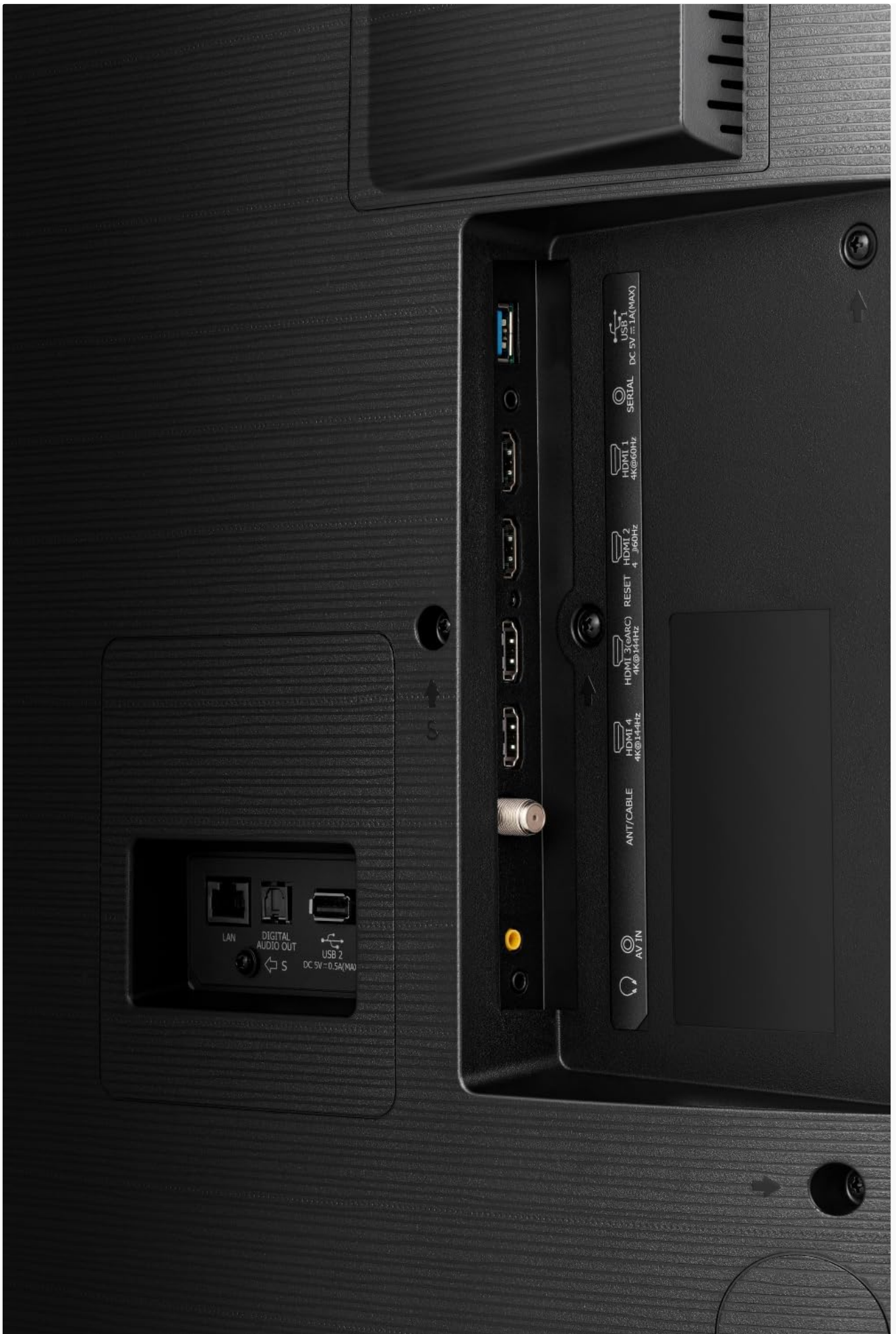
Image: Detailed view of the Hisense U8K TV's rear input panel, showing ports for HDMI, USB, LAN (Ethernet), Antenna/Cable, and AV input.