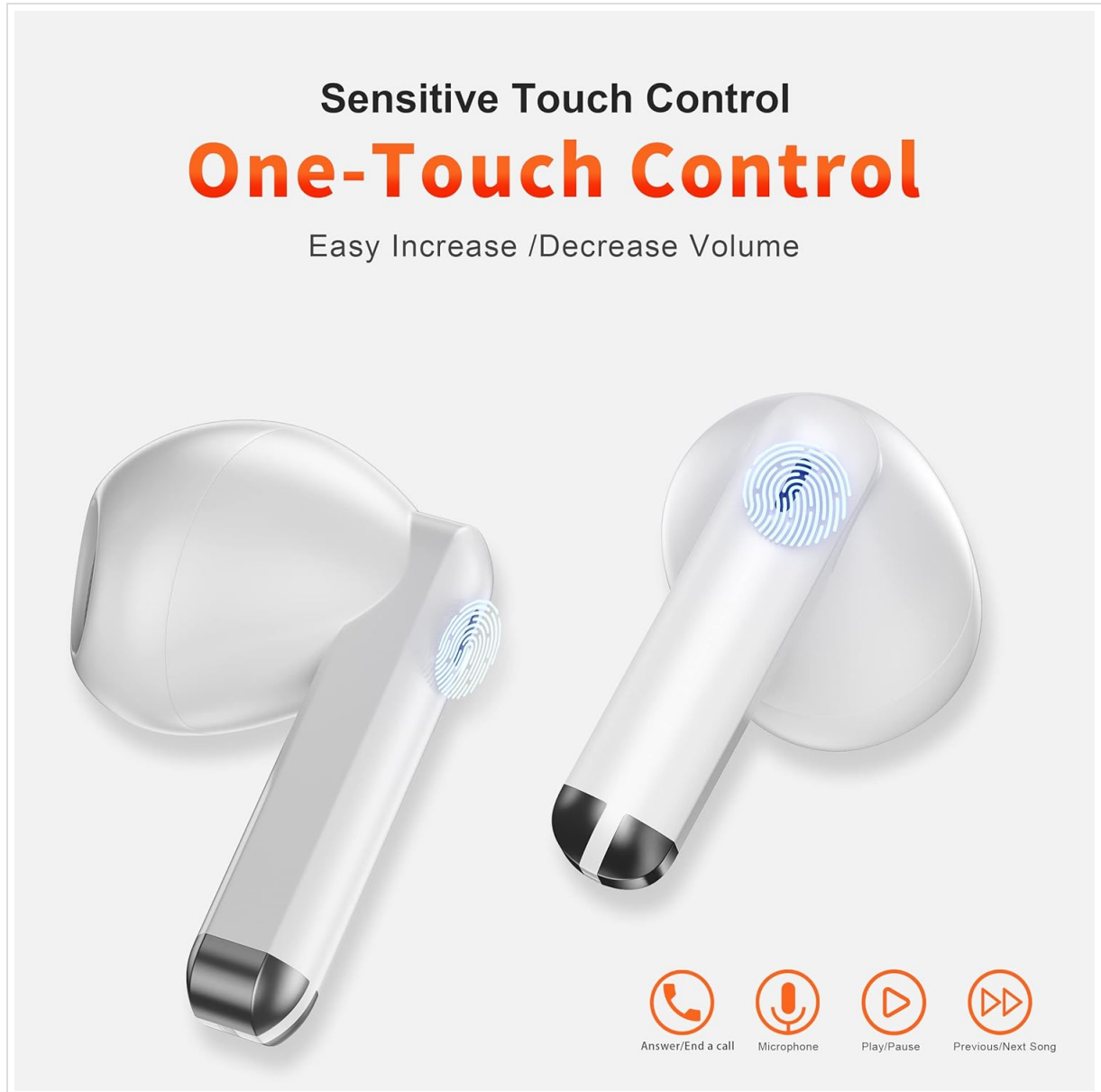
Image 4: Diagram illustrating the touch control functions on the QERE M28 earbuds, including answering/ending calls, microphone activation, play/pause, and previous/next song.

The QERE M28 earbuds feature sensitive touch controls for managing audio playback and calls.