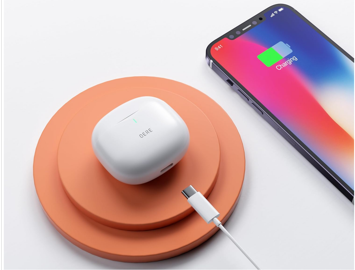
Image 3: The QERE M28 charging case connected via a USB Type-C cable to a power source, indicating quick charge technology for a full battery in 1.5 hours.

Quick Charge Technology for Full Battery in 1.5 Hours