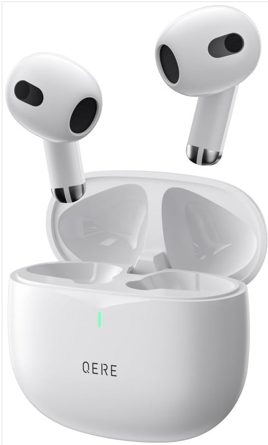
Image 1: QERE M28 Gaming Earbuds and Charging Case. The earbuds are white and rest in their open charging case, which also features the QERE logo.