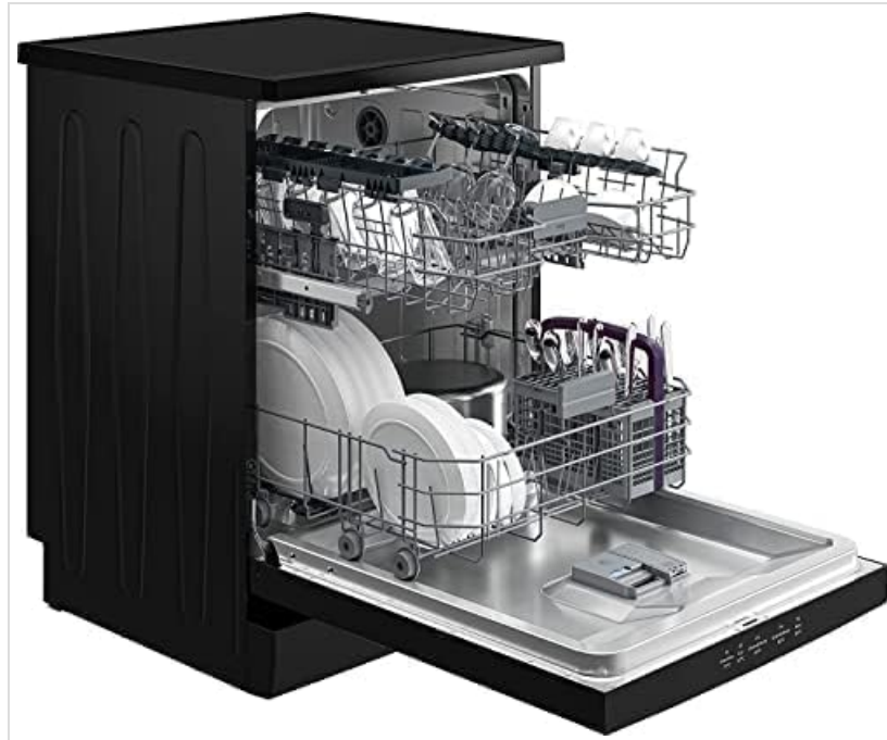
Image: The interior of the Beko BDFN15420B dishwasher with the door open, revealing the upper and lower baskets loaded with various dishes, glasses, and cutlery. This demonstrates typical loading capacity and arrangement.