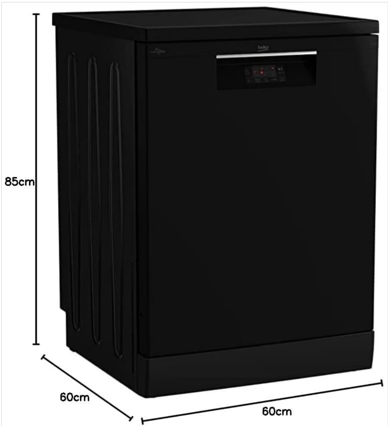
Image: Front-side view of the Beko BDFN15420B dishwasher with labeled dimensions: 85cm height, 60cm width, and 60cm depth. This illustrates the physical size of the appliance for installation planning.

Place the dishwasher on a level, stable floor. Ensure there is adequate space for the door to open fully. The appliance dimensions are approximately 60 cm (width) x 60 cm (depth) x 85 cm (height).