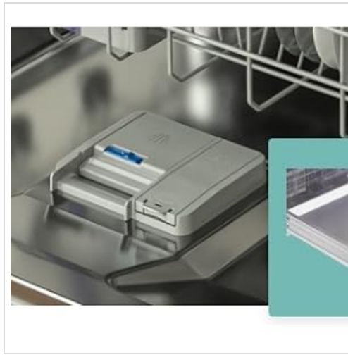
Image: A detailed view of the dishwasher's detergent dispenser compartment, showing where to add detergent for a wash cycle.