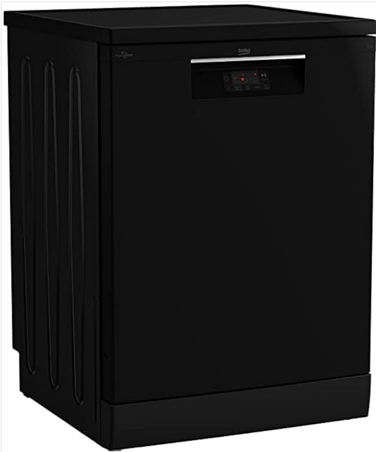
Image: Front-side view of the Beko BDFN15420B freestanding dishwasher in black, showcasing its sleek design and control panel.