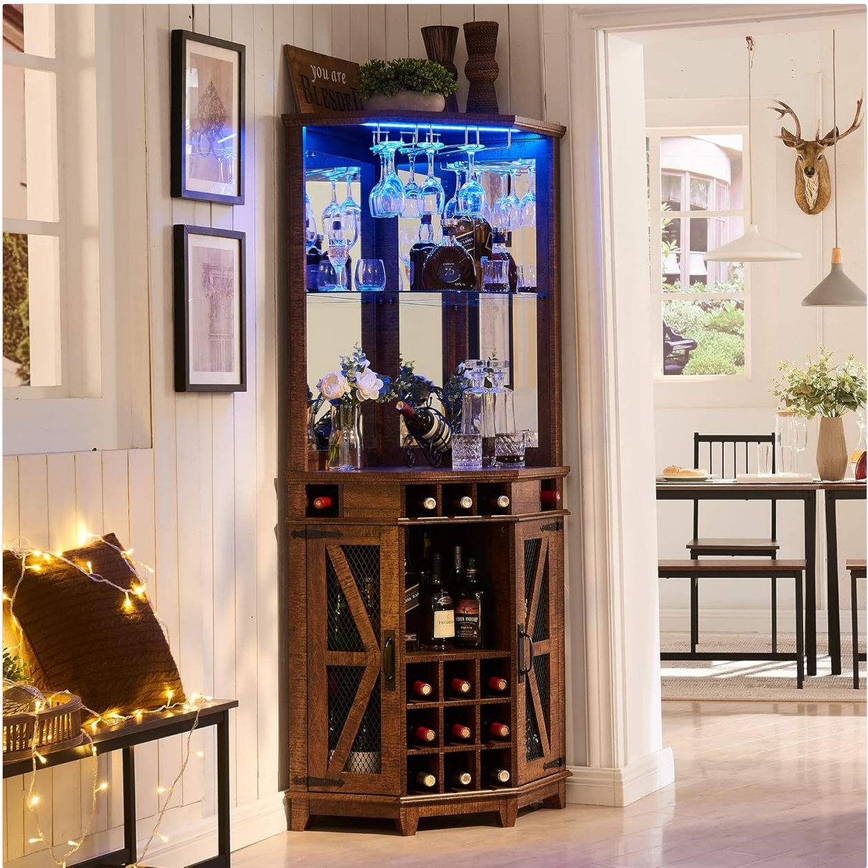
Image 1.1: The OKD 72" Tall Corner Bar Storage Cabinet, showcasing its design and storage capabilities.