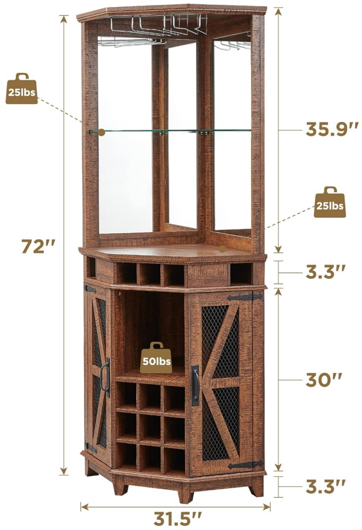
Image 4.1: Product dimensions and weight distribution for planning placement.