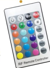
Image 5.1: Adjustable LED lighting system with various color and mode options.