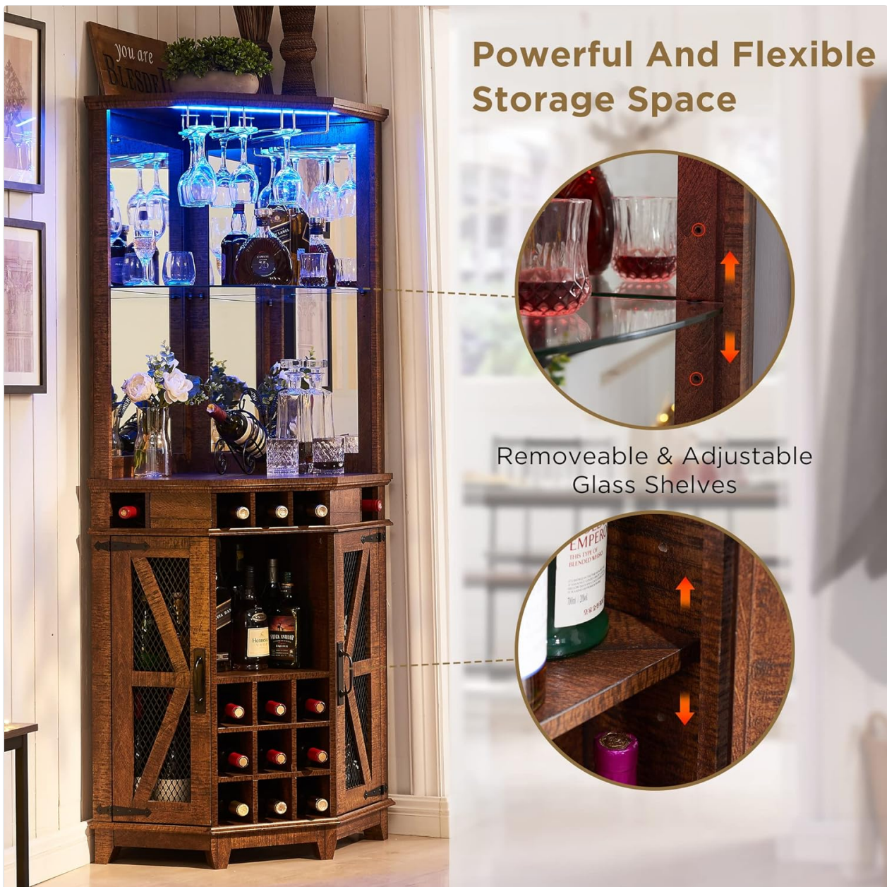
Image 5.2: Removable and adjustable glass shelves for flexible storage.