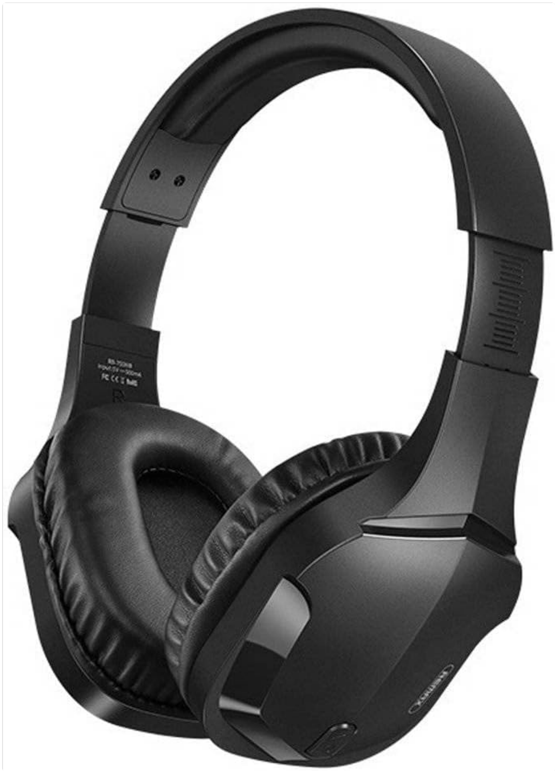
Image 1: Front view of the Remax RB-750HB Wireless Gaming Headphones in black. This image displays the overall design, including the earcups and adjustable headband.