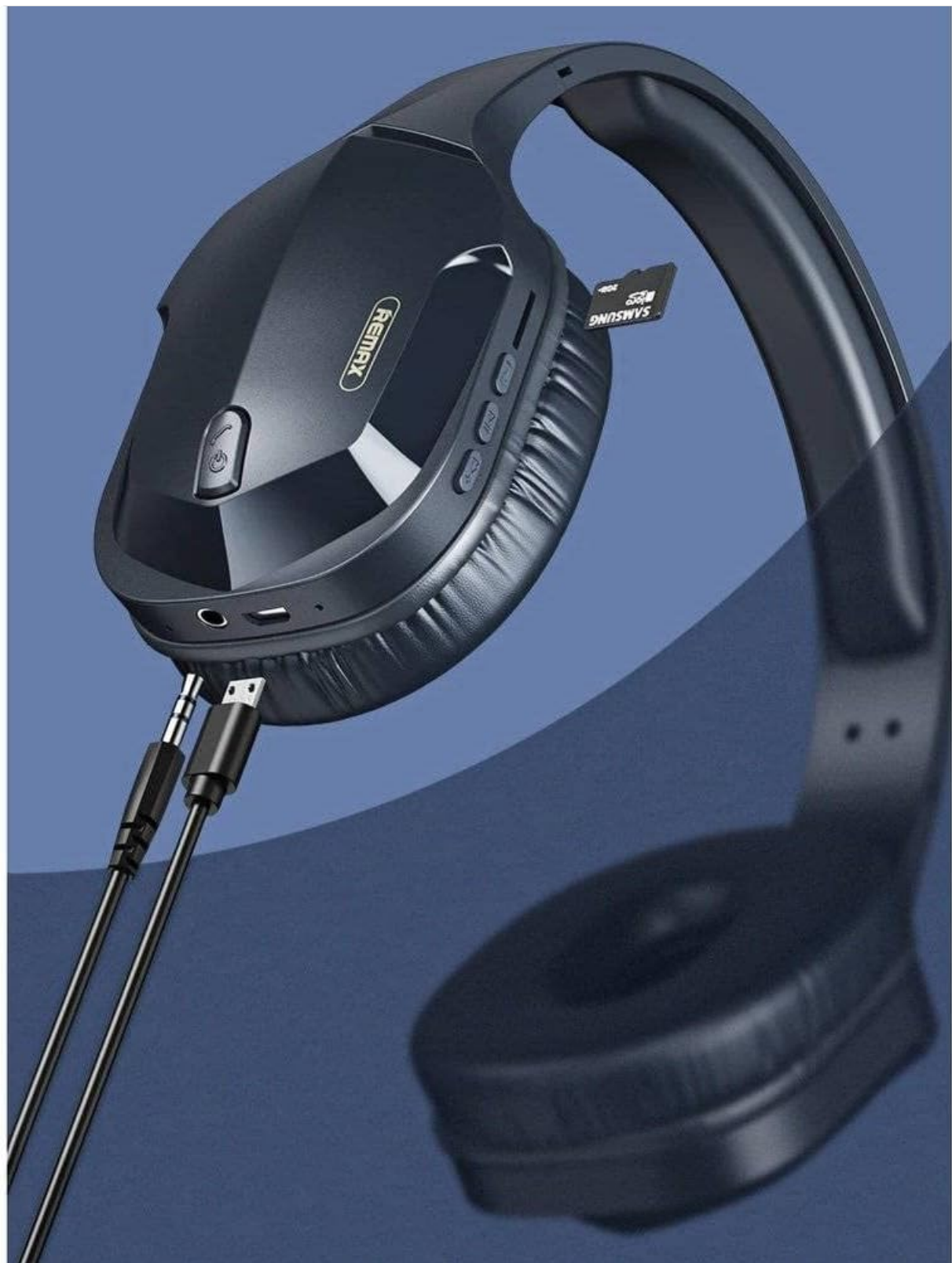
Image 2: Side view of the headphone showing the 3.5mm audio input, USB-C charging port, and the TF (MicroSD) card slot. A TF card is shown inserted into the slot, and audio cables are connected to the 3.5mm port.