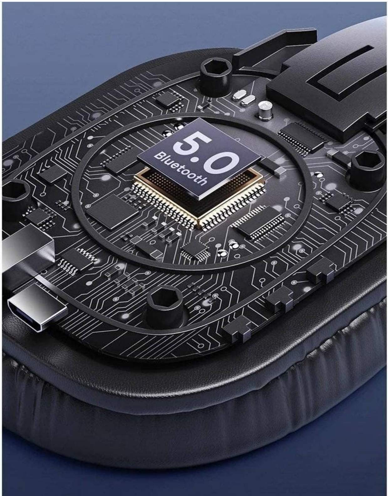
Image 4: Diagram illustrating the internal Bluetooth 5.0 chip and circuit board, highlighting the advanced wireless connectivity of the headphones.