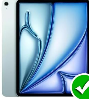
iPad Air 13 inch, 2024 (M2)