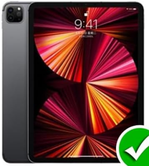
iPad Pro 12.9. 5th Gen (A2378,A2379,A2461,A2462)