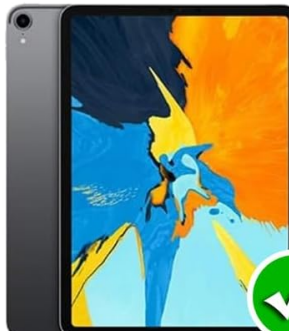
iPad Pro 12.9, 4th Gen (A2229.A2069,A2232.A2233)