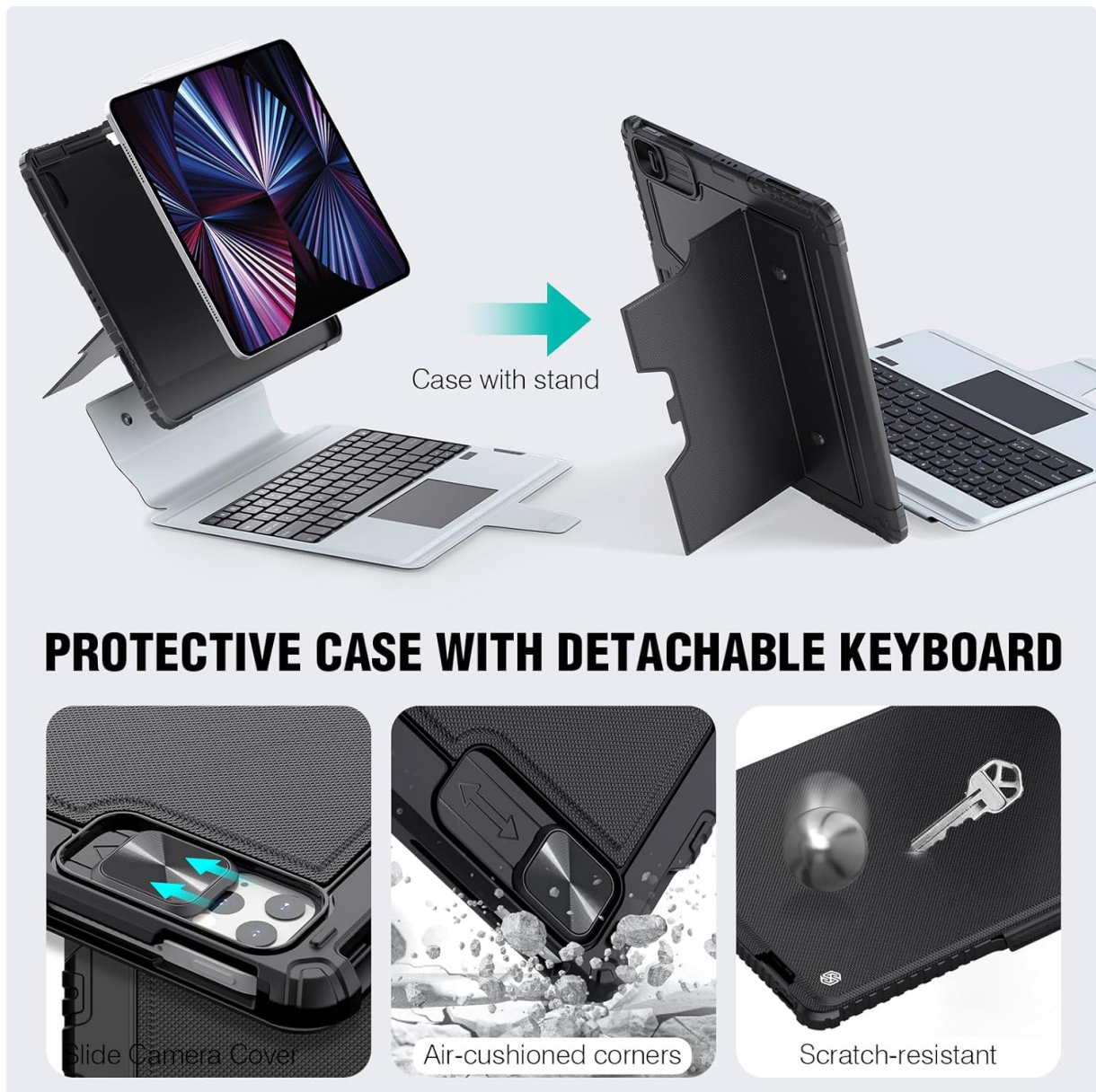
Image: The keyboard and tablet case shown separately, demonstrating the detachable design.