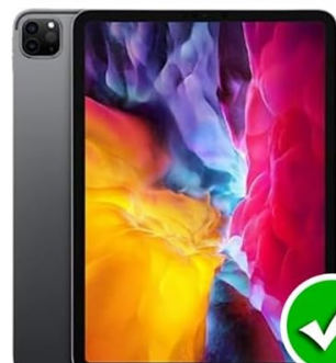
iPad Pro 12.9. 3rd Gen (A1876.A2014.A1895,A1983)