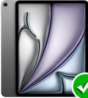
iPad Air 13 inch, 2025 (M3)