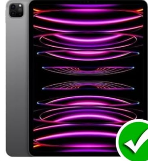
iPad Pro 12.9. 6th Gen (A2436,A2437,A2764,A2766)