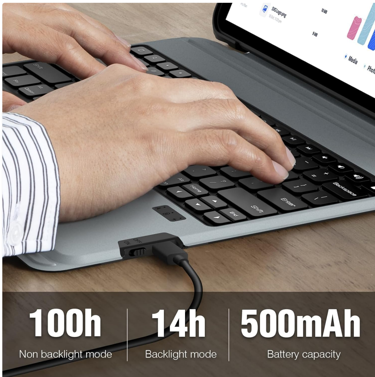
Image: Details on the keyboard's battery capacity and usage duration.