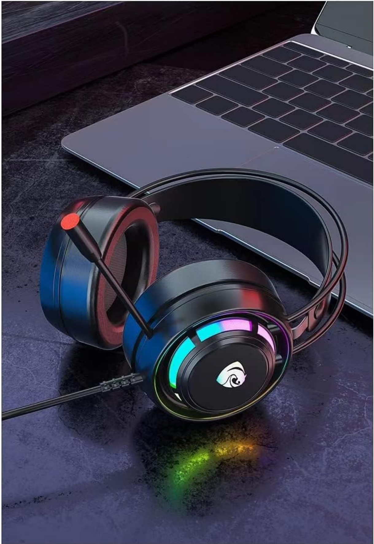
Image: The COOLBABY PANSEN PSH-300 headset connected to a laptop, illustrating a typical setup scenario.