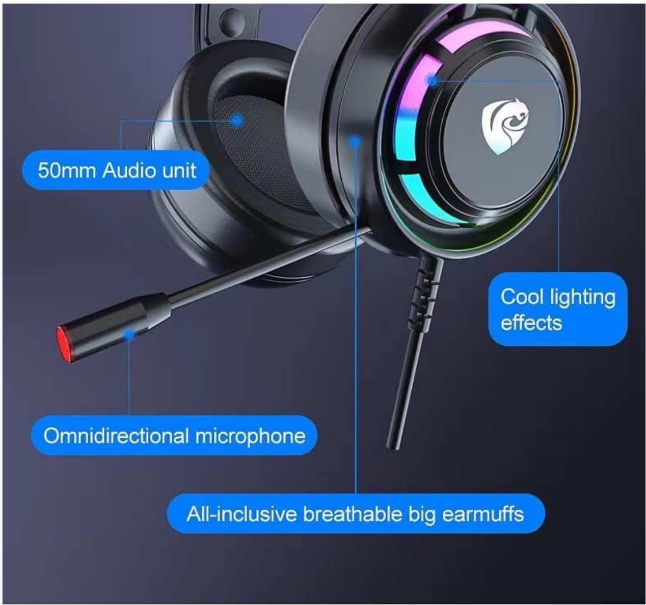
Image: A detailed diagram highlighting the key features of the PSH-300 headset, including telescopic adjustment, double beam suspension, 50mm audio unit, omnidirectional microphone, cool lighting effects, and all-inclusive breathable big earmuffs.