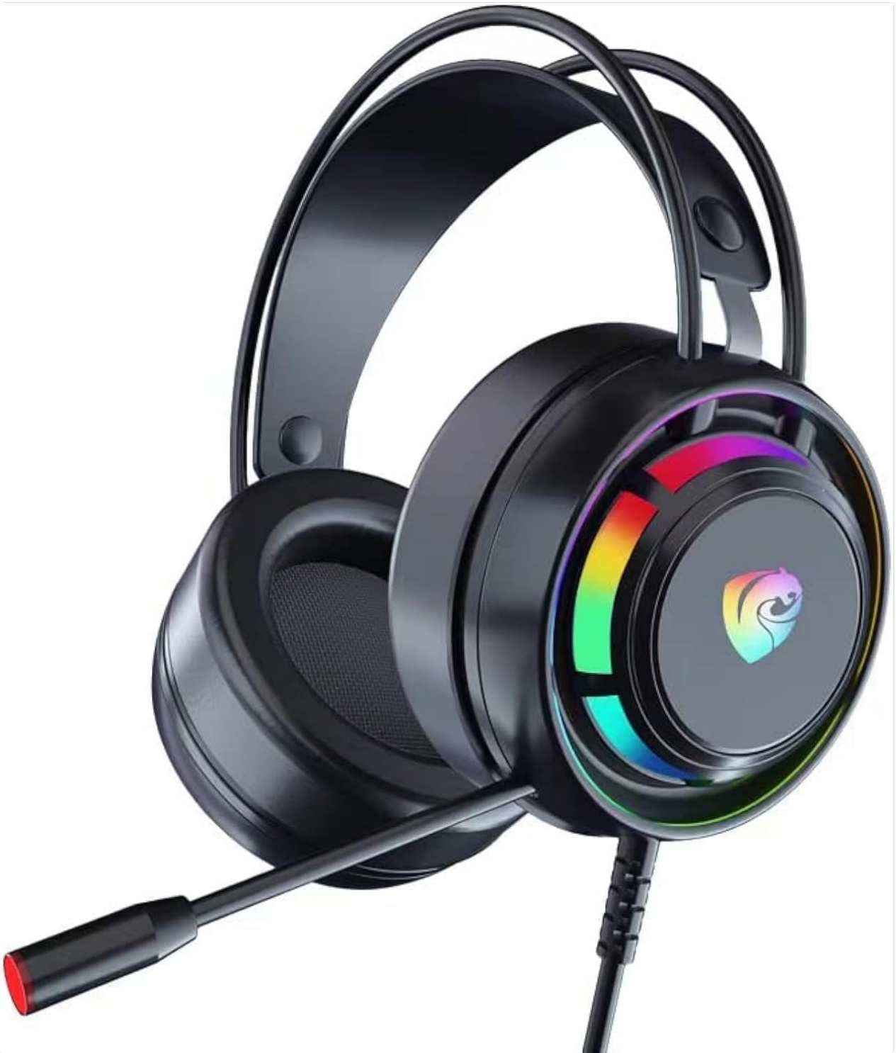
Image: The COOLBABY PANSEN PSH-300 Gaming Headset, showcasing its black design with RGB lighting on the earcups and an attached microphone.