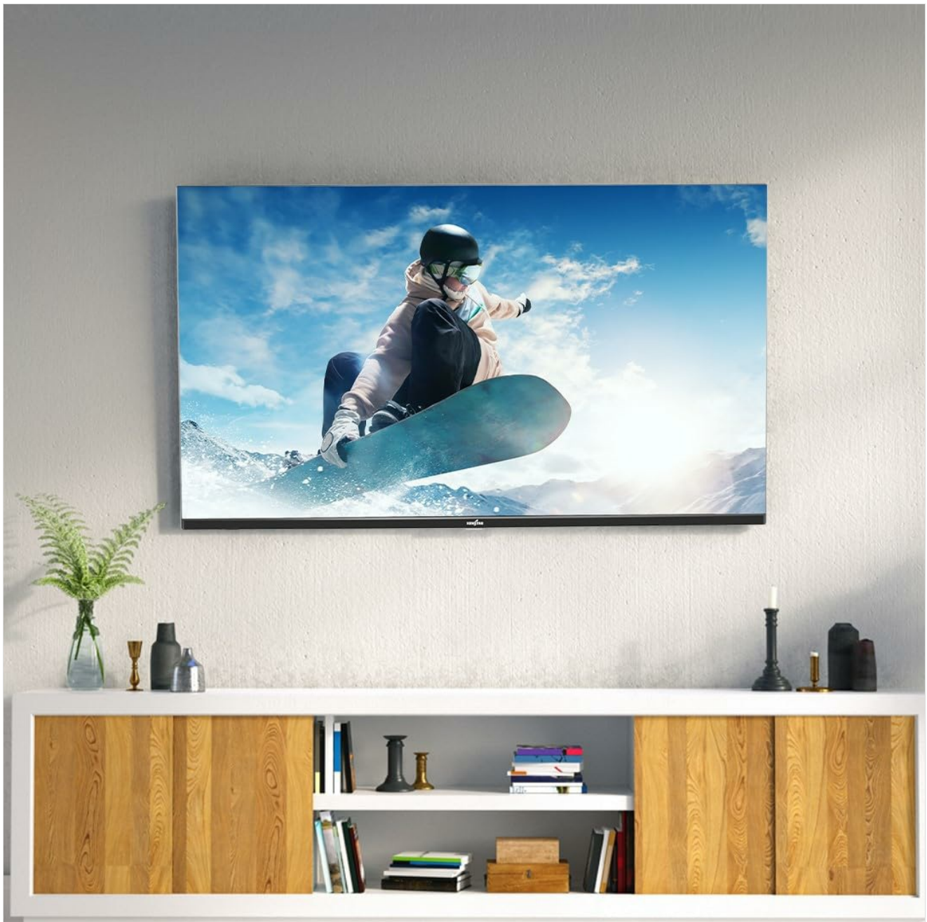
Physical dimensions of the Kenstar 43-inch TV.