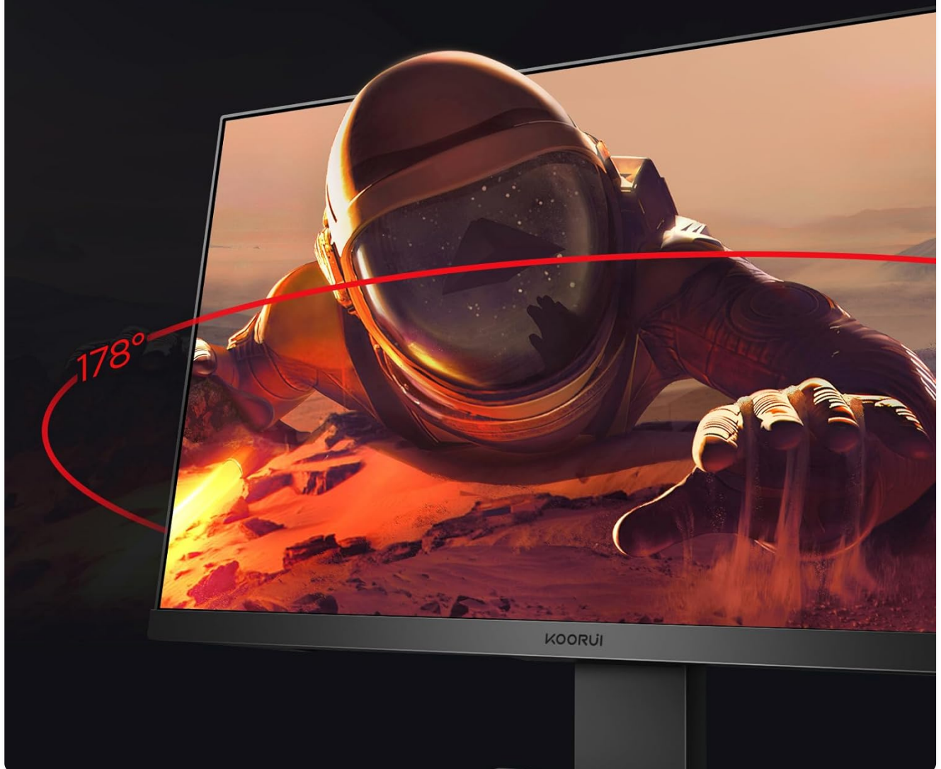
Figure 6: Wide Viewing Angle