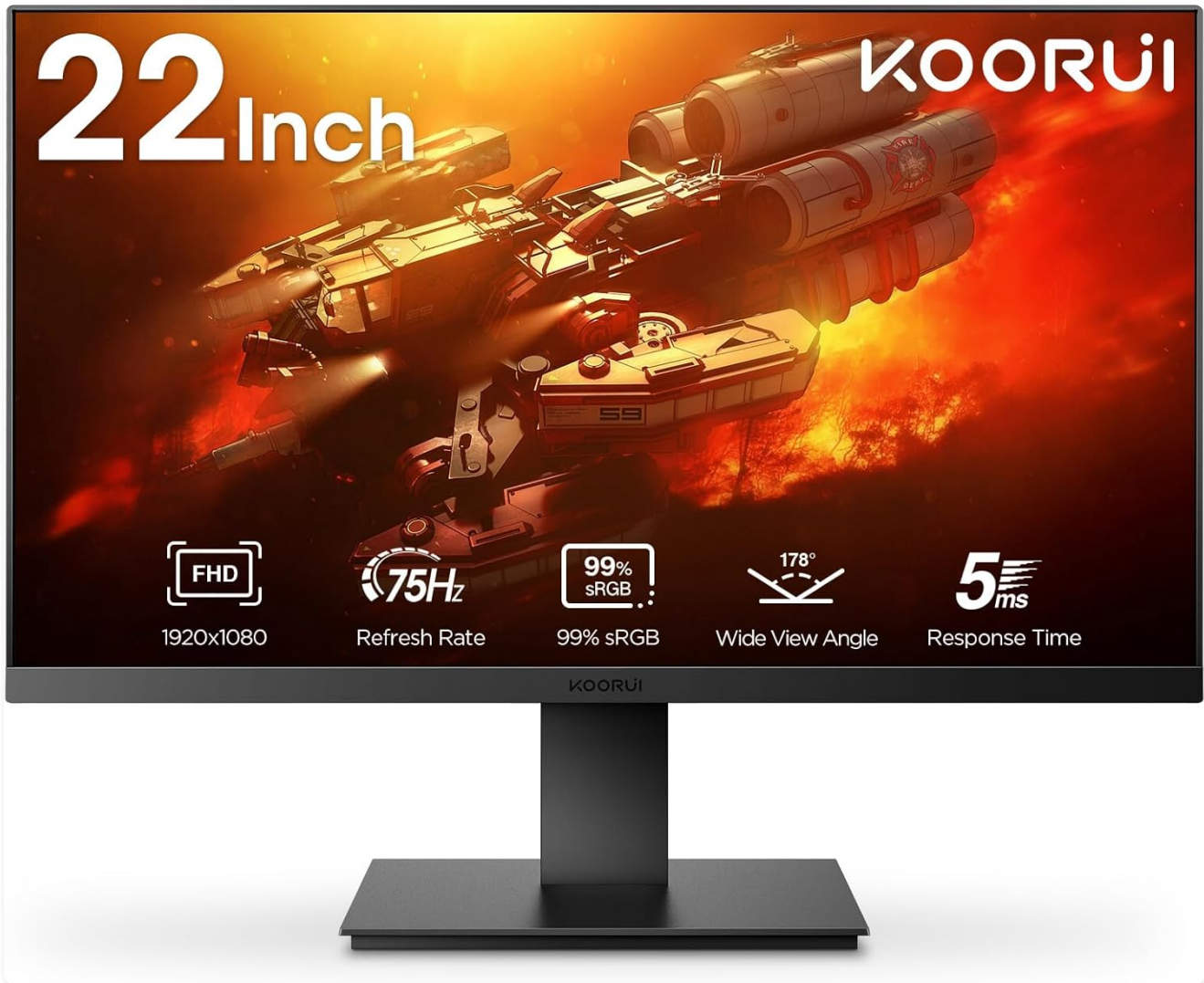
Figure 1: KOORUI 22 Inch Computer Monitor Overview