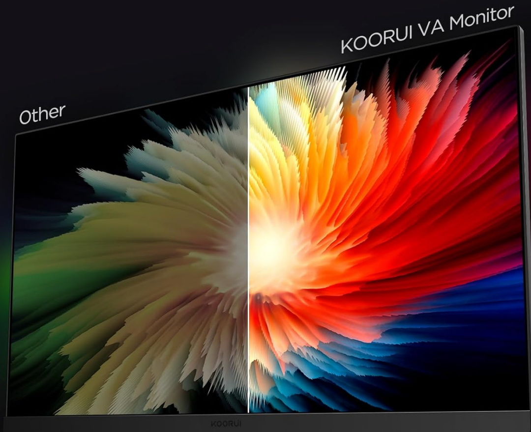
Figure 7: Enhanced Color Reproduction

It offers improved color reproduction, wider viewing angles and better color consistency.