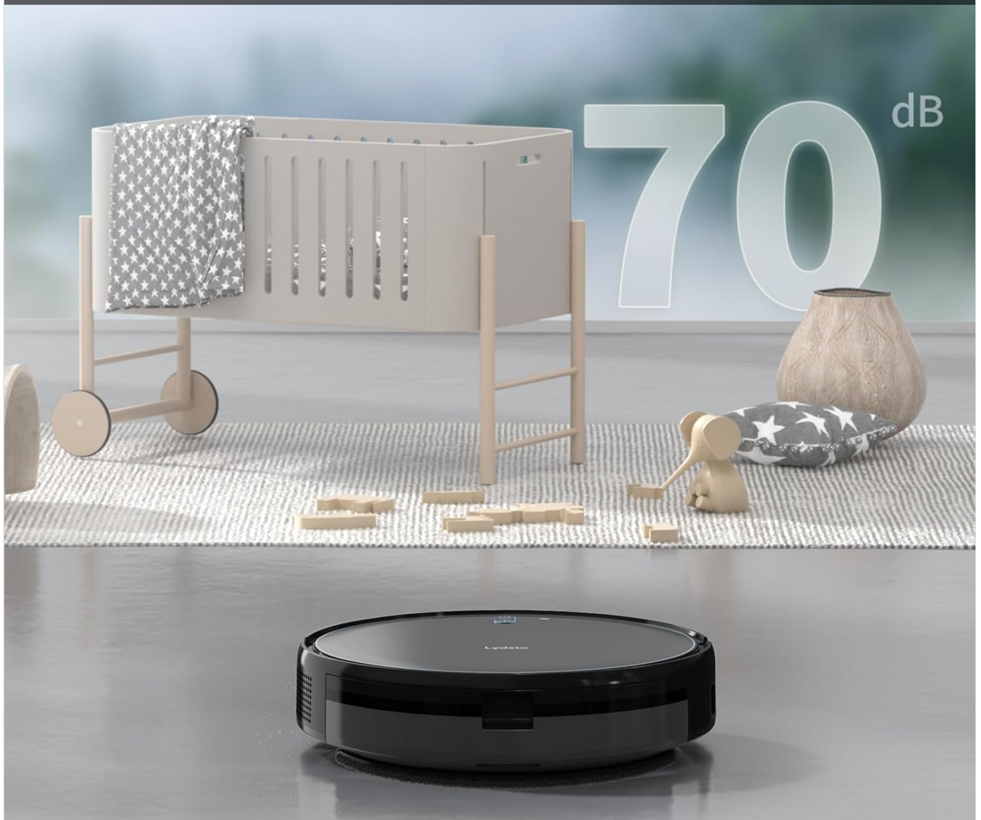
Figure 5.2: The Lydsto G4 Robot Vacuum operating quietly in a room. The brushless motor ensures a low noise level of approximately 70dB, allowing for a comfortable home environment during cleaning.

With brushless motor A new experience of light sound & low noise