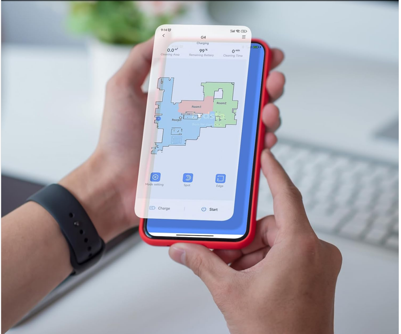
Figure 3.2: A user interacting with the Lydsto mobile application on a smartphone. The app displays a detailed cleaning map of the home, allowing for real-time monitoring and customization of cleaning areas and schedules.

The Lydsto G4 features a circular design with integrated sensors for navigation and obstacle avoidance. It includes a dustbin for vacuumed debris and a water tank for mopping. Control is available via the included remote control or the dedicated Lydsto mobile application.