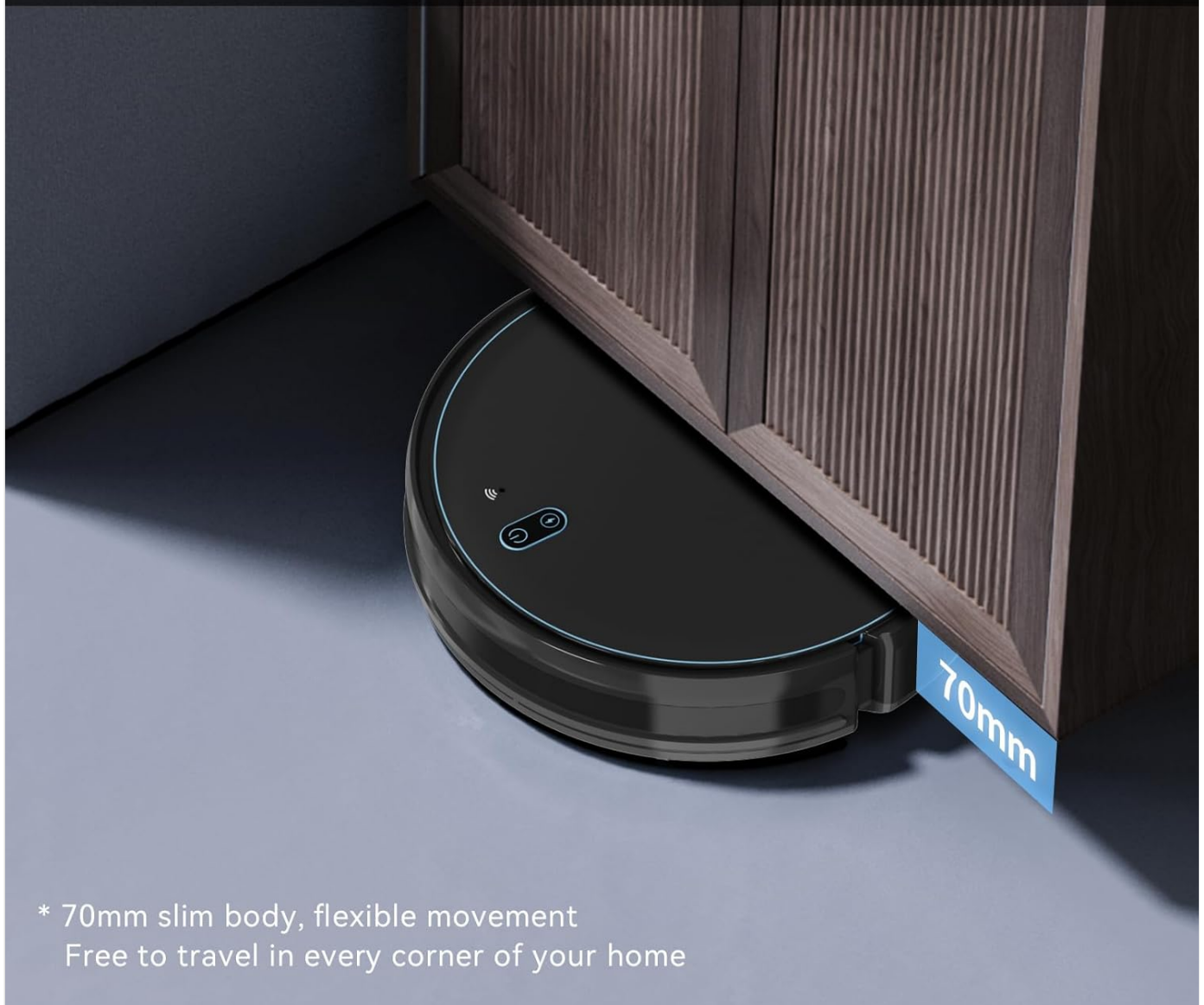
Figure 5.1: The Lydsto G4 Robot Vacuum demonstrating its ability to clean under low furniture. Its 70mm slim body allows it to access hard-to-reach areas, ensuring comprehensive cleaning throughout your home.