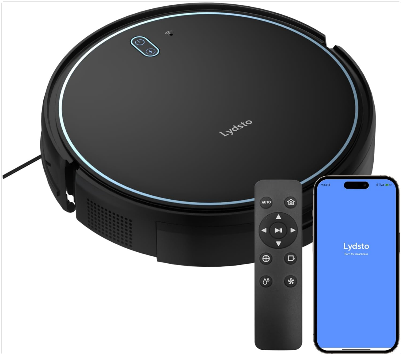
Figure 3.1: The Lydsto G4 Robot Vacuum, accompanied by its remote control and a smartphone displaying the Lydsto application. This image illustrates the primary components included with the device, highlighting its compact design and various control options.