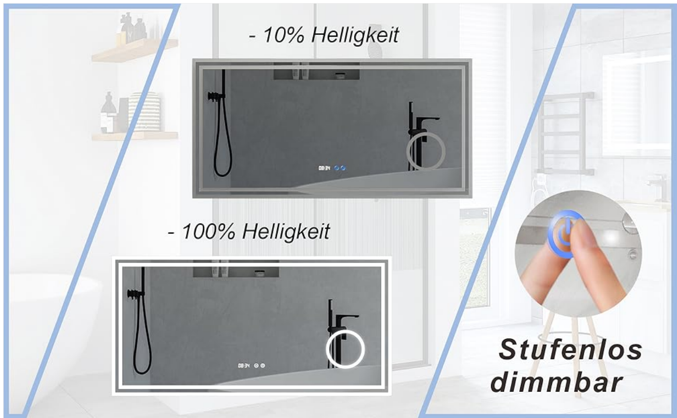
Image 5: The 3x magnifying cosmetic mirror with integrated lighting.

The integrated 3x magnifying mirror, equipped with LED light strips, is ideal for detailed tasks such as makeup application or shaving.