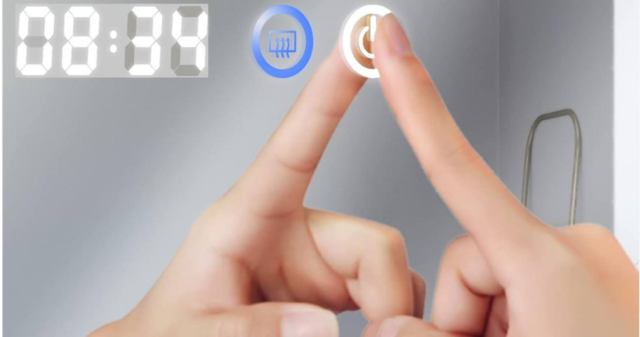
Image 6: Detailed view of the touch controls for light, anti-fog, and digital clock.