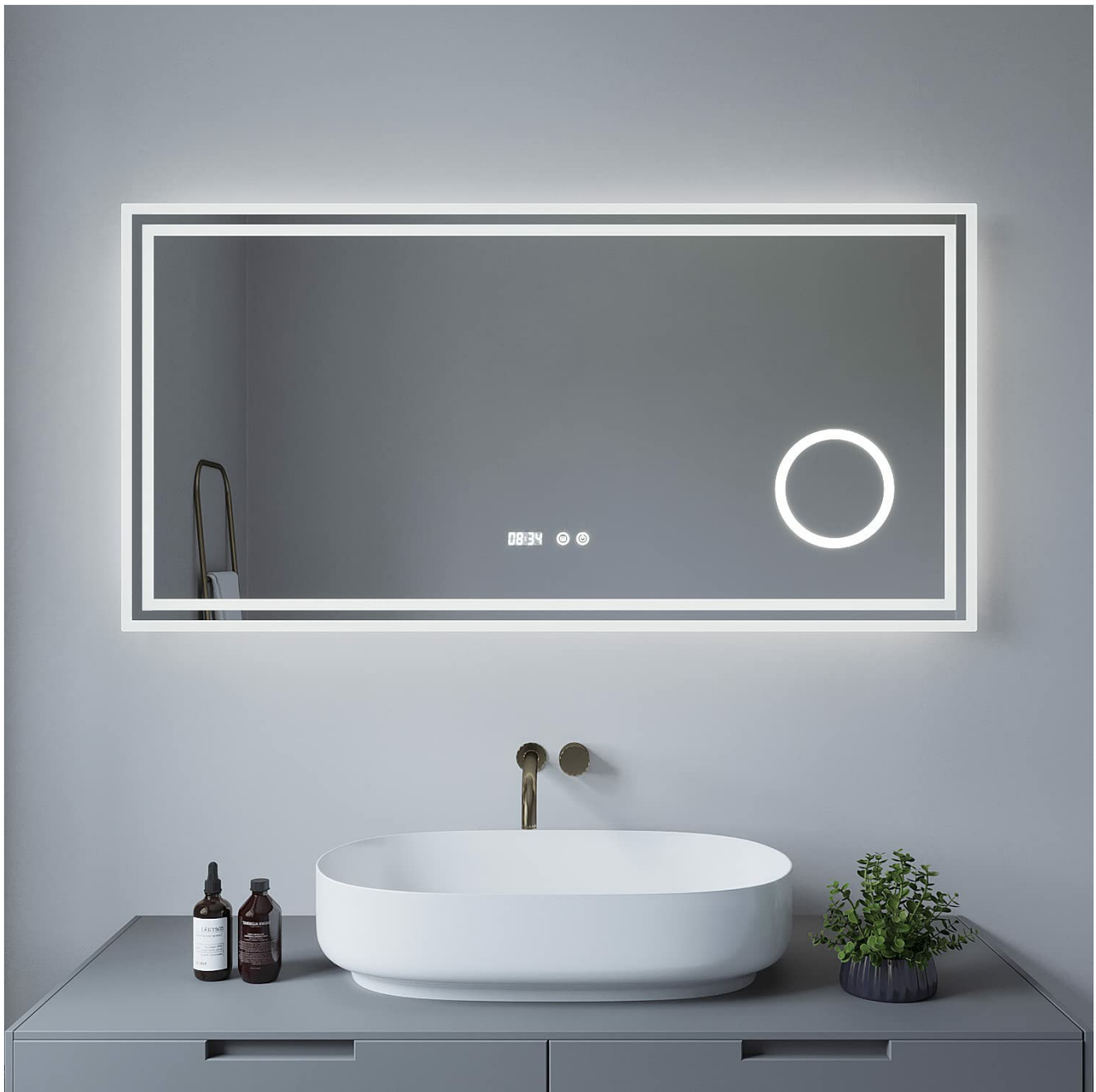
Image 1: AQUABATOS Essens Series Bathroom Mirror (120x60cm) with illuminated features.