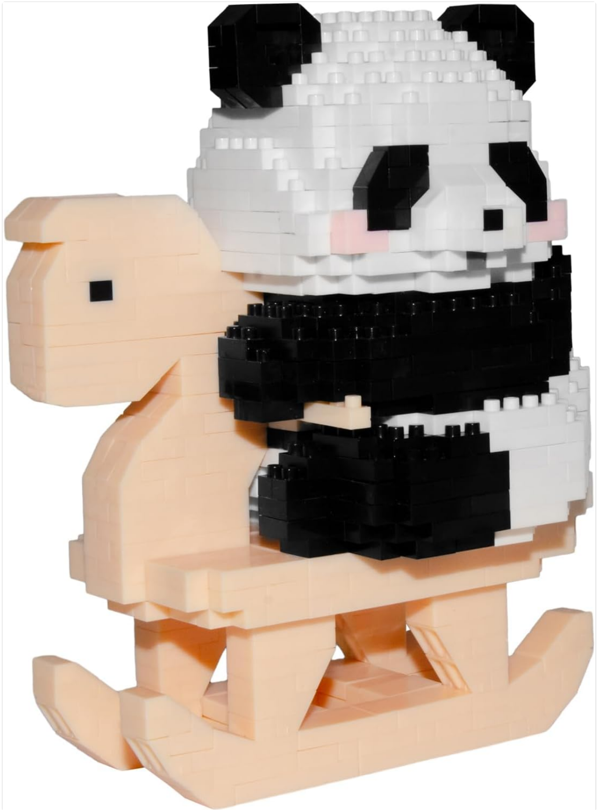
Figure 4.2: An example of a completed panda figure on a rocking horse, showcasing the intricate details achievable with micro building blocks.