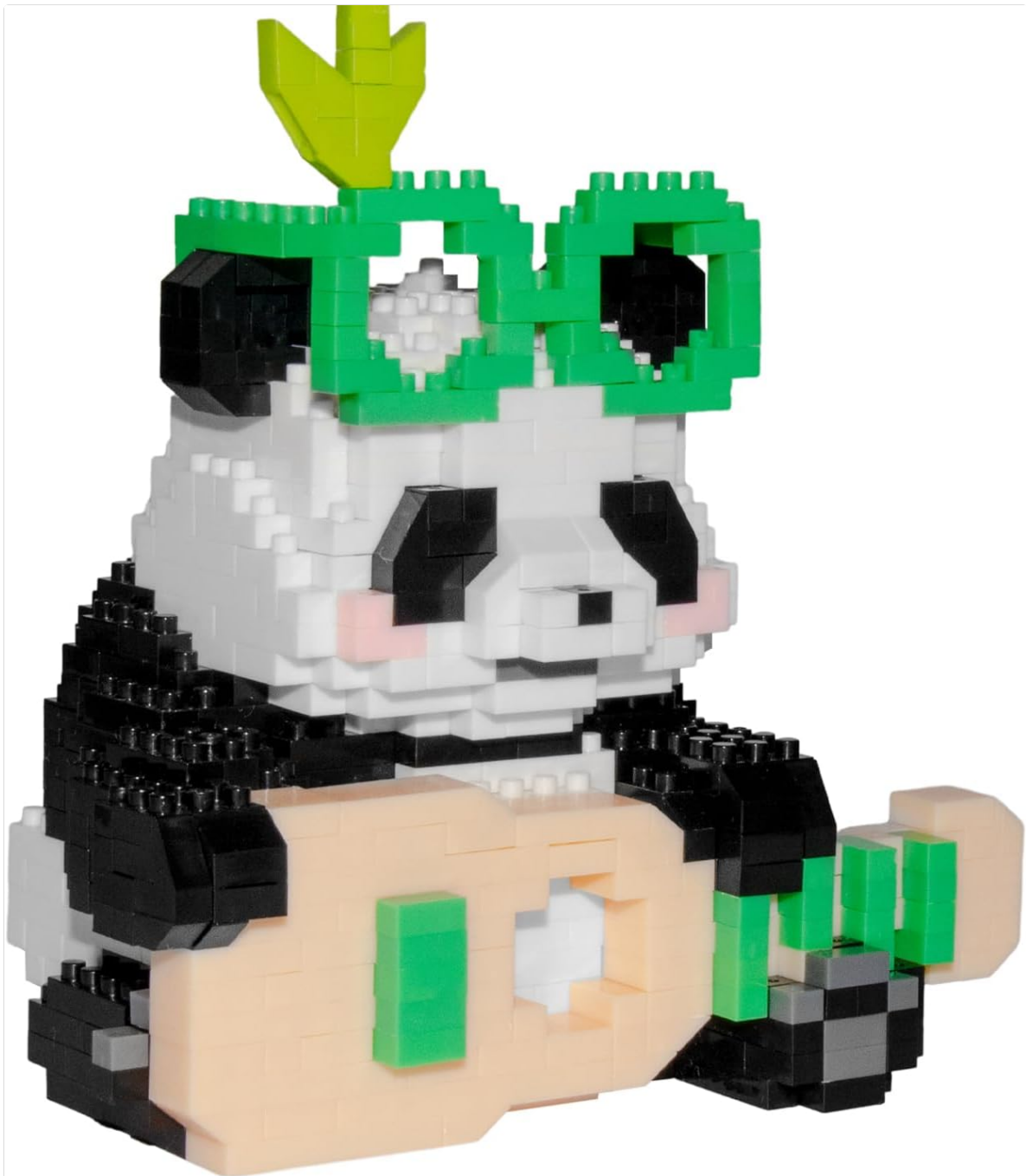
Figure 4.3: Another completed panda figure, this one adorned with green glasses and holding a small instrument, demonstrating the creative possibilities.